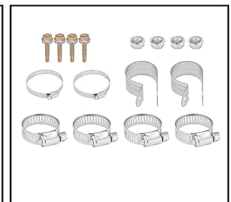
Image: The diagram illustrates the main heater unit with dimensions (approximately 16.2in/41cm length, 10in/25.4cm width, 11.8in/30cm height) and various accessories included in the box, such as the LCD controller, remote control, air filter, muffler, exhaust pipe, and clamps.