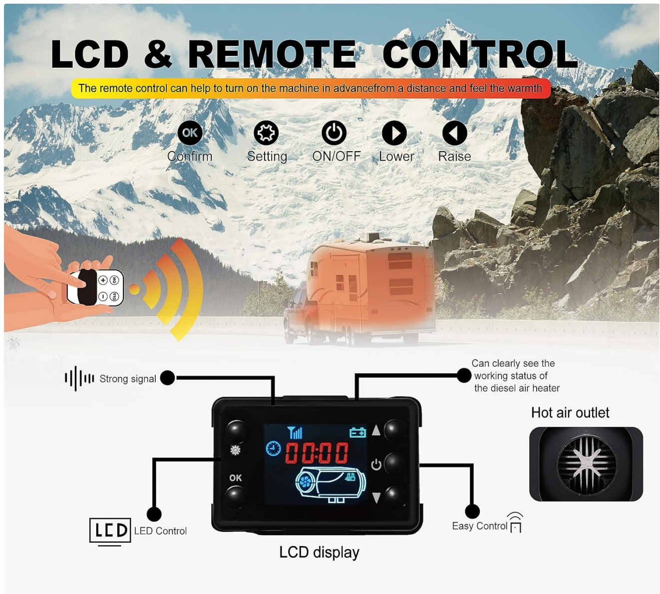
Image: A detailed view of the LCD control panel and remote control, showing button functions and how to monitor the heater's