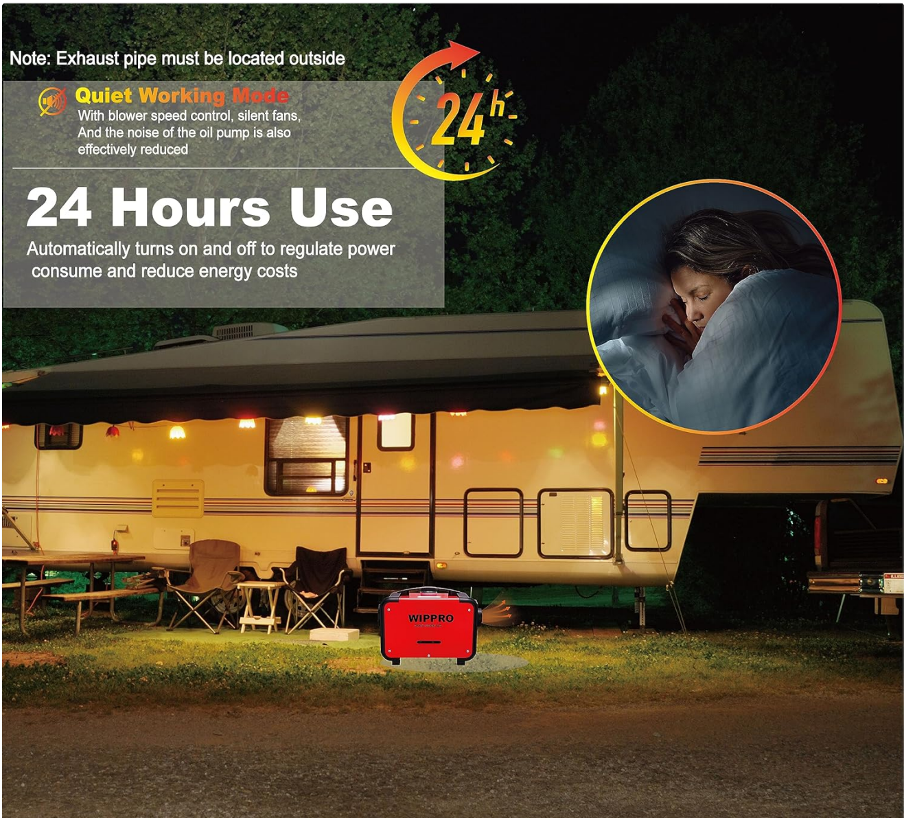
Image: The heater is designed for quiet operation, but the exhaust pipe must always be located outside to ensure safety.