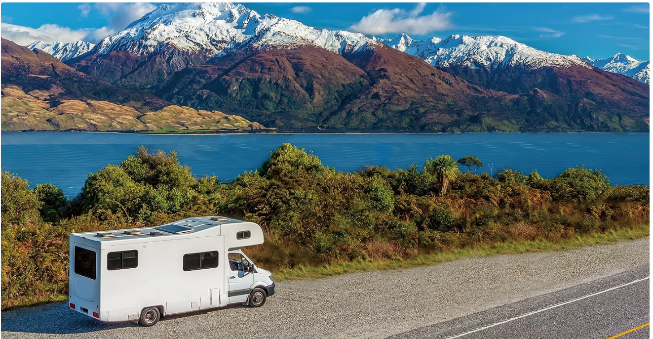
Image: The WIPPRO Diesel Heater is suitable for various mobile applications, including RVs, providing warmth in diverse environments.

This manual provides essential information for the safe and efficient operation, installation, and maintenance of your WIPPRO 8KW 12V All-in-One Diesel Air Heater. Please read this manual thoroughly before using the product and retain it for future reference. This heater is designed to provide warmth in various environments such as campers, RVs, trucks, boats, and other outdoor or mobile settings.