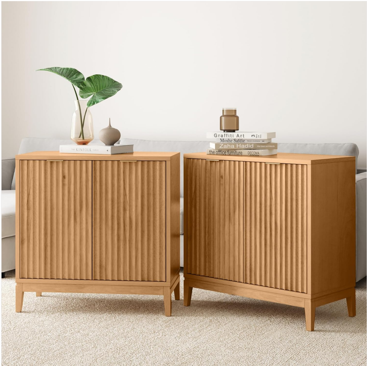
Image: Two Jasper Warm Pine cabinets positioned side-by-side in a modern living room, showcasing their fluted doors and warm wood finish.