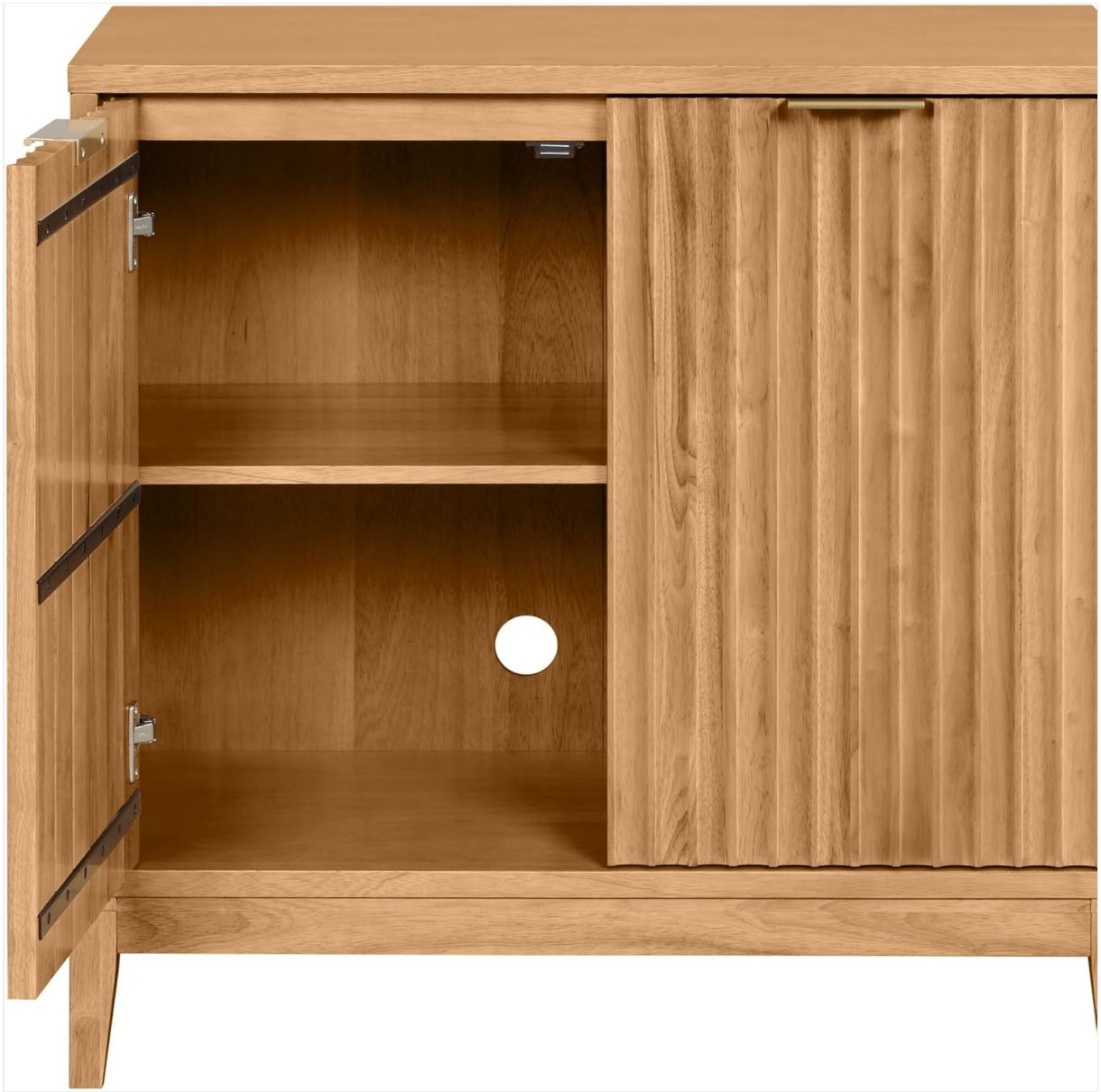
Image: An open Jasper cabinet revealing its interior with two adjustable shelves and a circular cutout in the back panel for cable management.