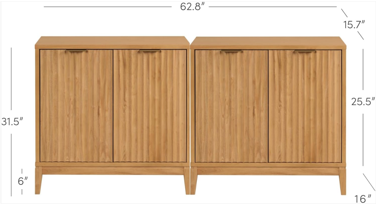
Image: A technical drawing illustrating the precise dimensions of the Jasper cabinet, including height, width, and depth