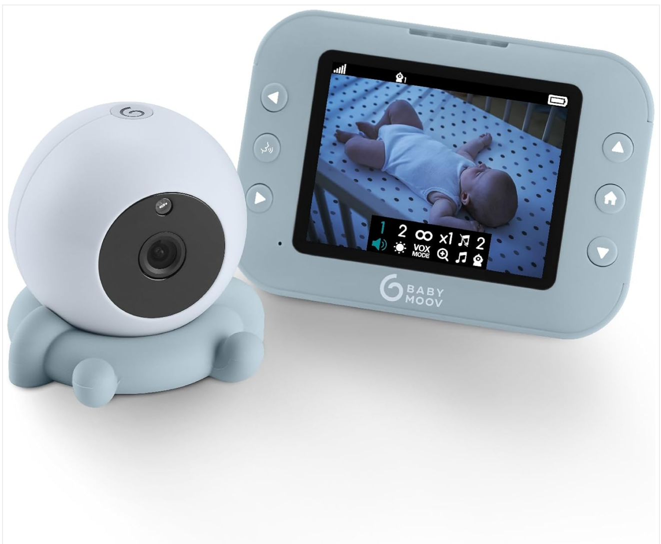
Figure 4.1: Babymoov YOO Roll Baby Monitor - Camera and Parent Unit.

The Babymoov YOO Roll consists of two main units: the Baby Unit (camera) and the Parent Unit (monitor).