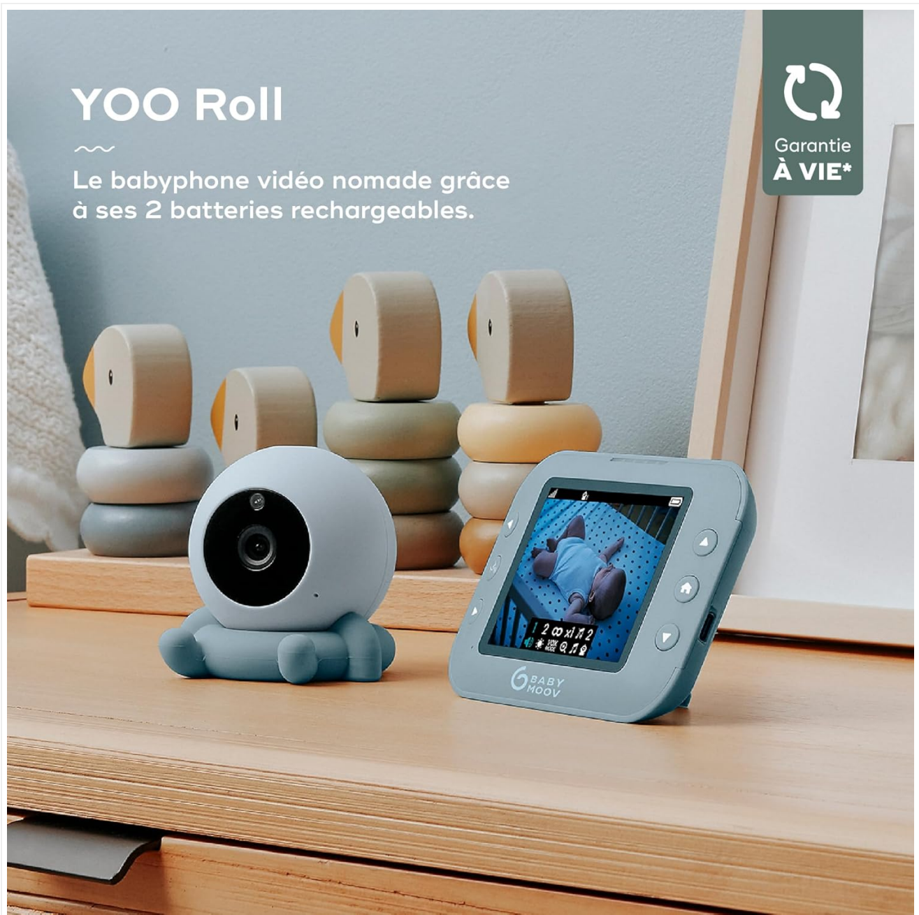
Figure 10.1: Babymoov YOO Roll with Lifetime Warranty.

The Babymoov YOO Roll baby monitor is backed by a Lifetime Warranty as part of Babymoov's commitment to eco-responsible design and product longevity. To activate the lifetime warranty, product registration is required within 2 months of purchase. Please refer to the official Babymoov website for detailed terms and conditions regarding warranty registration and claims.