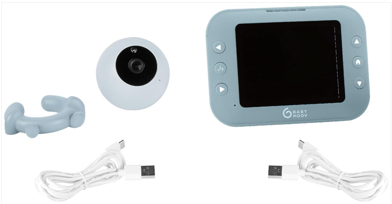
Figure 3.1: Package Contents - Baby Unit, Parent Unit, and USB-C cables.