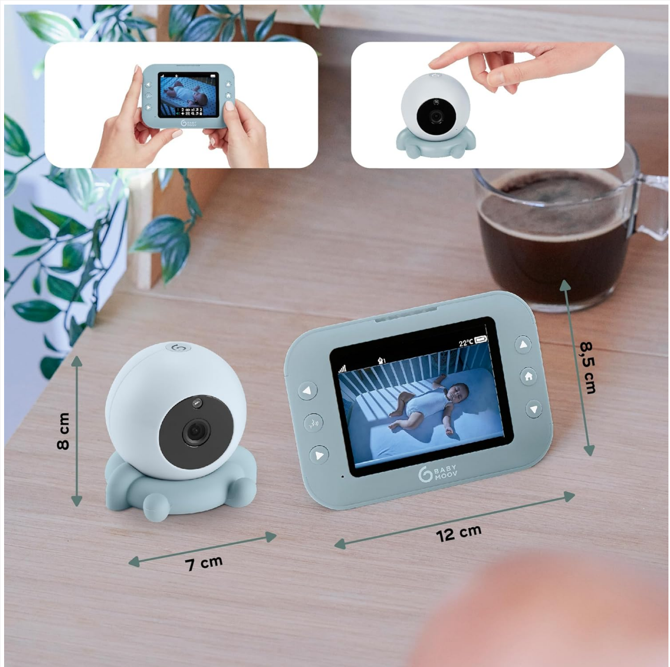
Figure 4.2: Baby Unit (Camera) in a nursery setting, highlighting night vision.