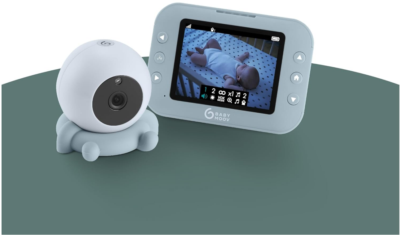
Figure 5.1: Both units are powered by rechargeable batteries for ultimate freedom.