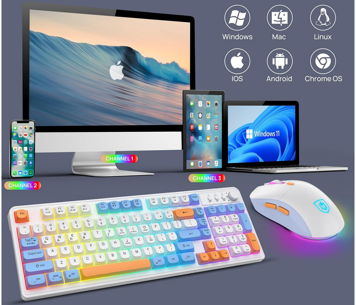
Image: The keyboard demonstrating multi-device compatibility across Windows, Mac, iOS, Android, and Chrome OS via three Bluetooth channels.