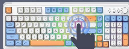
Image: The keyboard displaying various RGB backlight effects, including different modes and color transitions.