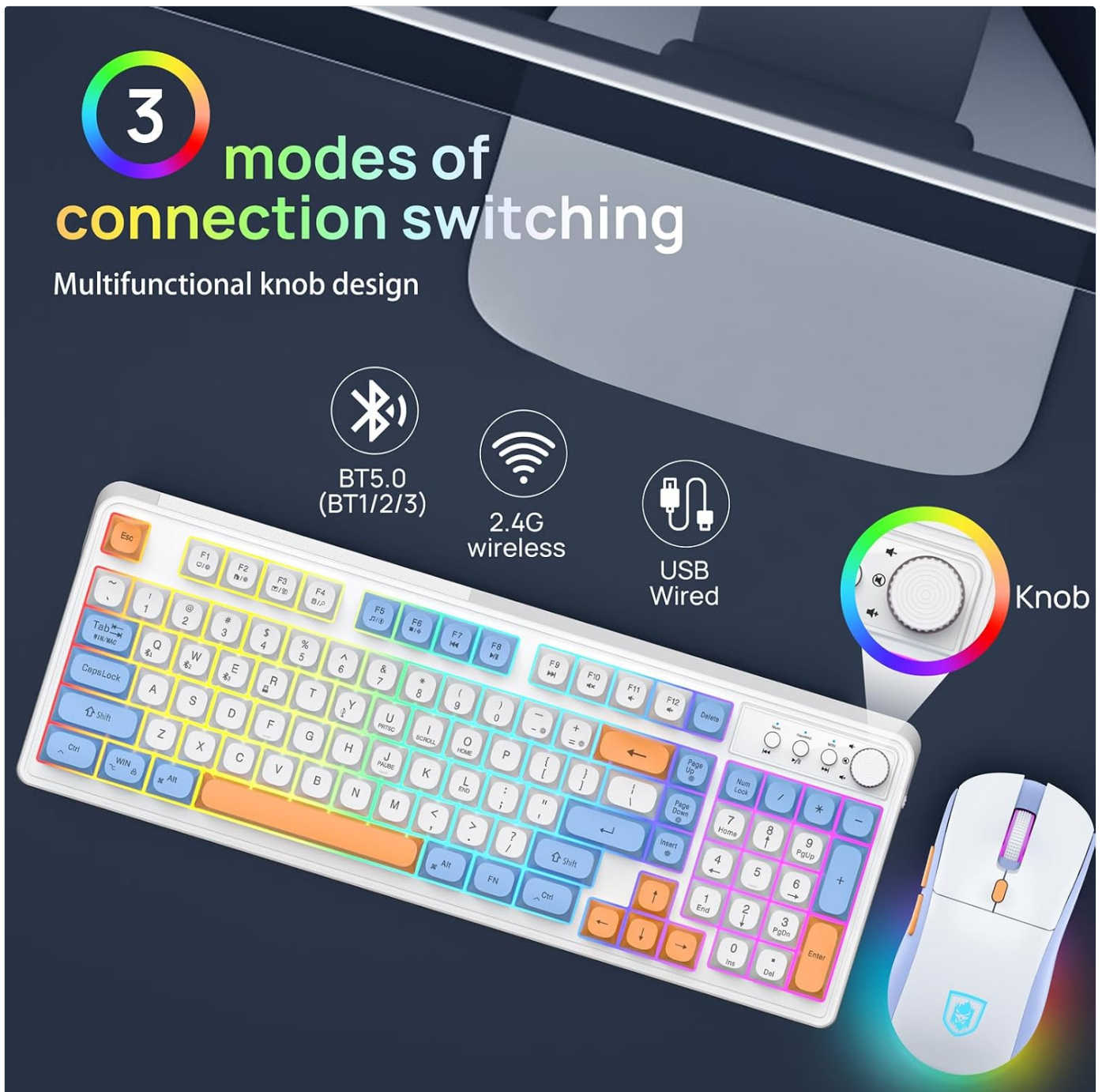
Image: Visual representation of the three connection modes available for the keyboard and mouse: Bluetooth, 2.4G Wireless, and USB Wired.