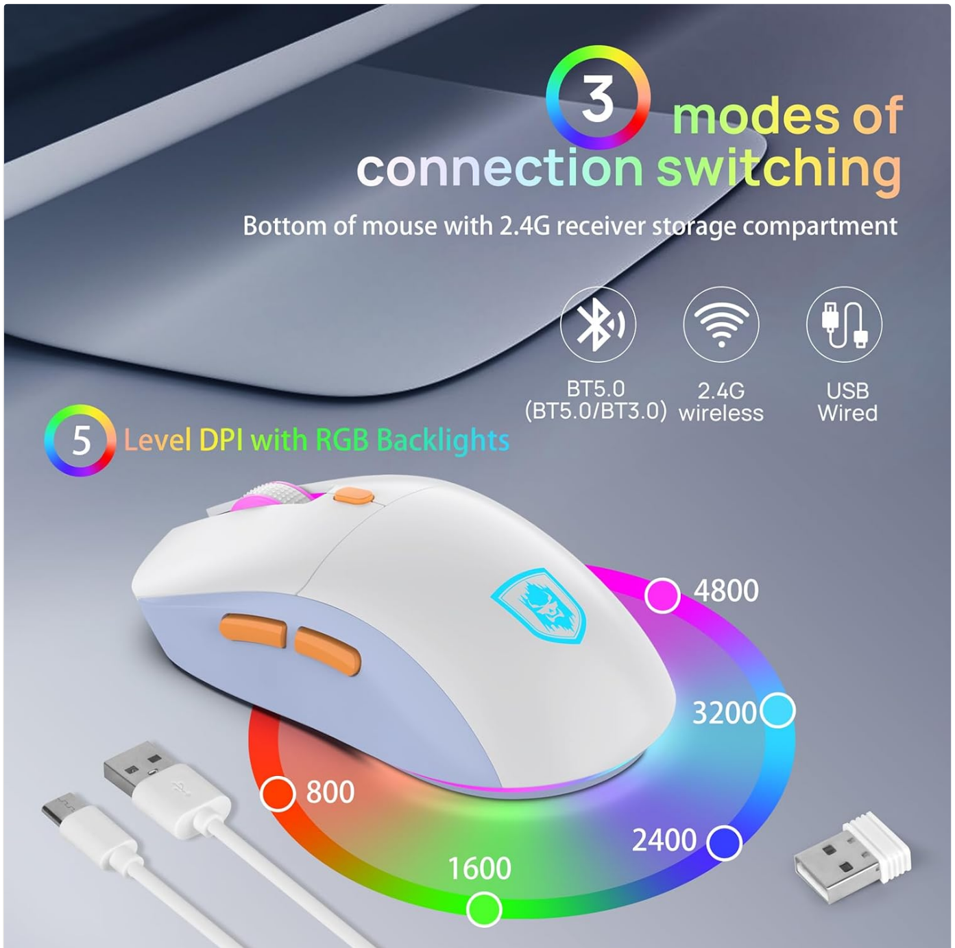
Image: The mouse highlighting its 5 adjustable DPI levels and the location of the DPI switch.