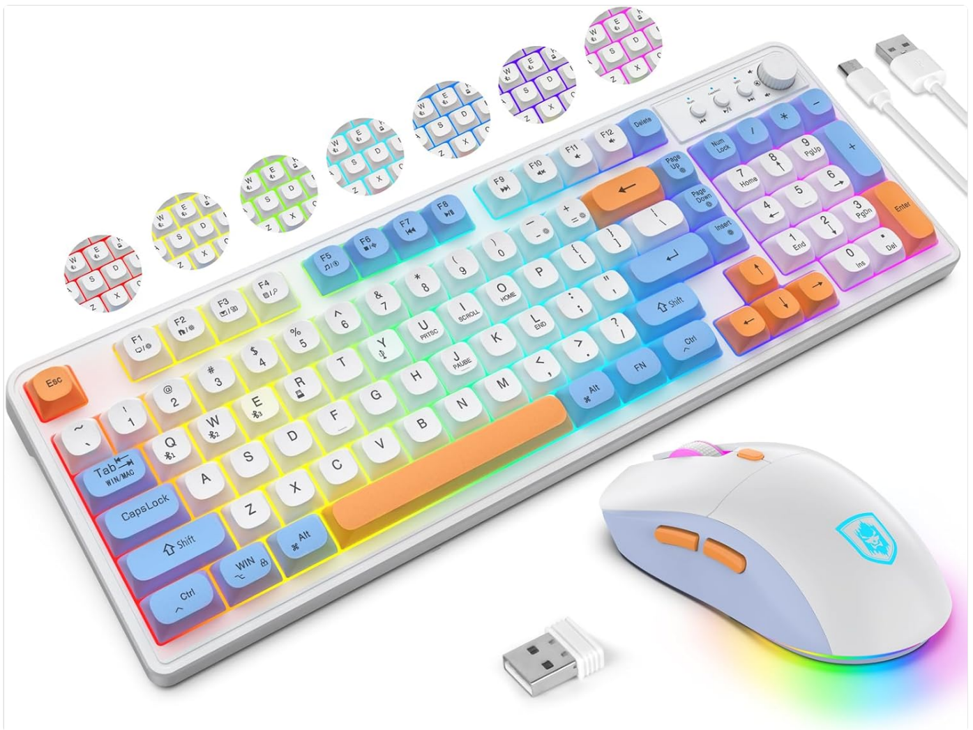
Image: Contents of the KOLMAX BT98 package, including the keyboard, mouse, cables, and USB receiver.