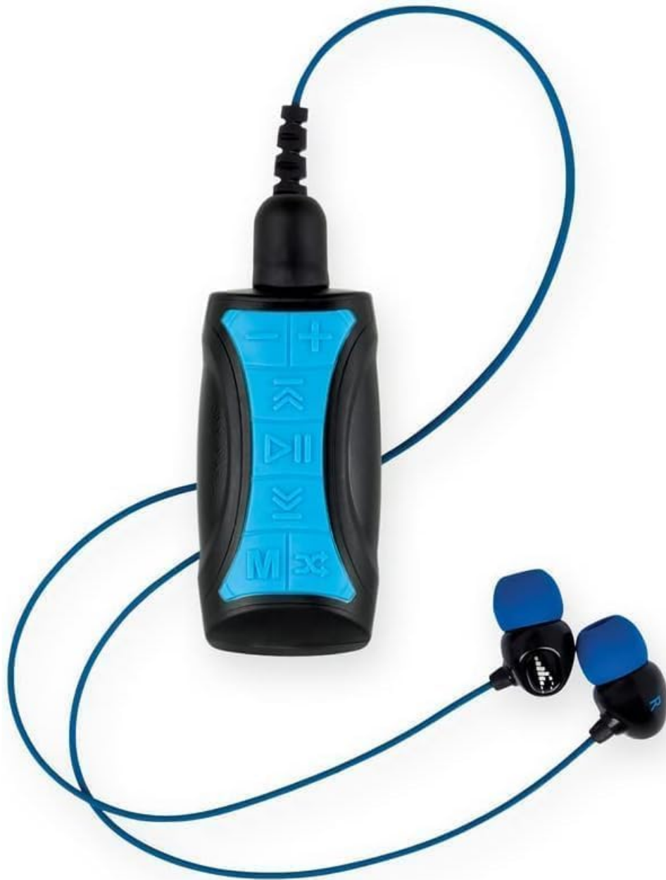
Image: The H2O Audio Stream 3 PRO player connected to Surge S+ Earbuds, showcasing the compact design and short cord.