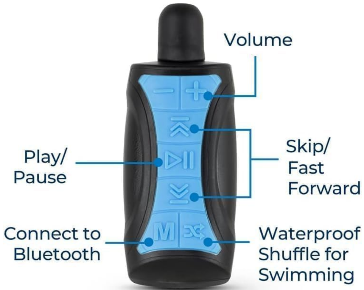
Image: Diagram illustrating the functions of each button on the H2O Audio Stream 3 PRO player.