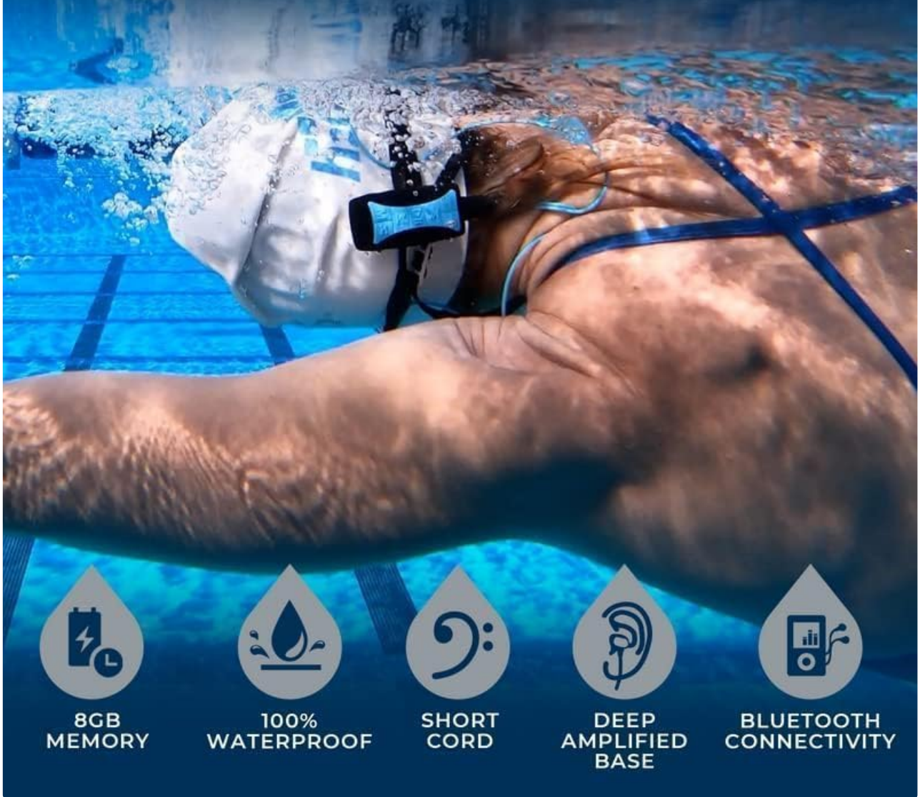
Image: An illustration showing the H2O Audio Stream 3 PRO in use by a swimmer, highlighting features like 8GB memory, 100% waterproof, short cord, deep amplified bass, and Bluetooth connectivity.