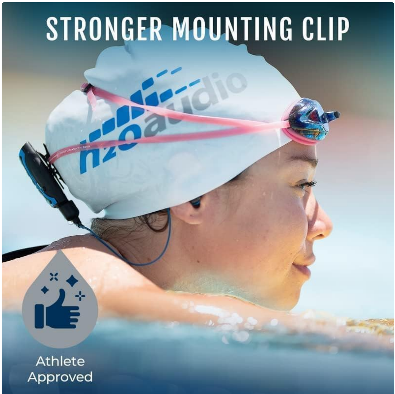
Image: A swimmer wearing the H2O Audio Stream 3 PRO attached to goggles, highlighting the secure mounting clip. The short cord design of the Surge S+ headphones (approximately 1 ft/30 cm) is optimized for mounting the player to your head or goggle strap, minimizing entanglement.