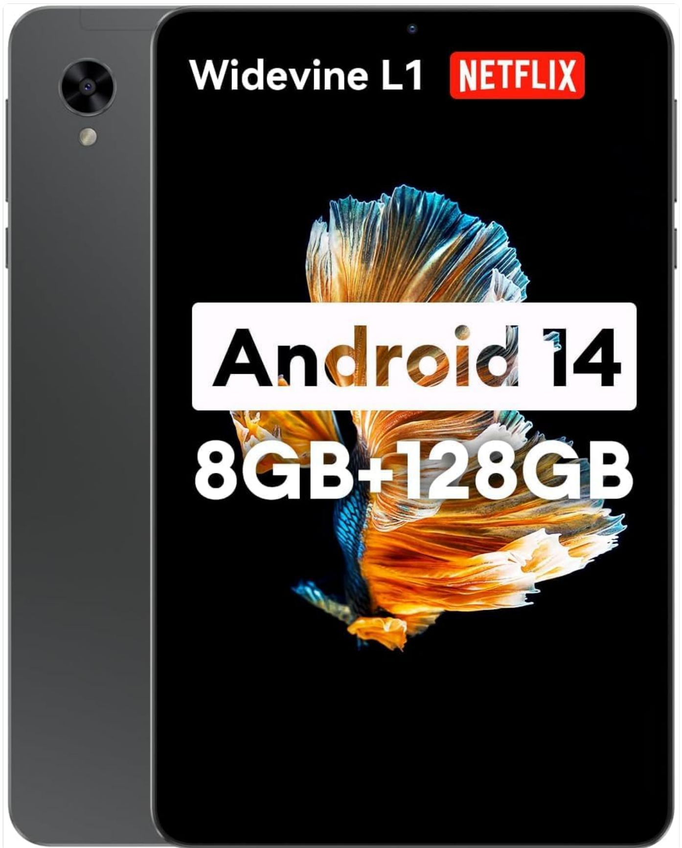
Image: Front view of the Headwolf Fpad3 Mini Tablet, showcasing its display.