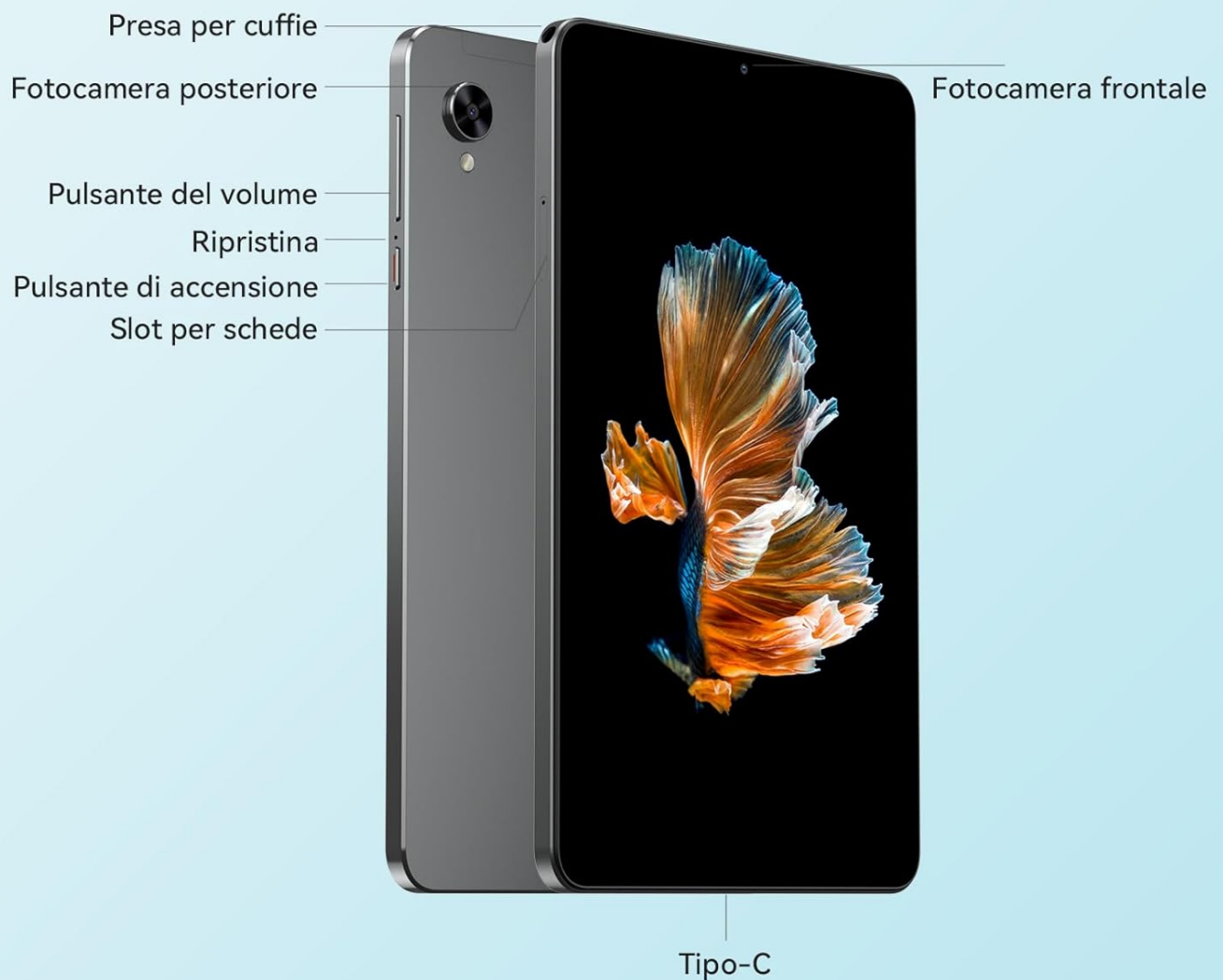
Image: Diagram illustrating the location of the headphone jack, rear camera, volume button, reset button, power button, SIM/SD card slot, and Type-C port on the Headwolf Fpad3 Mini Tablet.

Familiarize yourself with the tablet's physical components: