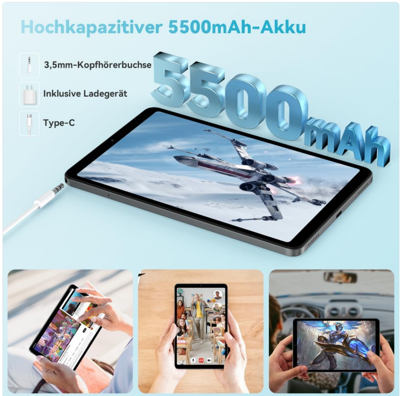
Image: The Headwolf Fpad3 Mini Tablet connected to a charger, highlighting its 5500mAh battery capacity and Type-C charging port.

Before first use, fully charge the tablet. Connect the provided USB Type-C cable to the tablet's Type-C port and the other end to the PD10W charger. Plug the charger into a power outlet. The charging indicator will typically appear on the screen.