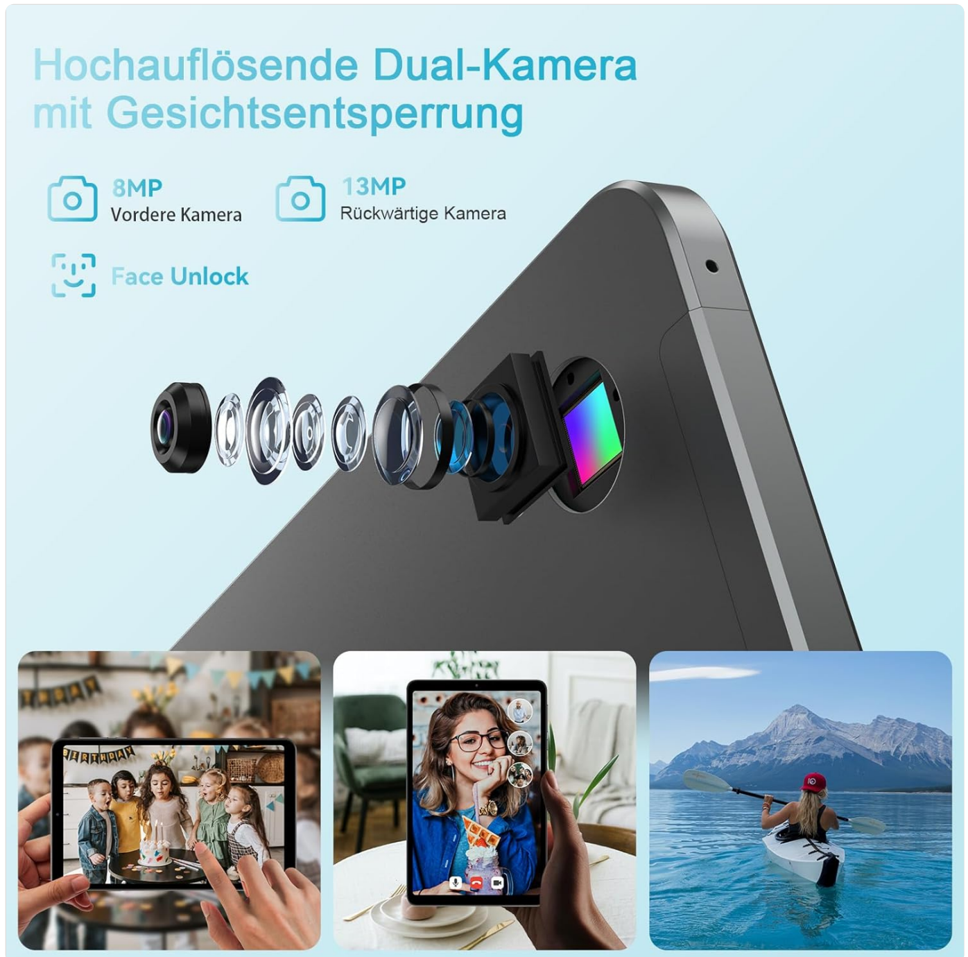
Image: An exploded view of the Headwolf Fpad3 Mini Tablet's dual cameras (8MP front, 13MP rear) and the Face Unlock feature, with examples of usage scenarios.

The tablet also supports Face Unlock for convenient and secure access.