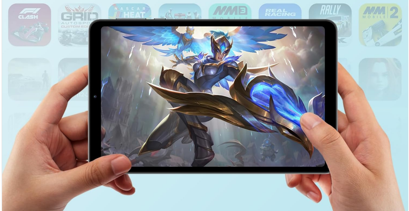
Image: An illustration detailing the Headwolf Fpad3 Mini Tablet's powerful Octa-Core Unisoc T616 processor, Mali-G57 GPU, and Android 13 operating system, with a benchmark comparison.