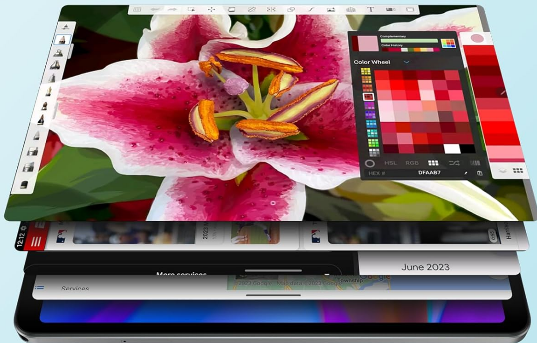
Image: A visual representation of the Headwolf Fpad3 Mini Tablet's 8GB RAM (with 4GB virtual expansion) and 128GB ROM, highlighting its expandability up to 2TB via an SD card.