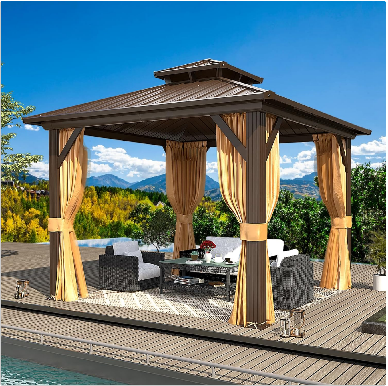
Figure 2: The MELLCOM 10'x10' Hardtop Gazebo in an outdoor setting.