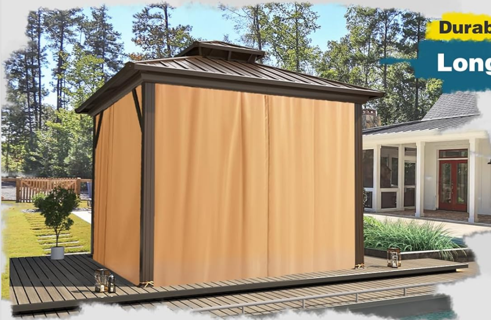
Figure 3: Detail of the double-layer design, offering versatility for ventilation, insect protection, and privacy.