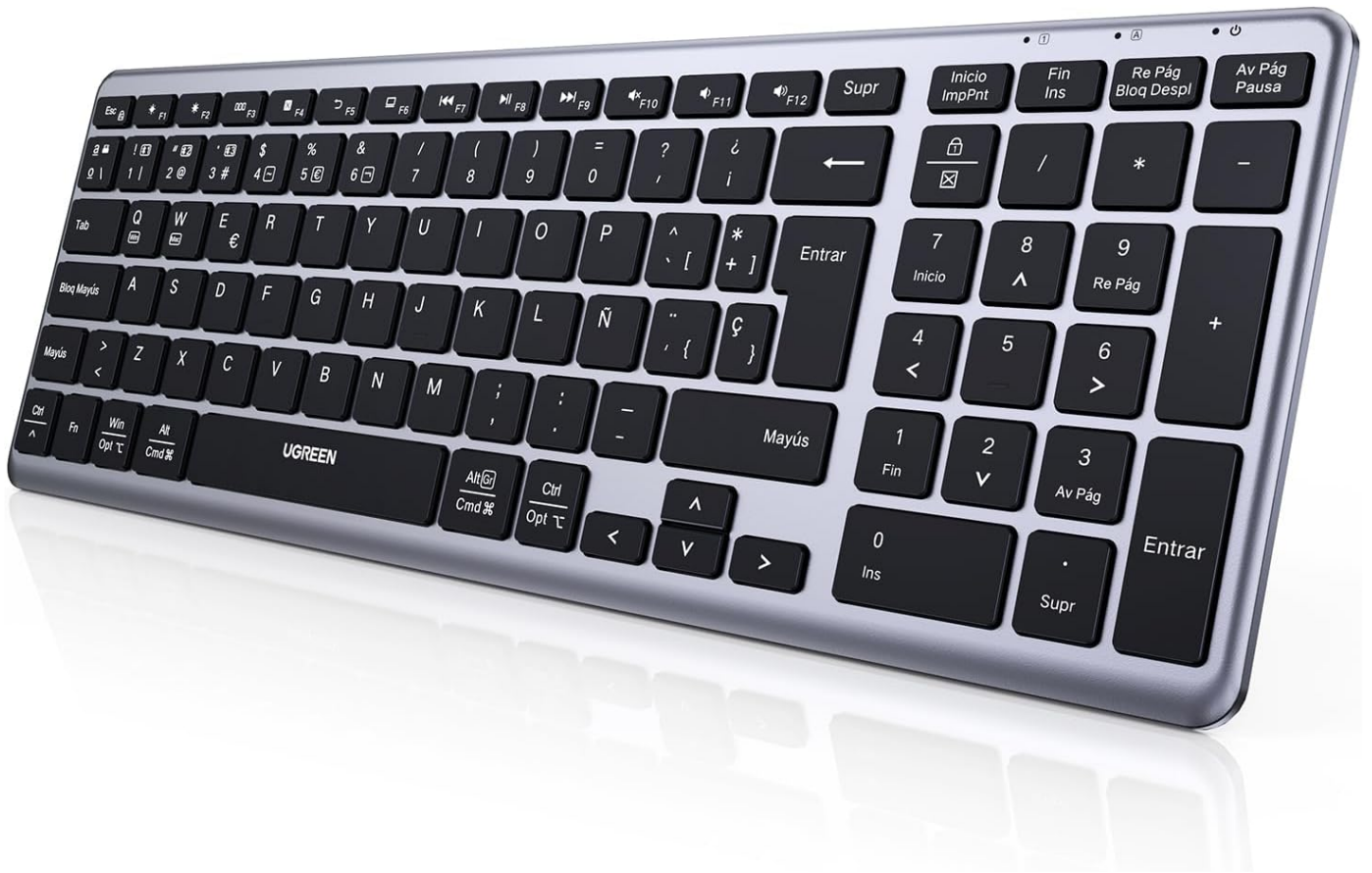
Figure 1: UGREEN Rechargeable Wireless Keyboard, showcasing its full layout with Spanish characters.

The UGREEN Wireless Keyboard is designed for multi-device compatibility and ease of use. It features a slim, compact design with a full Spanish layout, including the 'Ñ' key. The keyboard supports both Bluetooth and 2.4G wireless connections, allowing seamless switching between up to four devices.