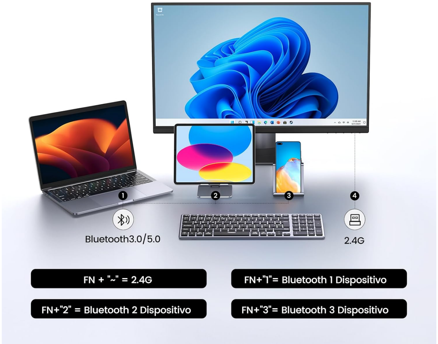
Figure 5: Illustration demonstrating how the keyboard connects to multiple devices (laptop, tablet, phone) via Bluetooth and 2.4G.