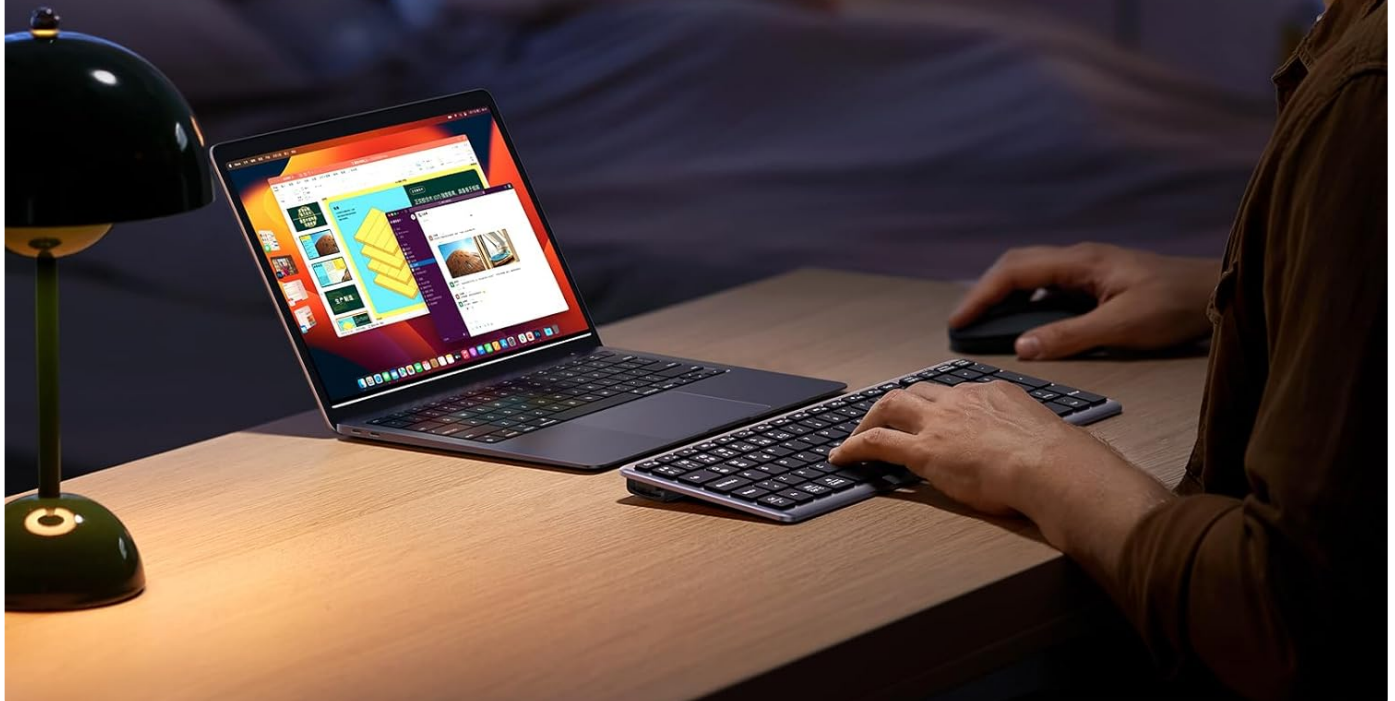
Figure 9: A user typing on the keyboard, emphasizing its silent click feature, suitable for quiet environments.