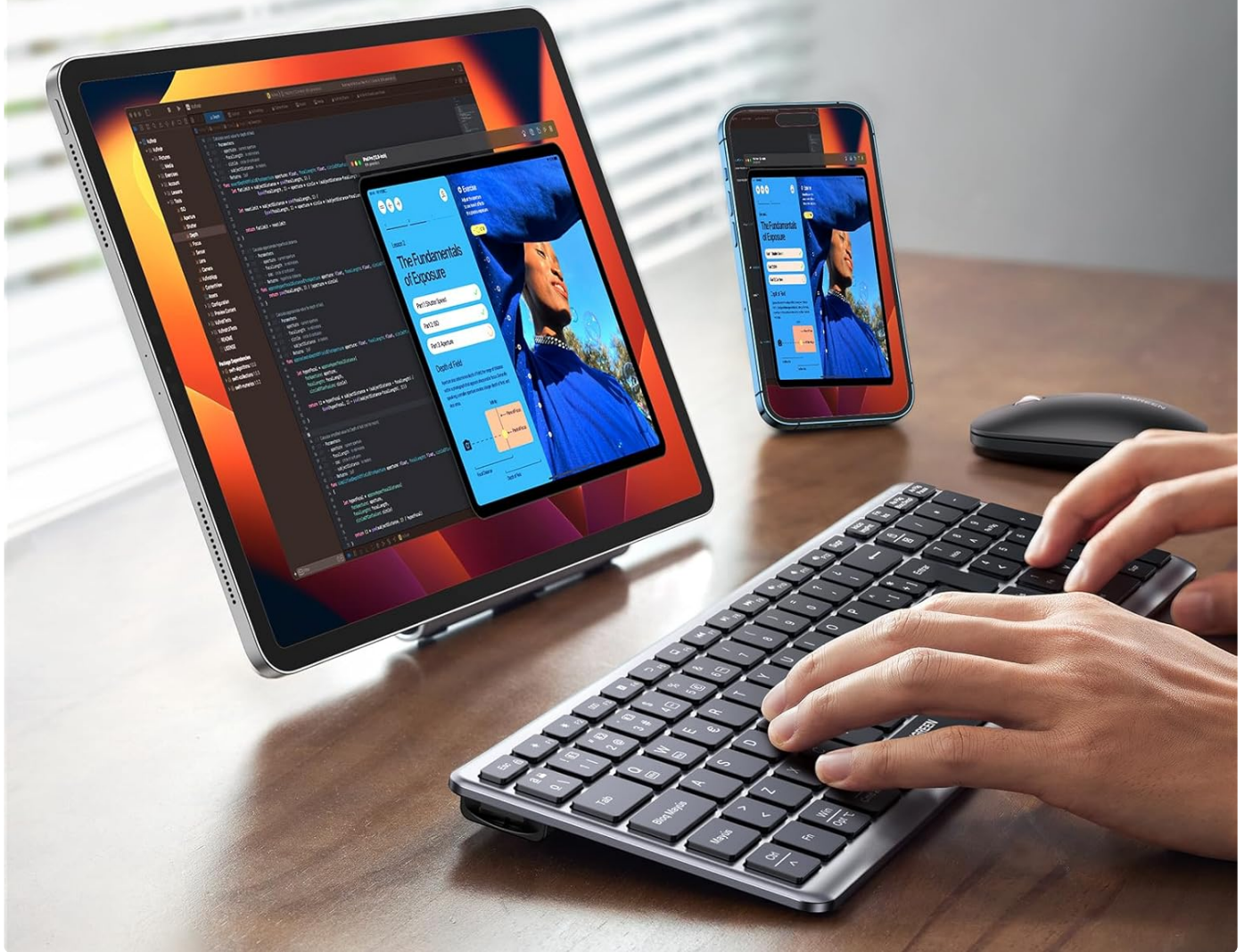
Figure 6: User demonstrating simultaneous typing on a tablet and mobile phone using the UGREEN keyboard via Bluetooth.

Convierte tu dispositivo en un ordenador en 1s