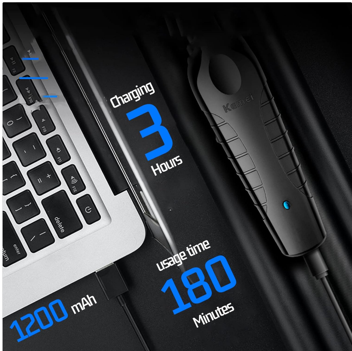
Image 3: The KEMEI Detail Trimmer (KM-2299) connected to a laptop via USB for charging. The image highlights a 3-hour charging time for 180 minutes of usage.