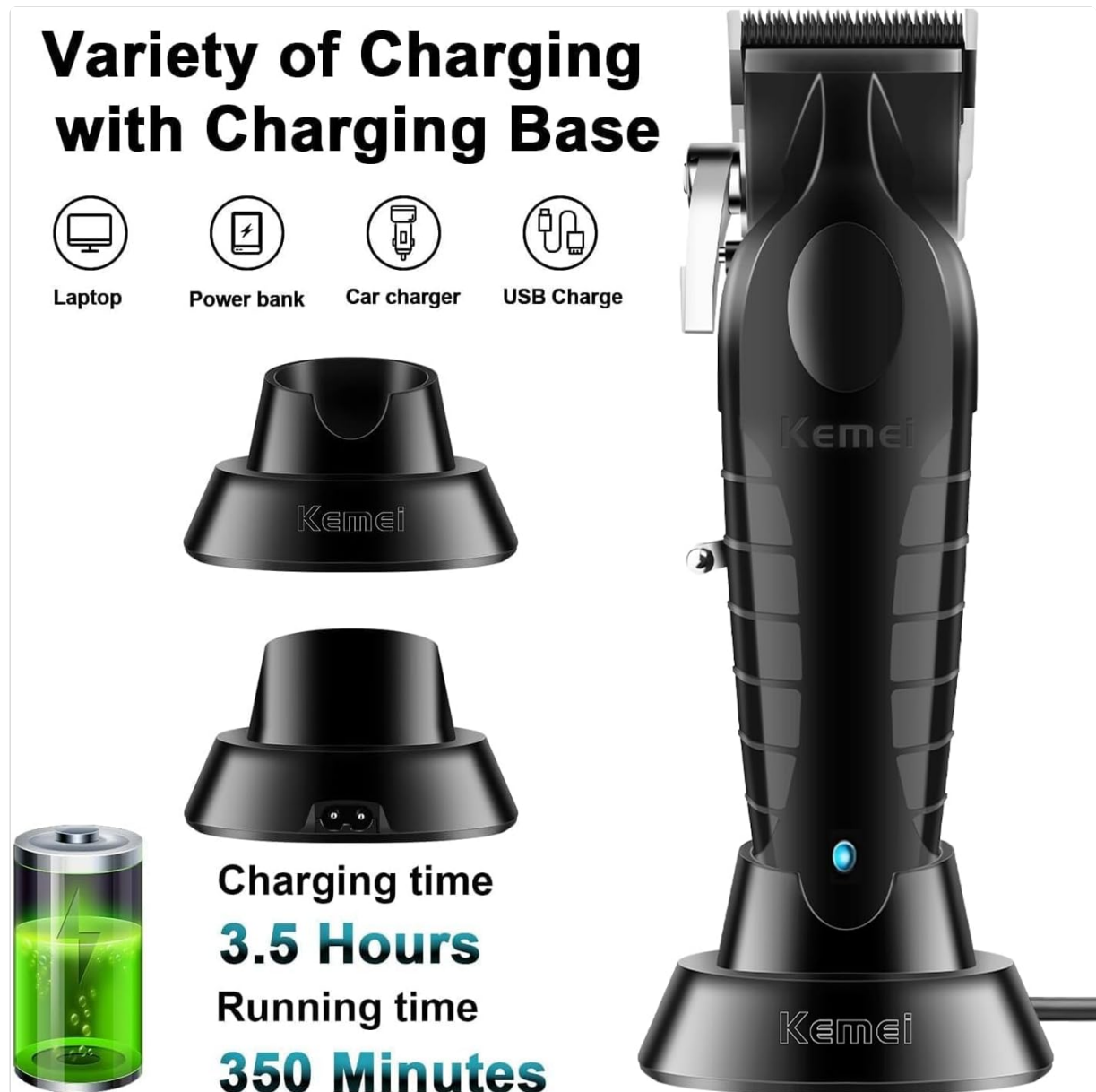
Image 2: The KEMEI Hair Clipper (KM-2296) placed on its charging base, illustrating various charging methods like laptop, power bank, car charger, and USB charge. The image highlights a 3.5-hour charging time for 350 minutes of running time.

Connect the charger to the device and a suitable USB power source (e.g., laptop, power bank, car charger, USB wall adapter). The indicator light will show charging status.