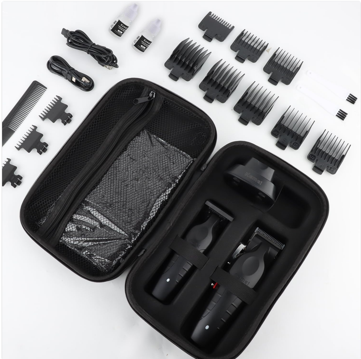
Image 1: Contents of the KEMEI Hair Clipper and Trimmer Set, including both devices, various guide combs, cleaning brush, and charging cables, neatly arranged in a carrying case.