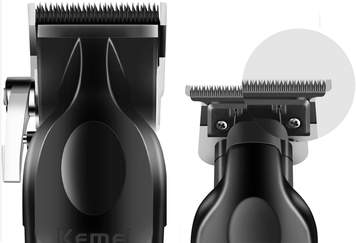
Image 5: A close-up view of the DLC Carbon Steel Blades on both the KEMEI Hair Clipper and Trimmer, emphasizing their precision and sharpness.