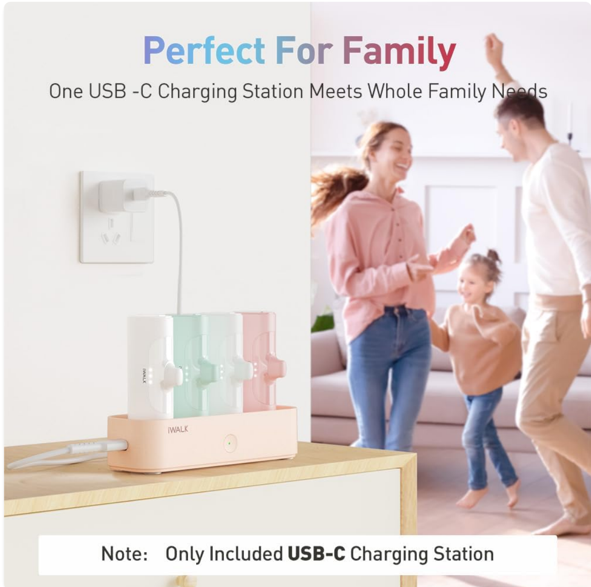
Figure 3.1: iWALK LinkPod Station connected to a wall charger.