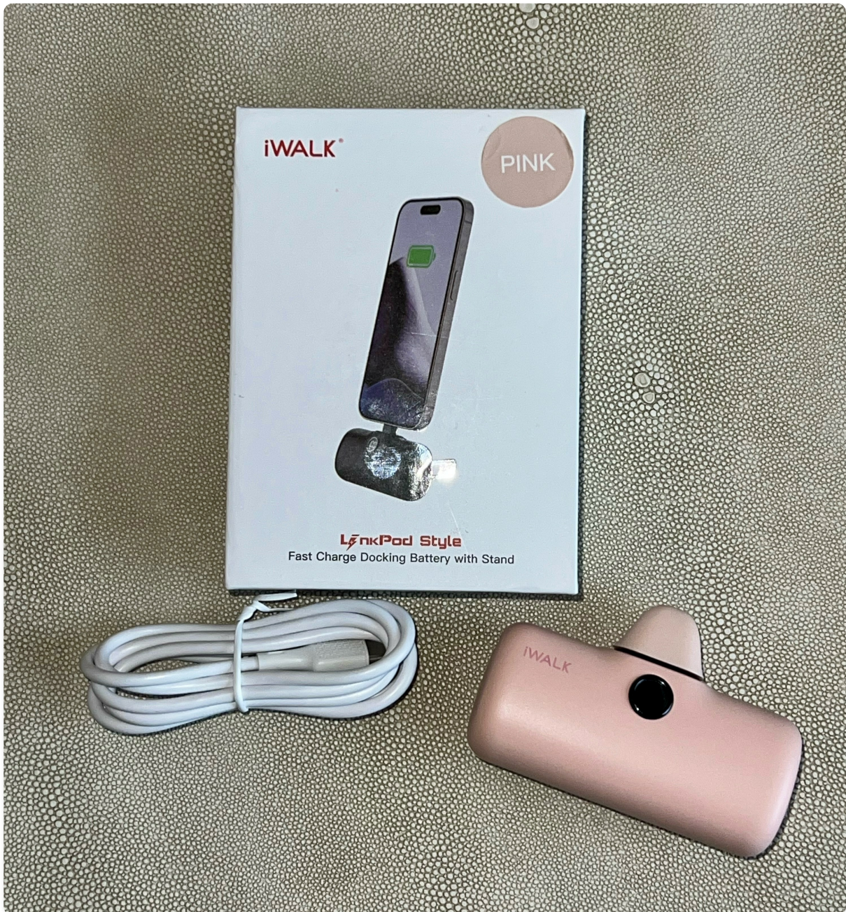
Figure 4.4: Power control button and indicator light.