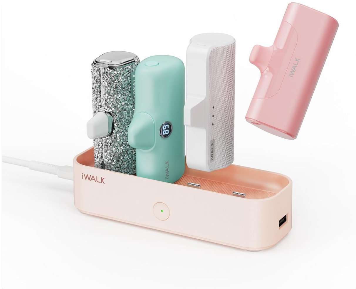
Figure 4.1: iWALK LinkPod Station with multiple portable chargers.