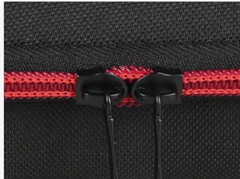
Image: Detailed view of the case's interior features, highlighting the thickened sponge for microphone protection, the mesh pocket for accessory storage, and the robust zipper mechanism.

Thickened zipper design, strong and durable