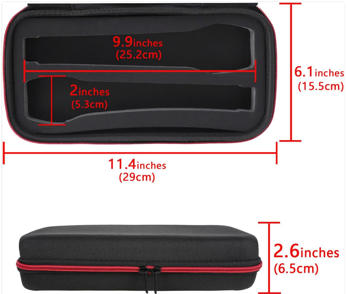
Image: Dimensional diagram of the case, indicating external measurements (11.4 x 6.1 x 2.6 inches) and internal microphone slot dimensions (9.9 x 2 inches).