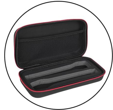
Image: Visual representation of several compatible microphone models, such as Bietrun SY-WXM-2, WXM02, WXM19, TW630, Shure BLX2, and PG58, demonstrating the case's broad compatibility.