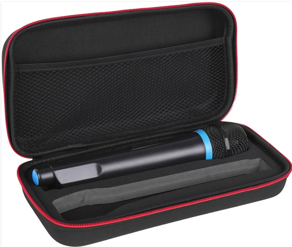
Image: An open Geekria microphone case with a microphone securely placed in its foam cutout, illustrating the interior layout and the mesh pocket for accessories.