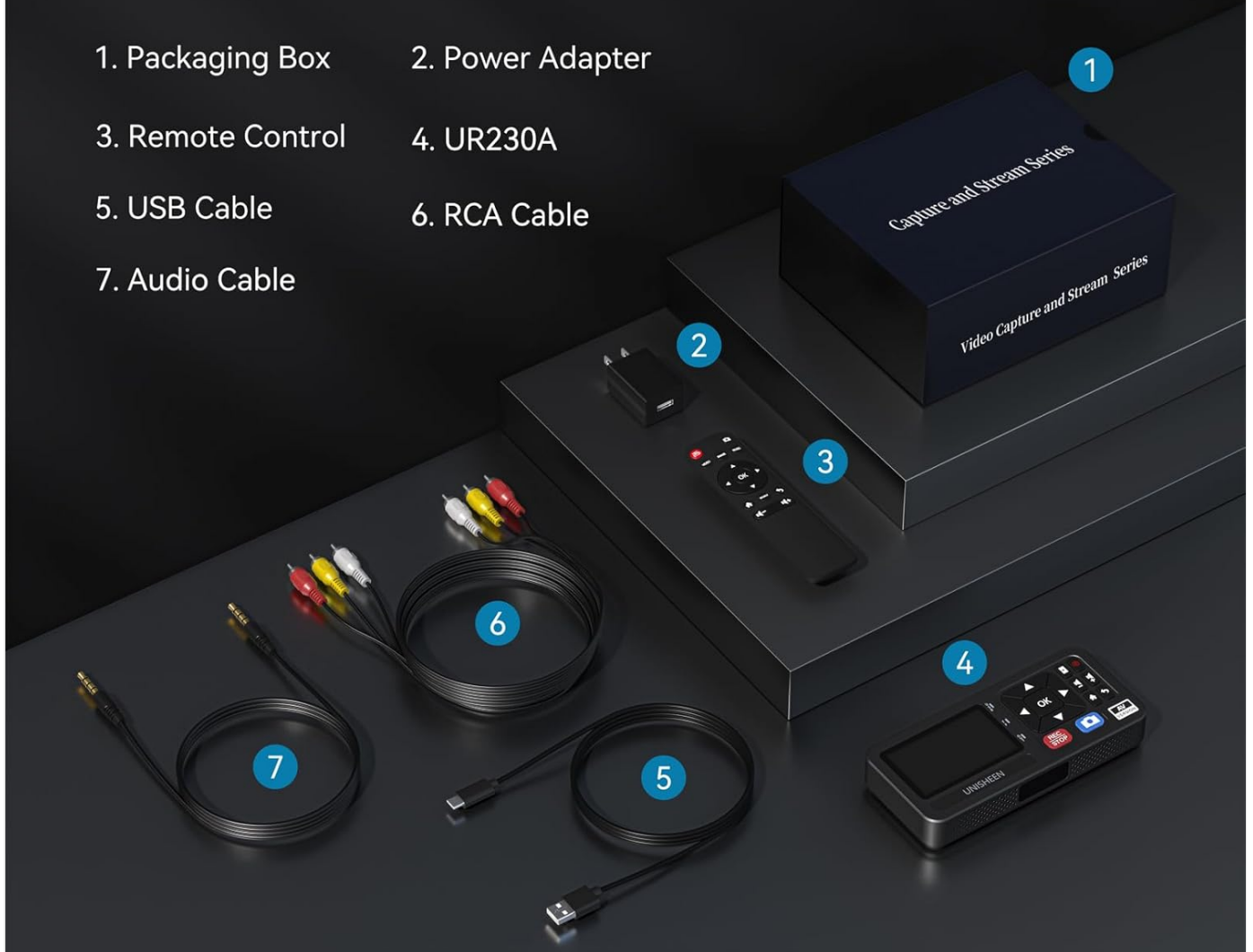
Image: All components included in the UNISHEEN UR230A package, including the converter unit, remote control, power adapter, USB cable, RCA cable, and audio cable.