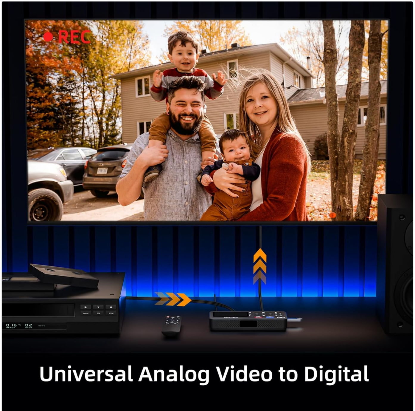
Image: The UNISHEEN UR230A connected to a television, displaying a family video being converted from an analog source. This illustrates the device's function in digitizing content for viewing on modern displays.

The included remote control provides convenient access to various functions, including snapshot, playback, and schedule recording (if supported by firmware). Refer to the on-screen menu for specific remote control functionalities.