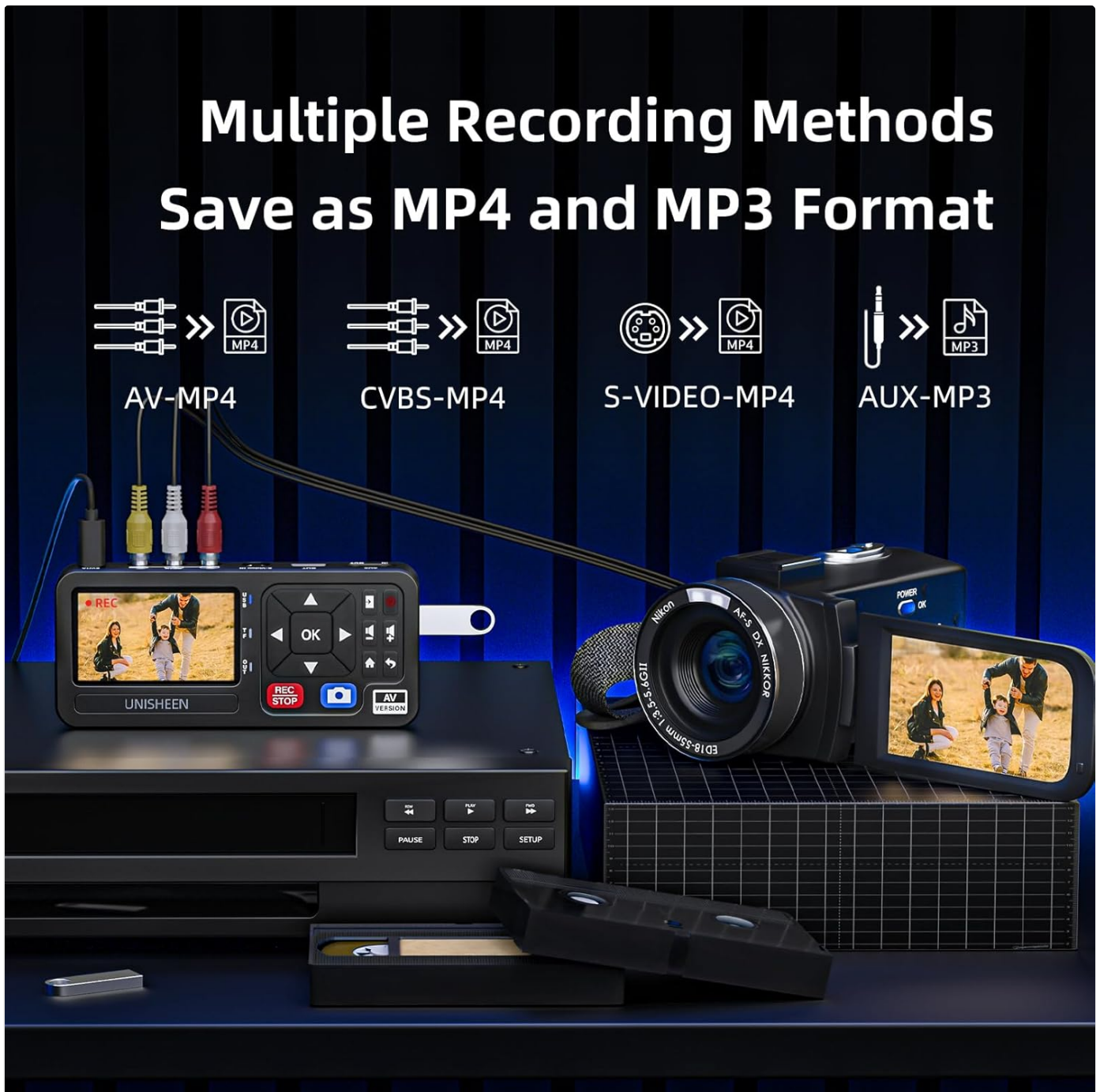
Image: A visual representation of the UNISHEEN UR230A connected to a camcorder and a VCR, illustrating multiple recording methods. It shows how AV, CVBS, and S-Video inputs can be saved as MP4 video files, and AUX input can be saved as MP3 audio files.