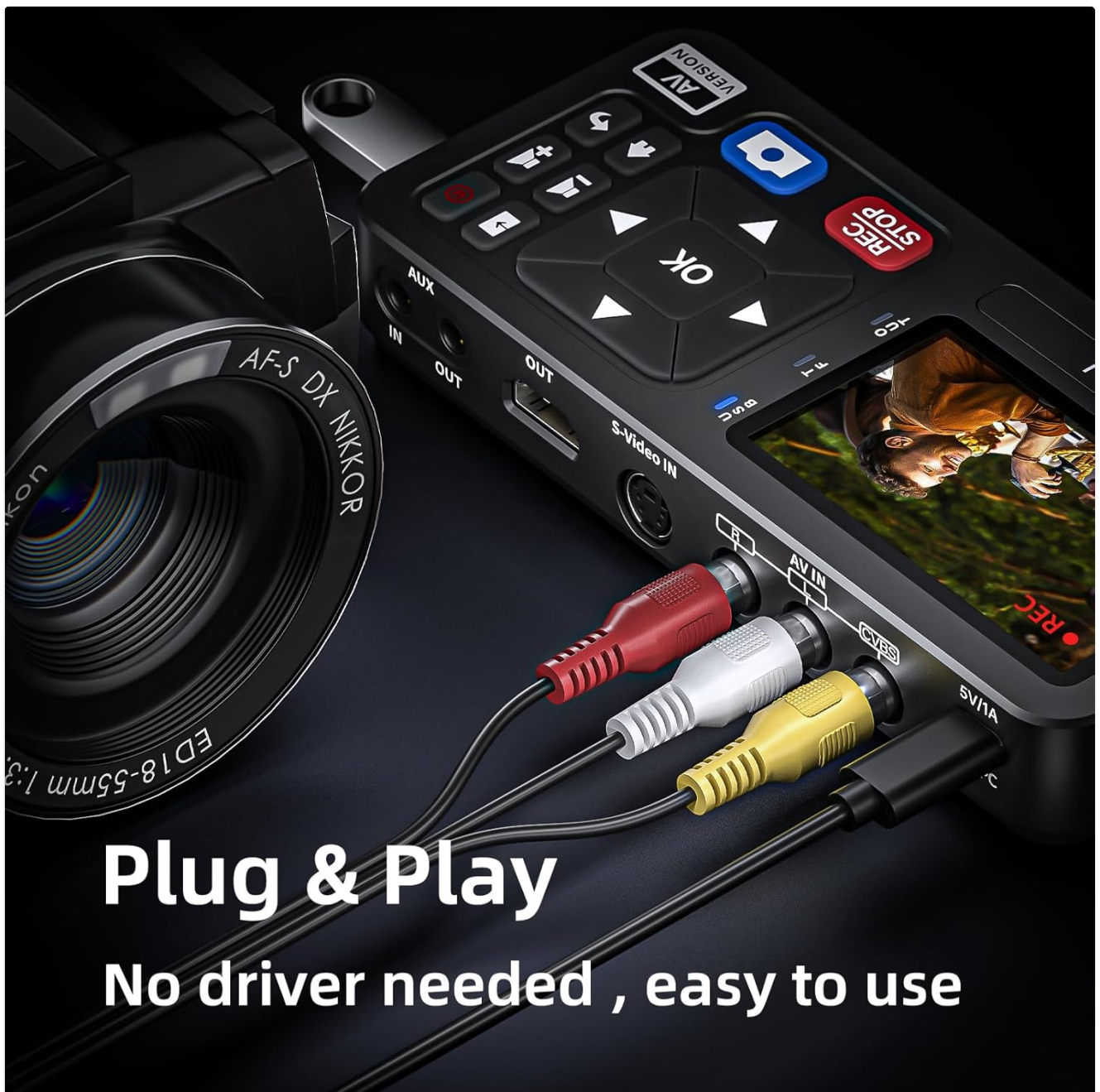
Image: A close-up view of the UNISHEEN UR230A showing the AV IN ports with red, white, and yellow RCA cables connected, emphasizing the plug-and-play nature of the device.