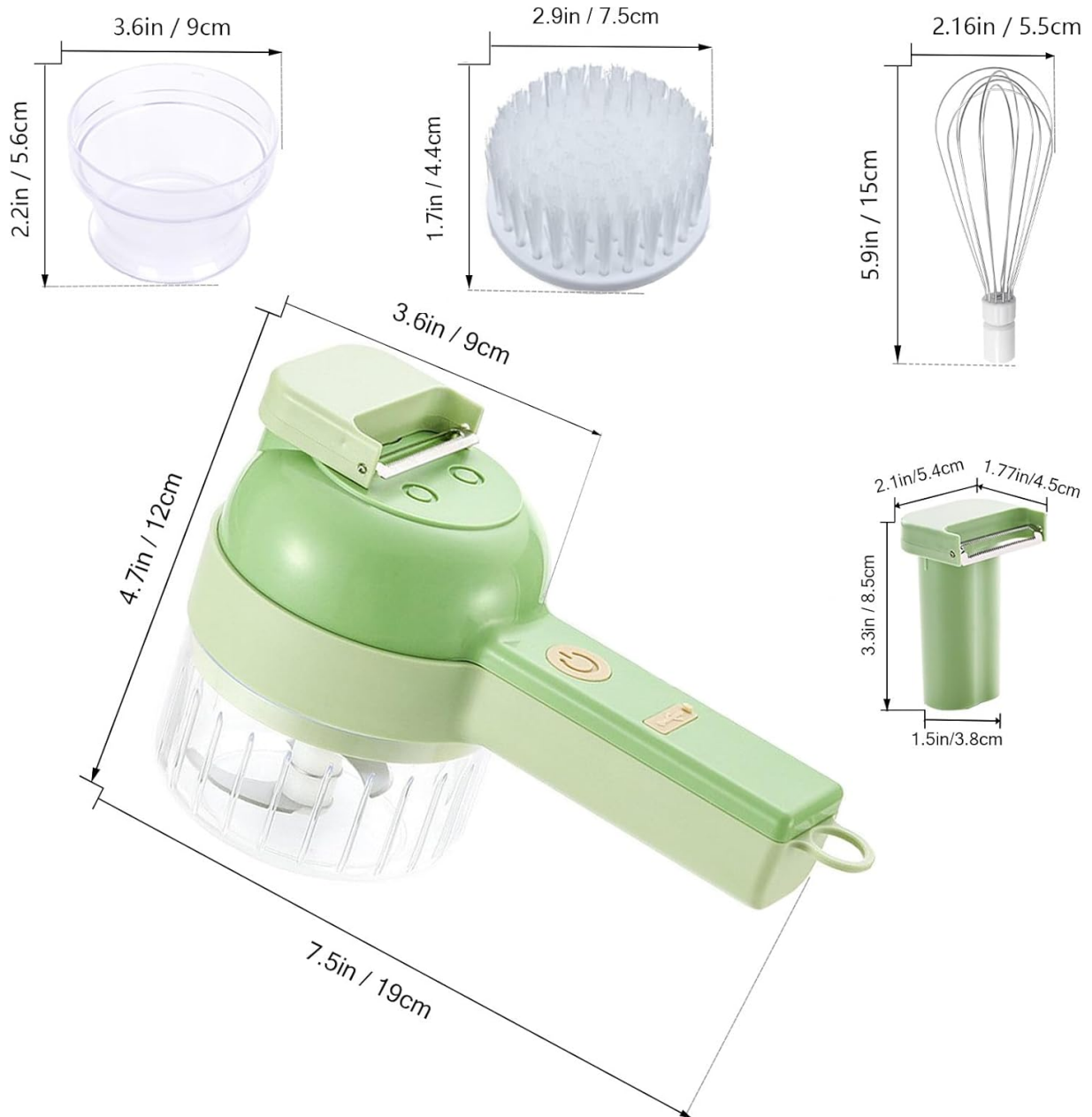
Image 9: Detailed dimensions of the main unit and various attachments.