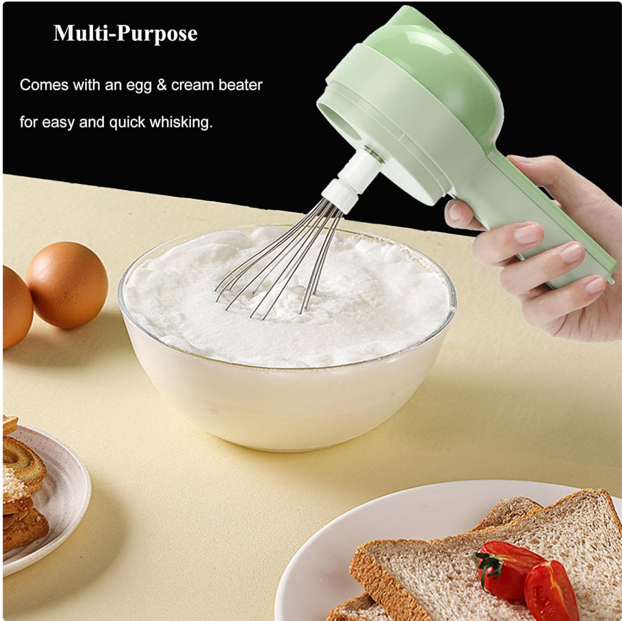
Image 6: The device used with the egg and cream beater attachment for quick whisking.

Comes with an egg & cream beater for easy and quick whisking.