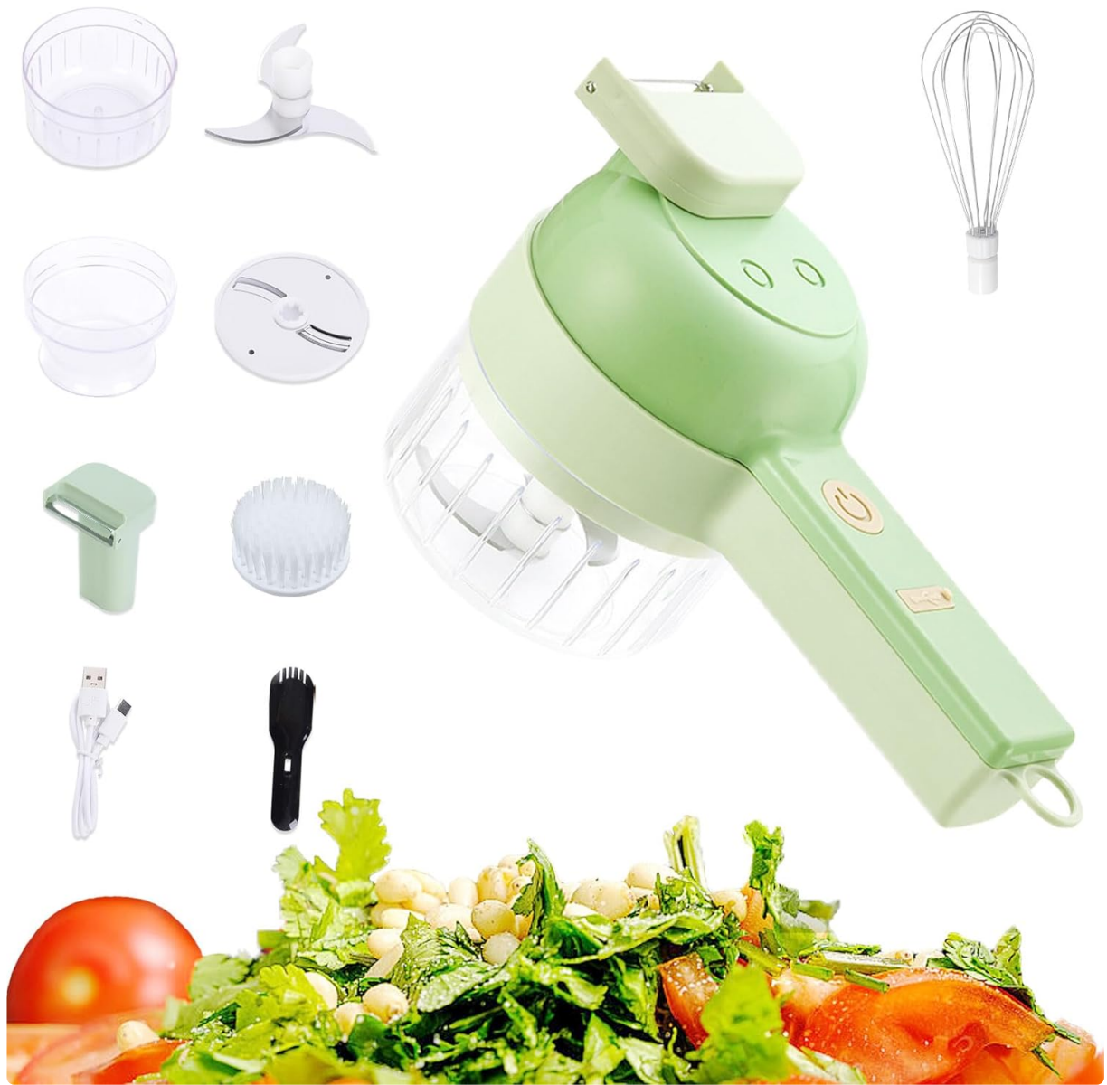
Image 2: An overview of all included components in the podoboq 5-in-1 Electric Vegetable Chopper Set.