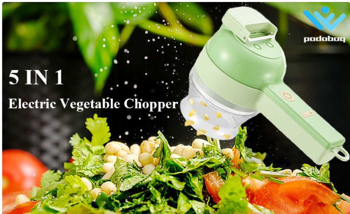
Image 1: The podoboq 5-in-1 Electric Vegetable Chopper Set, showcasing its multi-functional design and various applications in food preparation.

The podoboq 5-in-1 Electric Vegetable Chopper Set is a versatile kitchen tool designed to simplify food preparation. This handheld device combines five functions: slicing, chopping, peeling, washing, and stirring, making it suitable for various culinary tasks. It features a rechargeable design for cordless convenience and includes multiple attachments for different uses.