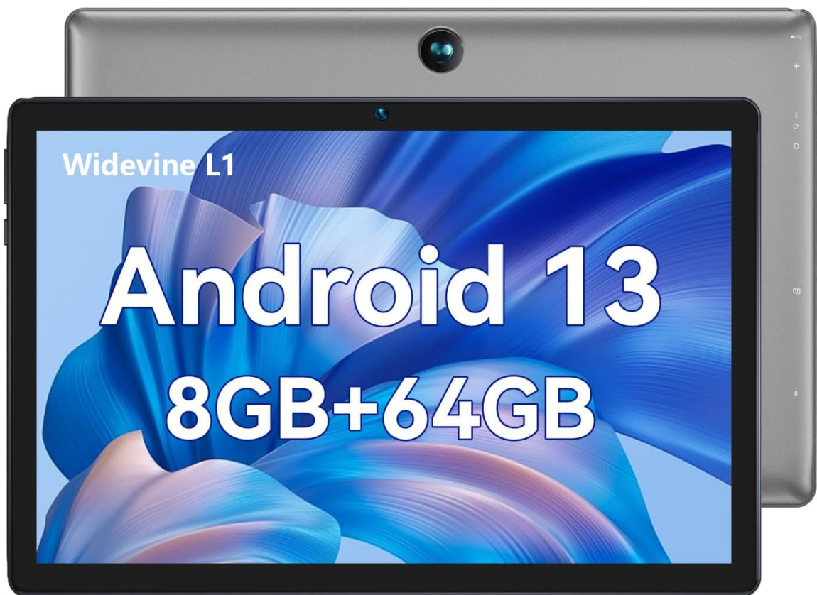
Image: The BMAX I9 Plus tablet features a 10-inch display and runs on Android 13, offering 8GB RAM and 64GB internal storage.