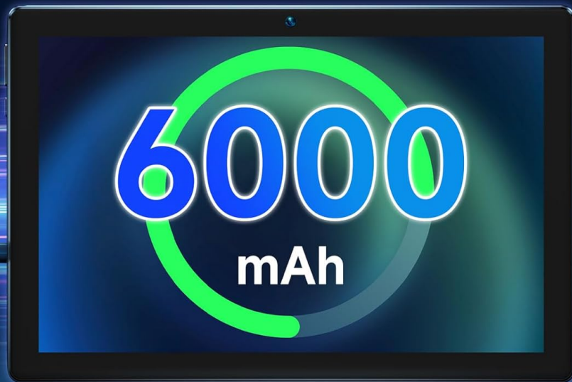
Image: The tablet is equipped with a large 6000mAh battery, providing extended usage time for videos, music, and games.