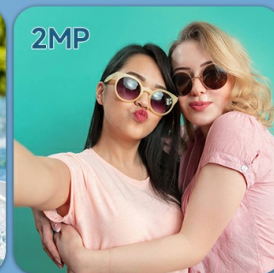
Image: The I9 Plus tablet features a 5MP rear camera and a 2MP front camera, suitable for various photography and video conferencing needs.