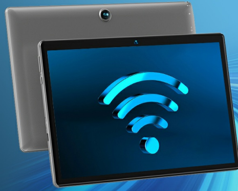
Image: Enjoy ultra-fast Wi-Fi 6 and stable Bluetooth 5.0 connectivity for seamless internet browsing and peripheral device pairing.