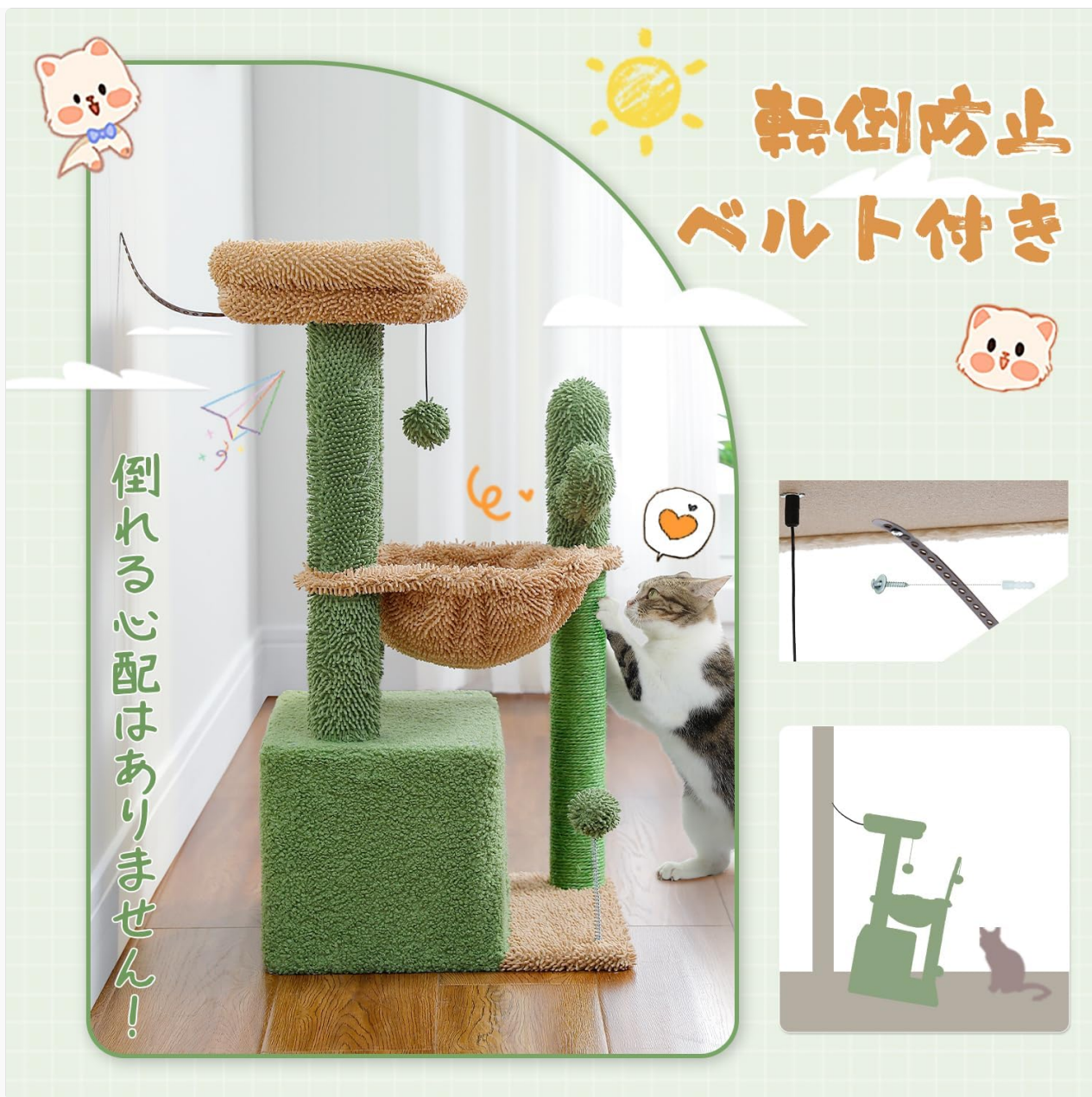
Image: A diagram showing how to install the anti-tip belt, securing the cat tower to a wall for added stability and safety.