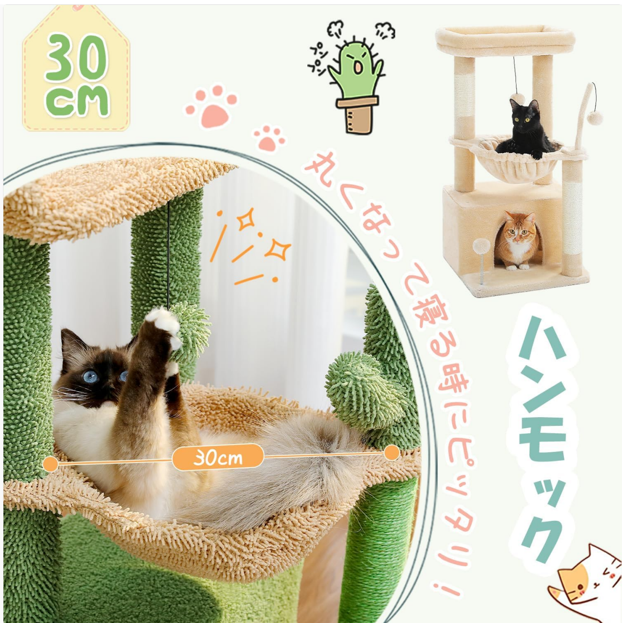
Image: A Ragdoll cat playfully reaching out from the soft, brown hammock of the cat tower, which has a diameter of 30cm.