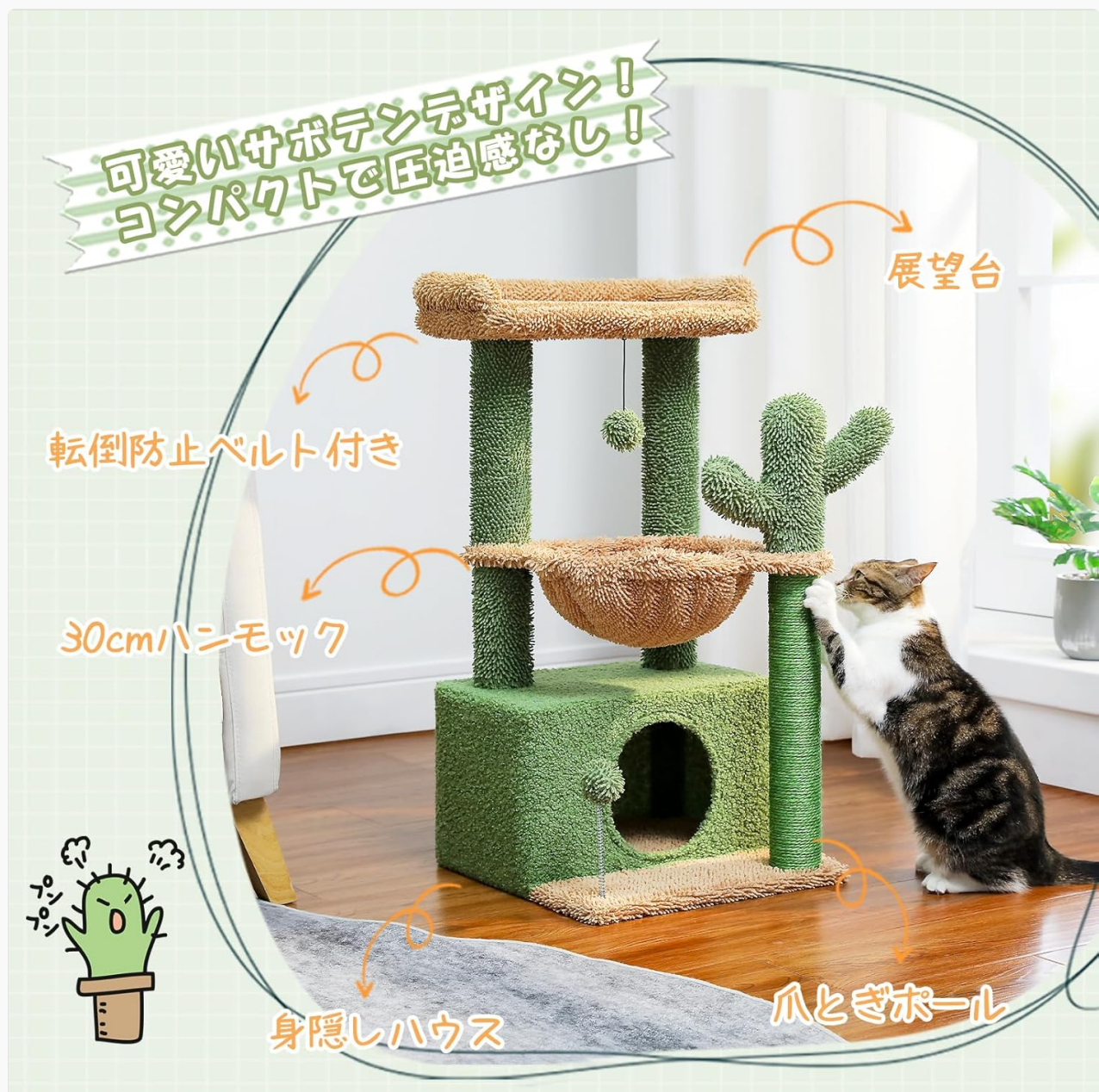
Image: An illustrative diagram highlighting key features of the cat tower, including the observation deck, anti-tip belt, 30cm