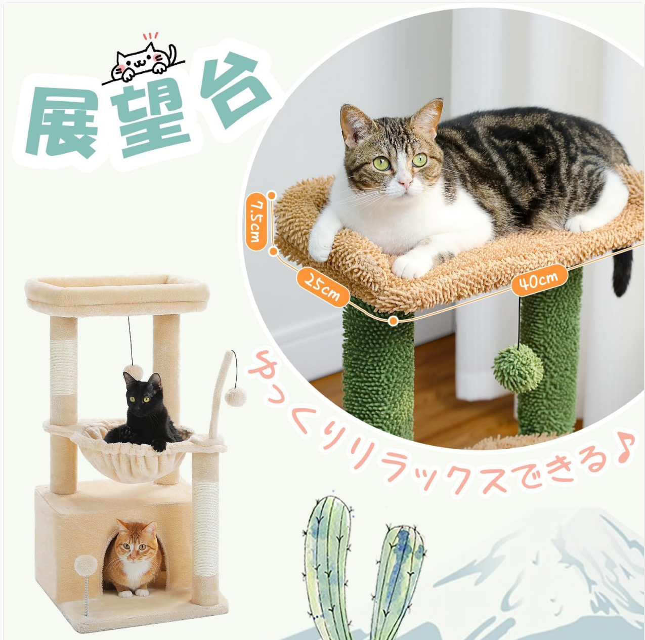
Image: A tabby cat comfortably lying on the plush, beige top platform of the cat tower, which measures 40cm by 25cm.

The elevated top platform provides a comfortable spot for your cat to rest, observe its surroundings, or simply relax. Its plush surface ensures maximum comfort.