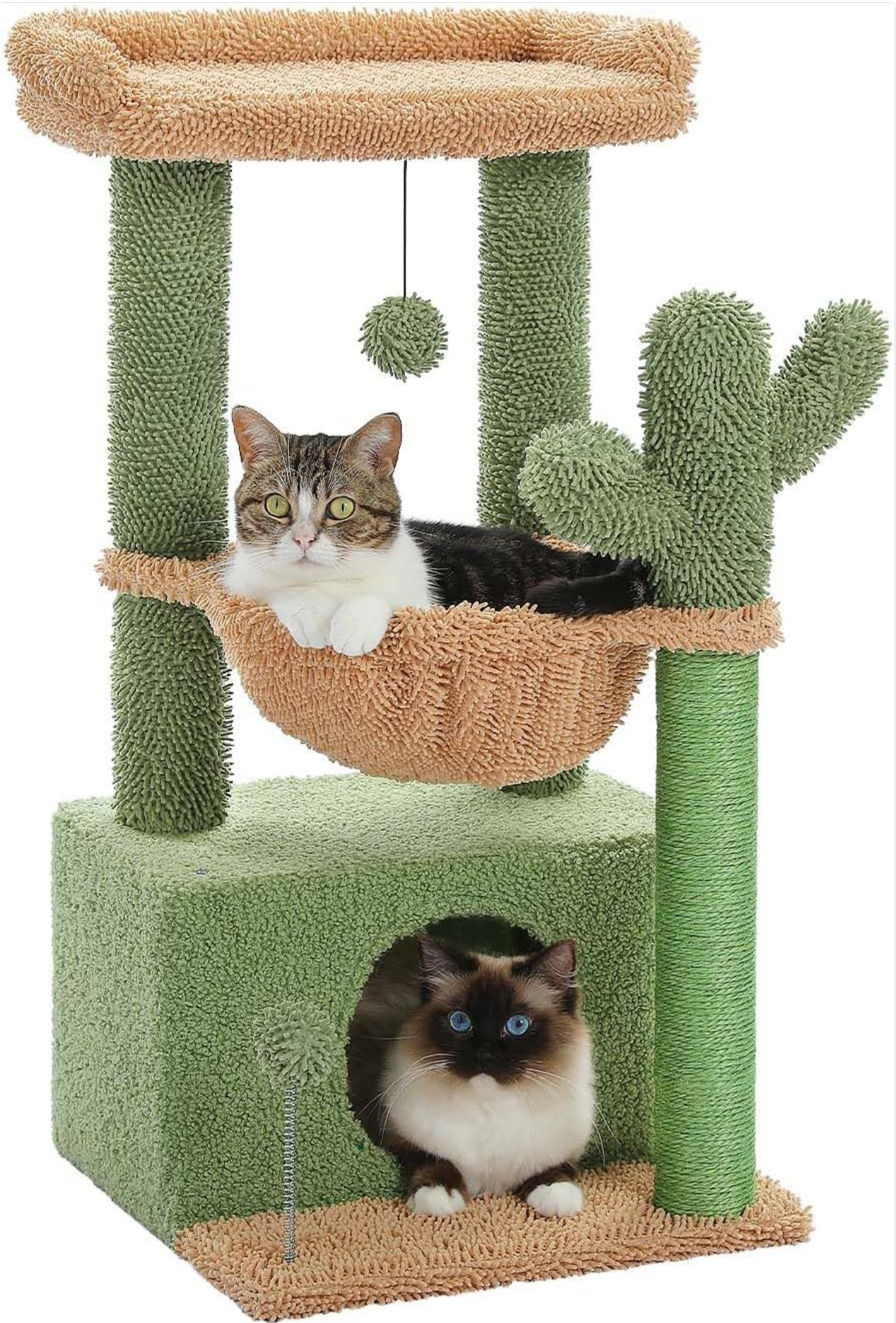
Image: The PAWZ Road Mini Cat Tower in green, featuring a top platform, hammock, cat house, and scratching posts, with two cats enjoying it.