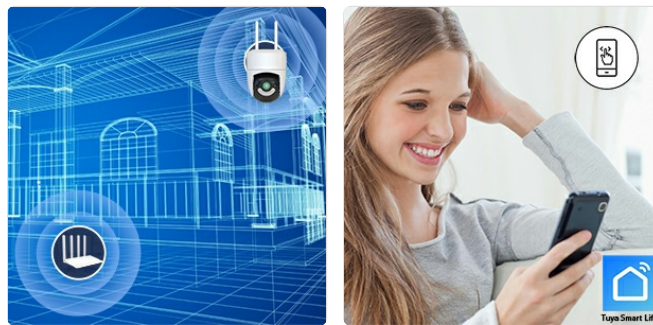
Figure 3.1: Icons illustrating WiFi connectivity and smartphone app control for the camera.