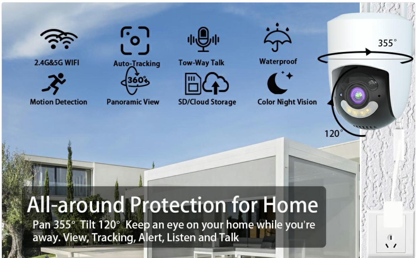
Figure 5.1: Dual-band 2.4GHz/5GHz WiFi connectivity for enhanced network performance.