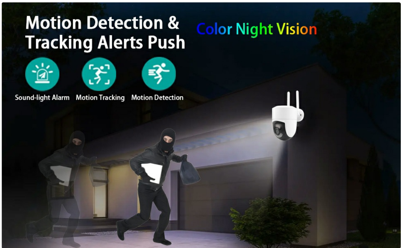
Figure 4.1: Illustration of the camera's motion detection and tracking feature.