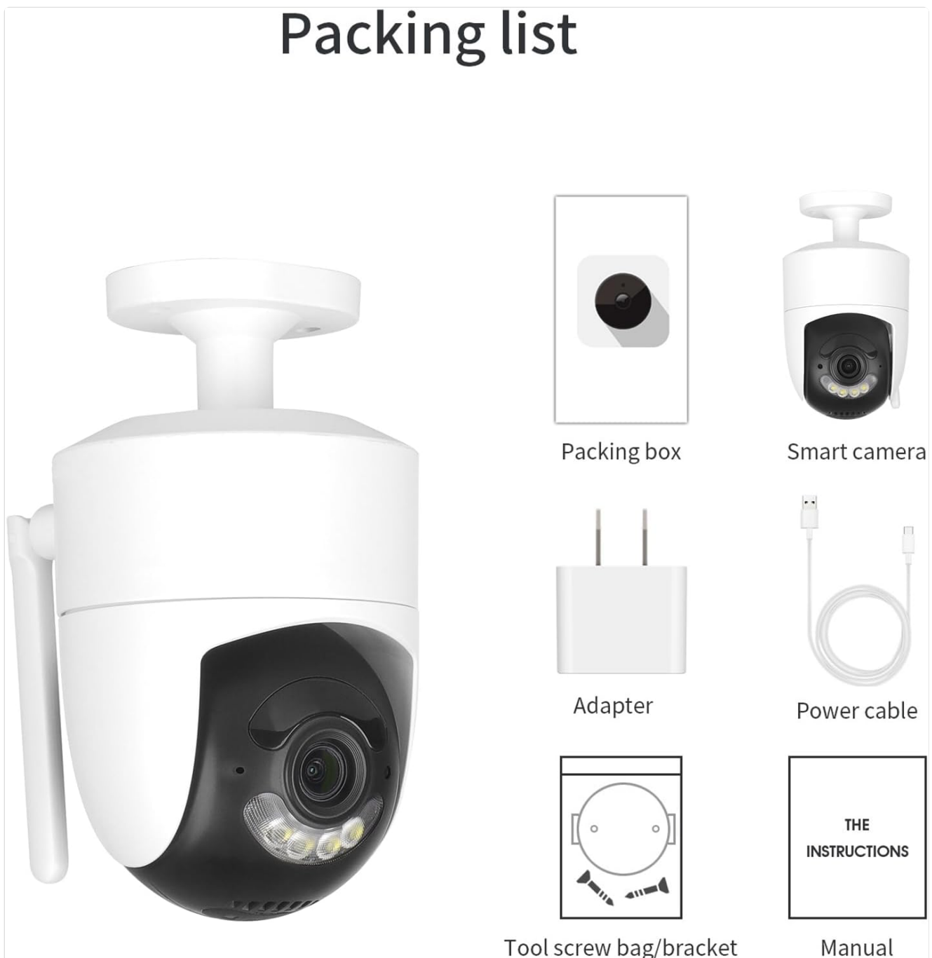
Figure 2.1: Package contents of the Dosilkc DS-TY02 2K+ Security Camera.