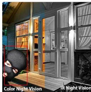
Figure 4.2: Icon indicating the color night vision capability.

The camera provides color night vision, allowing for clear, full-color images even in low-light conditions. This feature enhances visibility and detail compared to traditional black-and-white infrared night vision.