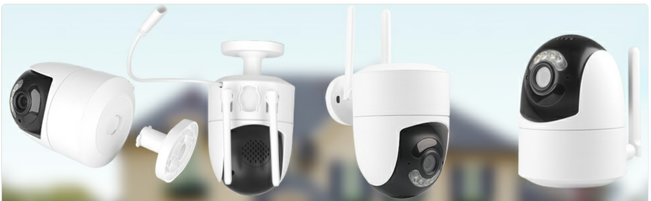
Figure 6.1: Various mounting options for the camera.

The camera comes with a mounting bracket and screws for installation. It can be mounted on a wall or ceiling. Ensure the mounting location provides a clear view of the area you wish to monitor and is within range of your Wi-Fi network. For outdoor installation, position the camera under an overhang or protected area to minimize direct exposure to harsh weather conditions, despite its IP66 rating.