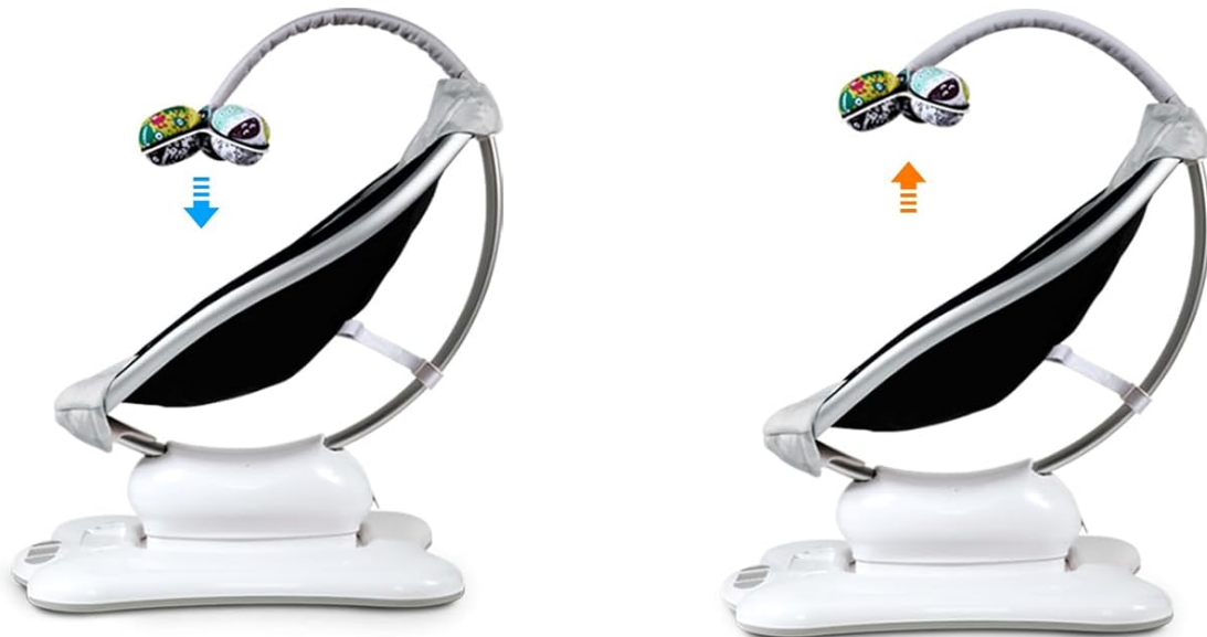
Image: A visual comparison demonstrating the effect of the replacement part, showing the toy bar lifted to its correct position after installation.

The disc lifts the removable Toy Bar so your Mamaroo is as good as new!