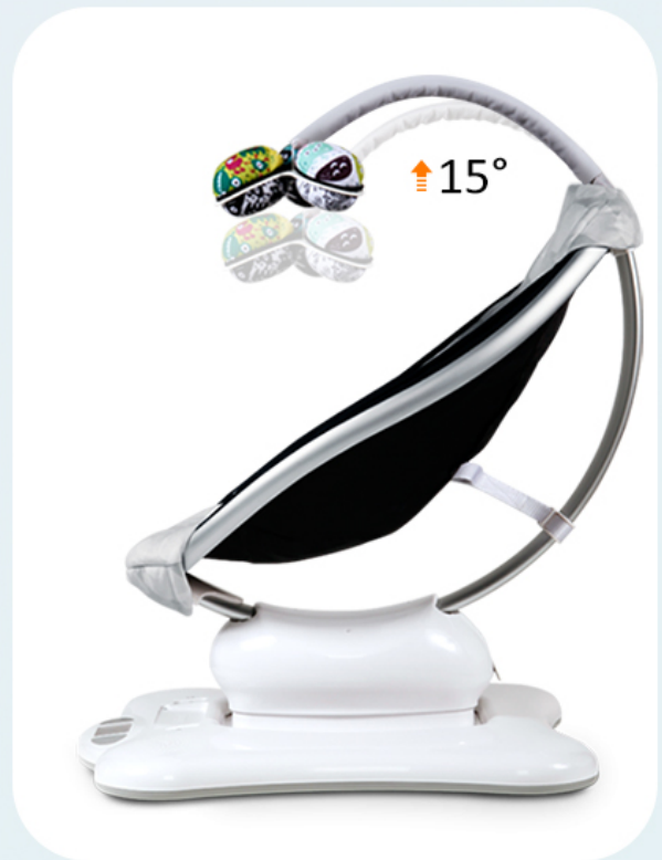
Image: A diagram illustrating the 15-degree upward angle achieved by the toy bar after the replacement part is installed, ensuring it is no longer in the child's face.