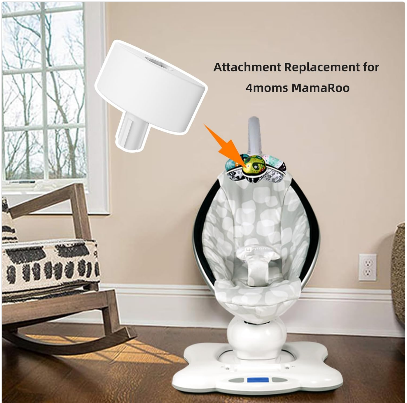
Image: The replacement part positioned next to the MamaRoo swing, indicating its intended attachment location at the base of the toy bar.