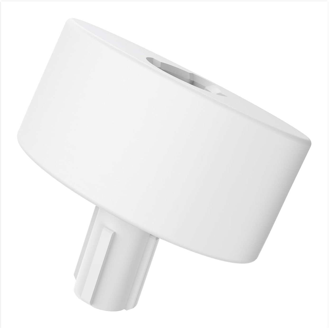
Image: The white plastic mobile connector replacement part, designed for durability and precise fit.