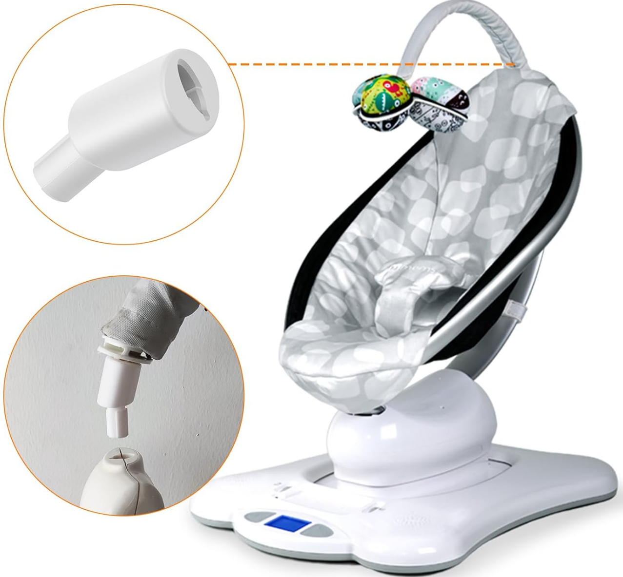
Image: A four-panel visual guide illustrating the step-by-step process of attaching the new mobile connector to the Mamaroo swing.