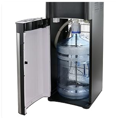
The open bottom compartment of the water dispenser, revealing the water bottle and the pump mechanism for easy loading.