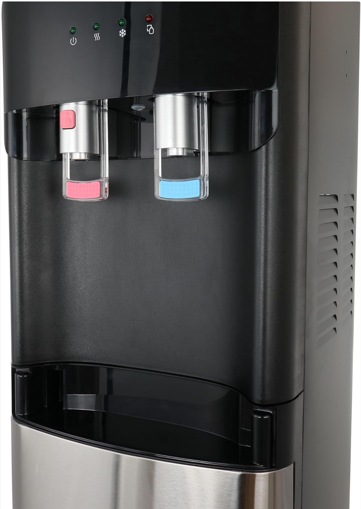
A close-up view of the hot (red) and cold (blue) water dispensing spouts on the MegaChef water dispenser.