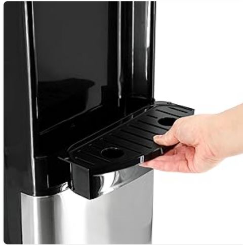
A hand demonstrating the removal of the BPA-free removable drip tray for convenient cleaning.