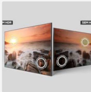
Figure 4.3: Visual representation of HDR (High Dynamic Range) enhancing picture quality compared to standard display.