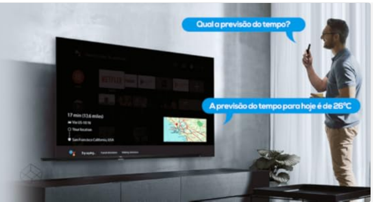
Figure 4.2: The voice remote control allows for convenient interaction with Google Assistant for various queries and controls.

Mais praticidade: obtenha sugestão de séries, filmes, informações de trânsito e tempo, além de controlar os equipamentos da casa conectada (IoT), utilizando o Google Assistente totalmente em português, através do controle remoto da sua TV.