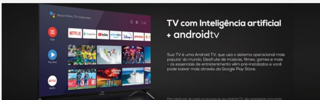
Figure 4.1: The Android TV interface, providing access to a variety of applications and services.