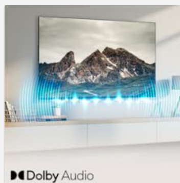
Figure 4.4: Dolby Audio technology provides immersive and high-quality sound for an enhanced viewing experience.