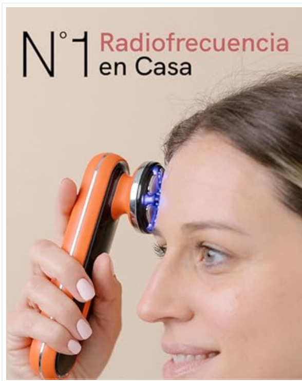
Image: A person demonstrating the use of the MASDERM device on their face, showing the orange and purple light mode in action.