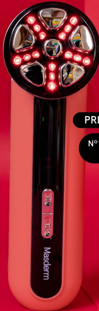
Image: A detailed view of the MASDERM device, highlighting the control buttons and the LED indicator panel for different modes and intensity levels.

The device features multiple modes, each indicated by a specific LED light color. Familiarize yourself with the buttons and indicators before use.