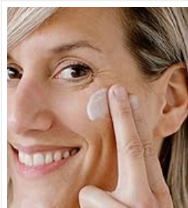
Image: A close-up of a person applying cream to their cheek, demonstrating the preparation step before using the device.