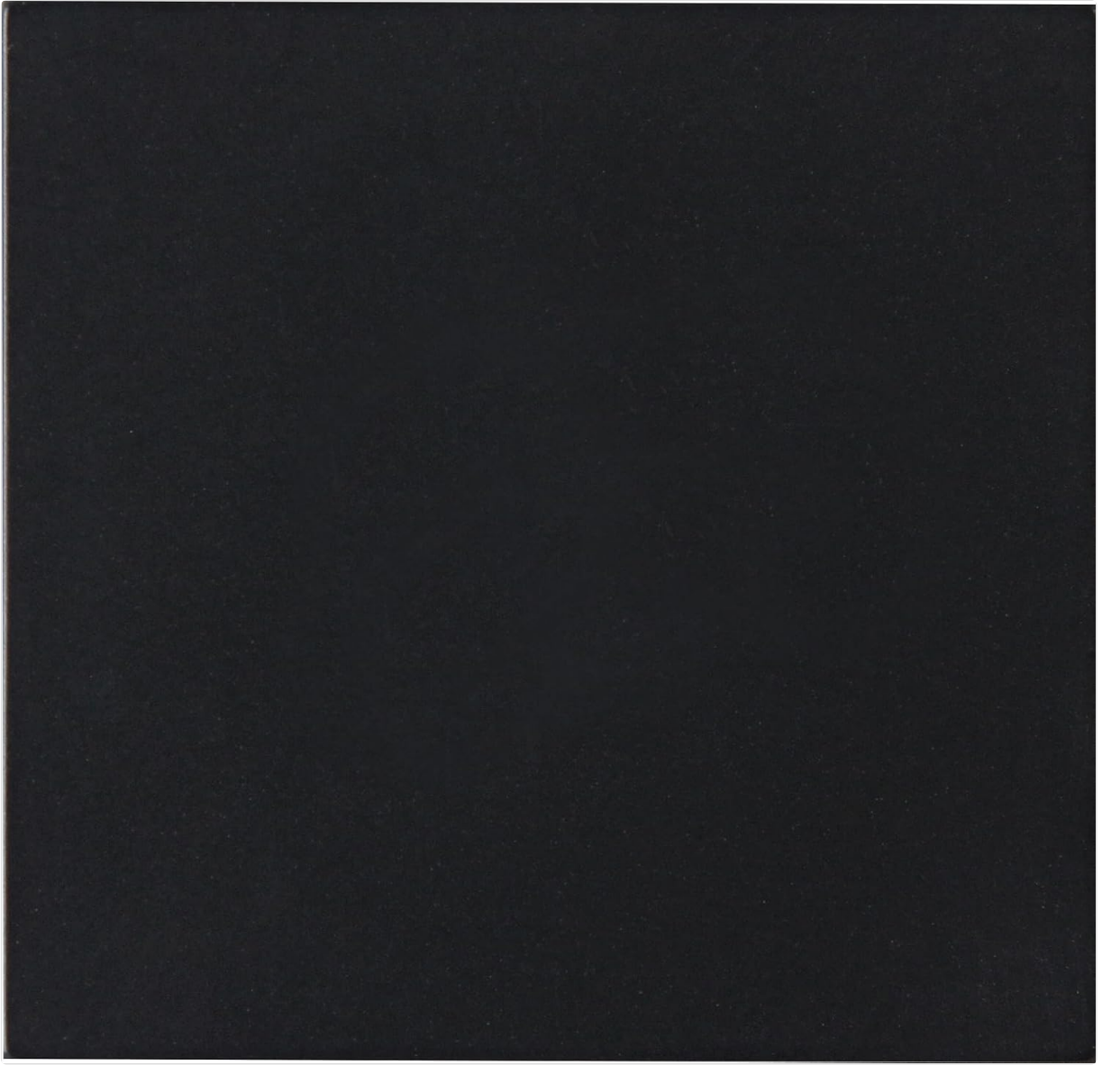
Figure 1: Front view of the Kopp HK07 Surface Rocker in Matte Black.