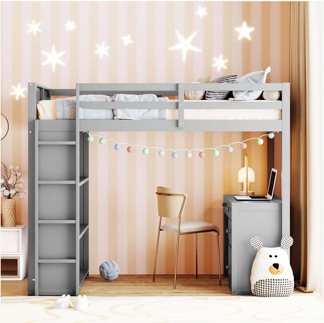
Figure 4: Loft Bed in Use (Lifestyle)

This image demonstrates the TRIPLE TREE loft bed set up in a bedroom, illustrating how the integrated desk and shelves can be utilized for study and organization, creating a functional and space-saving environment.