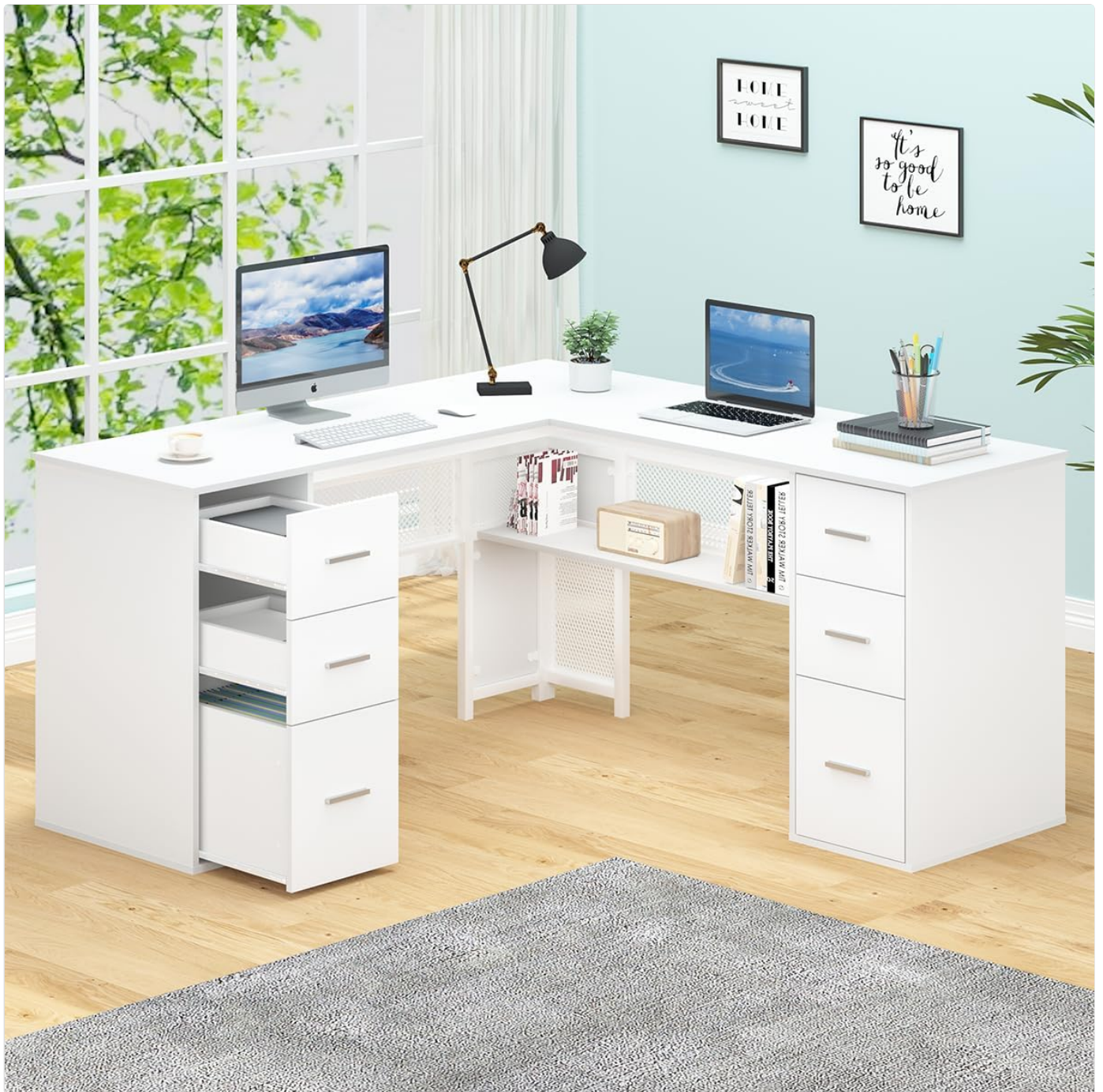
Image: A view of the desk with a computer and laptop, demonstrating its functionality for a multi-monitor setup.