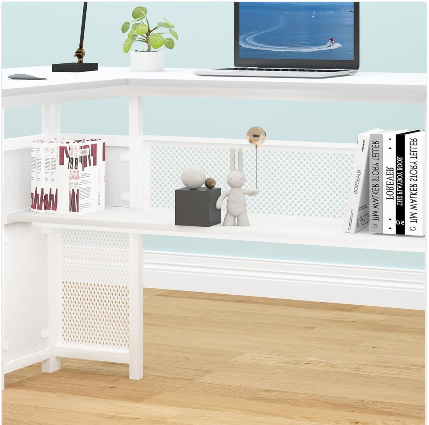
Image: Detail of the central open shelf, ideal for books or decorative items, connecting the two desk sections.