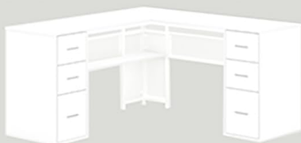
SHELF ON THE LEFT SIDE