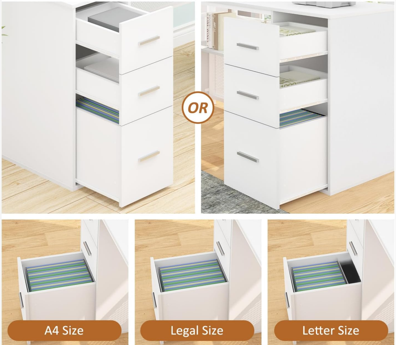
Image: A visual guide to the multifunctional drawers, demonstrating their capacity to store A4, Legal, and Letter size files.

Store it privately, Keep clutter out of sight