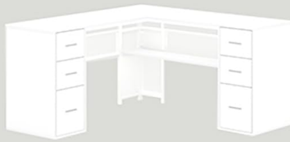
SHELF ON THE RIGHT SIDE

Image: A technical diagram illustrating the desk's dimensions and its reversible L-shaped configuration, showing options for shelf placement.