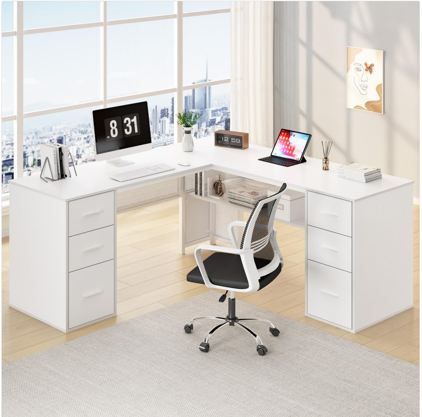
Image: The fully assembled HSH L-Shaped Corner Desk, showcasing its design and ample workspace.

Carefully unpack all components and lay them out on a clean, soft surface. Identify each part by referring to the included parts diagram (not provided in this text, but typically found in the physical manual).