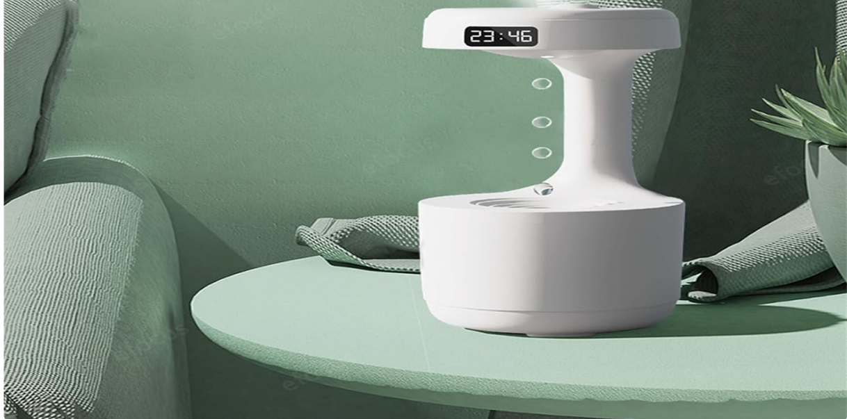
Figure 6.3: The humidifier operating quietly on a bedside table, suitable for use during sleep.

From morning till night Quiet, low noise and power