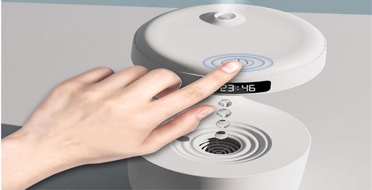
Figure 6.1: Illustration of the one-button switch design for controlling the humidifier.