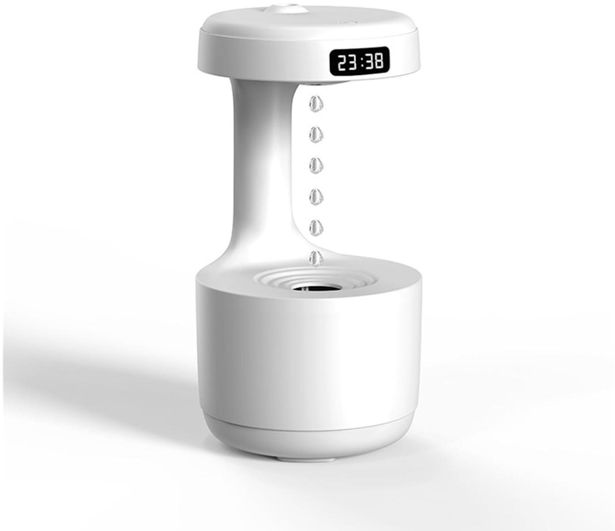
Figure 4.1: Front view of the WUYJTIF Anti-Gravity Humidifier, illustrating the upward-flowing water droplet effect and the digital display.

The WUYJTIF Anti-Gravity Humidifier features a unique design that creates the illusion of water droplets flowing upwards, combined with a cool mist output. It includes an LED smart display for real-time information.