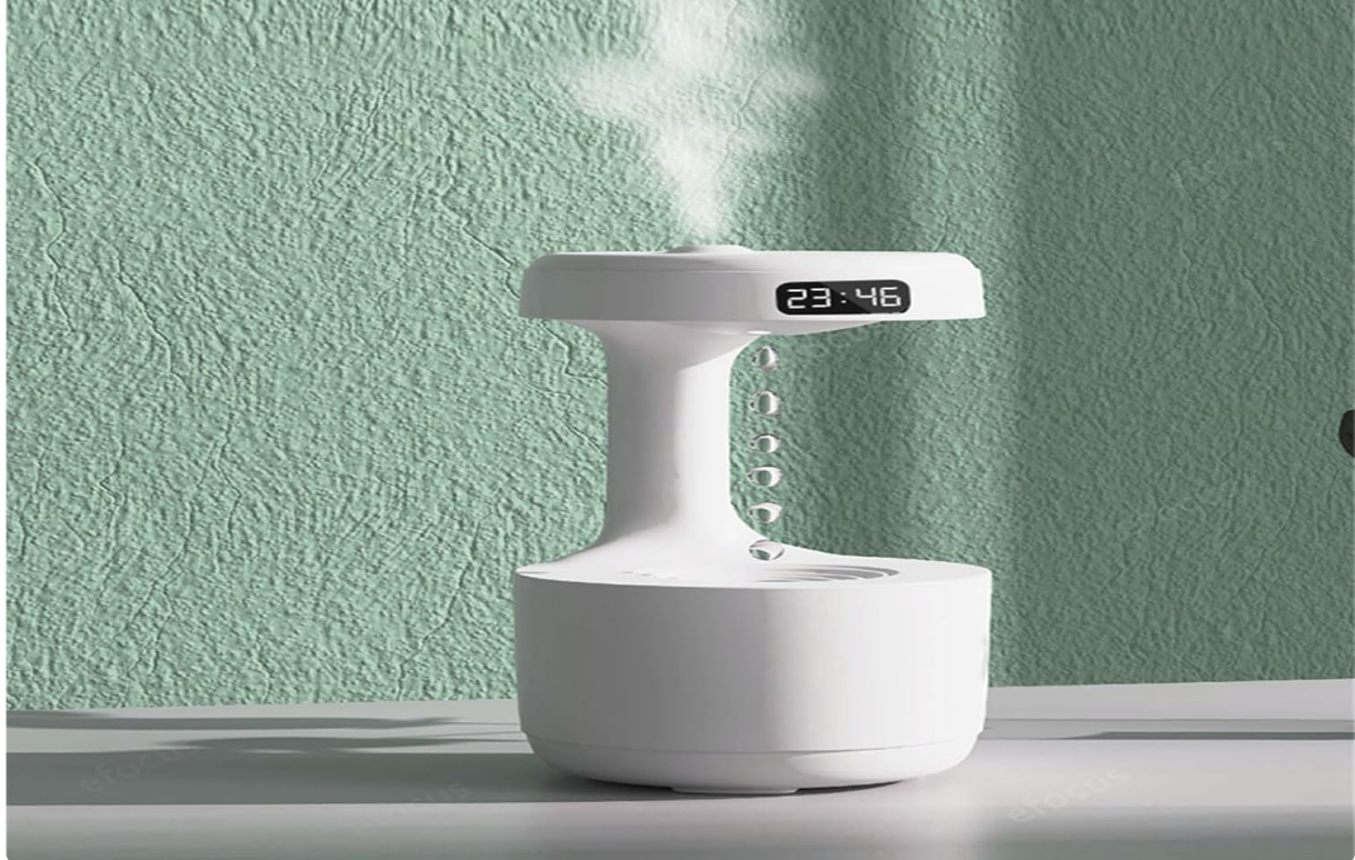
Figure 6.2: The humidifier producing a fine nano mist for efficient humidification.

The spray is fine and foggy Rapid sweep to dry