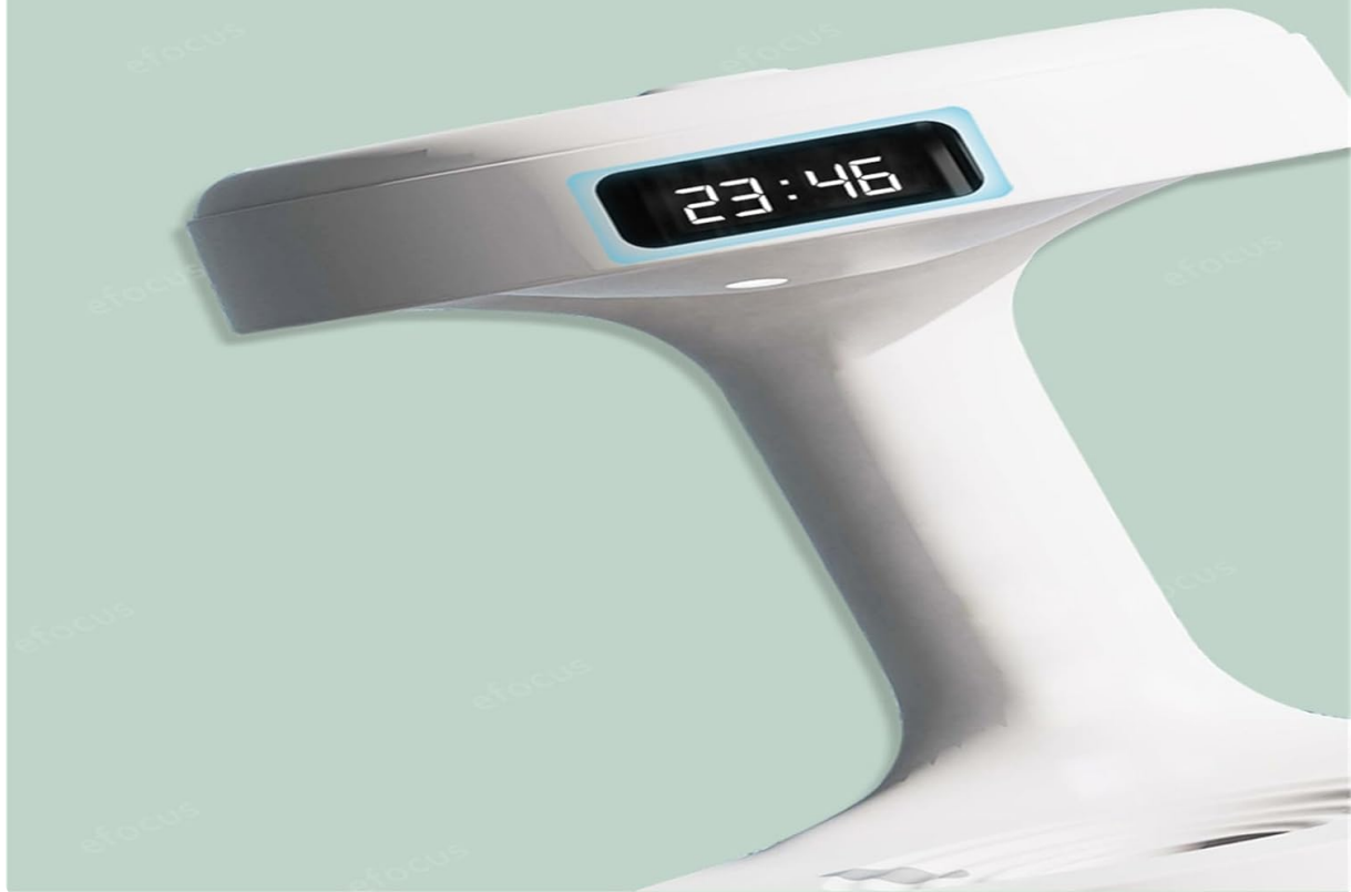
Figure 4.2: Close-up view of the humidifier's LED smart display, which shows real-time information.