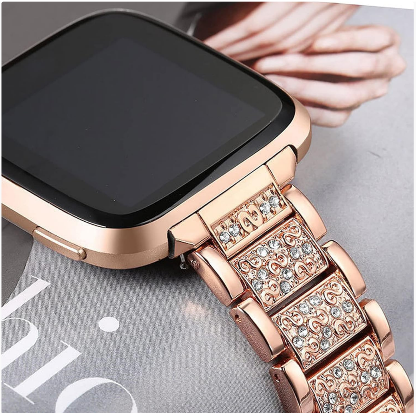
Image 3.1: The band securely attached to the IOWODO W13 Smartwatch.