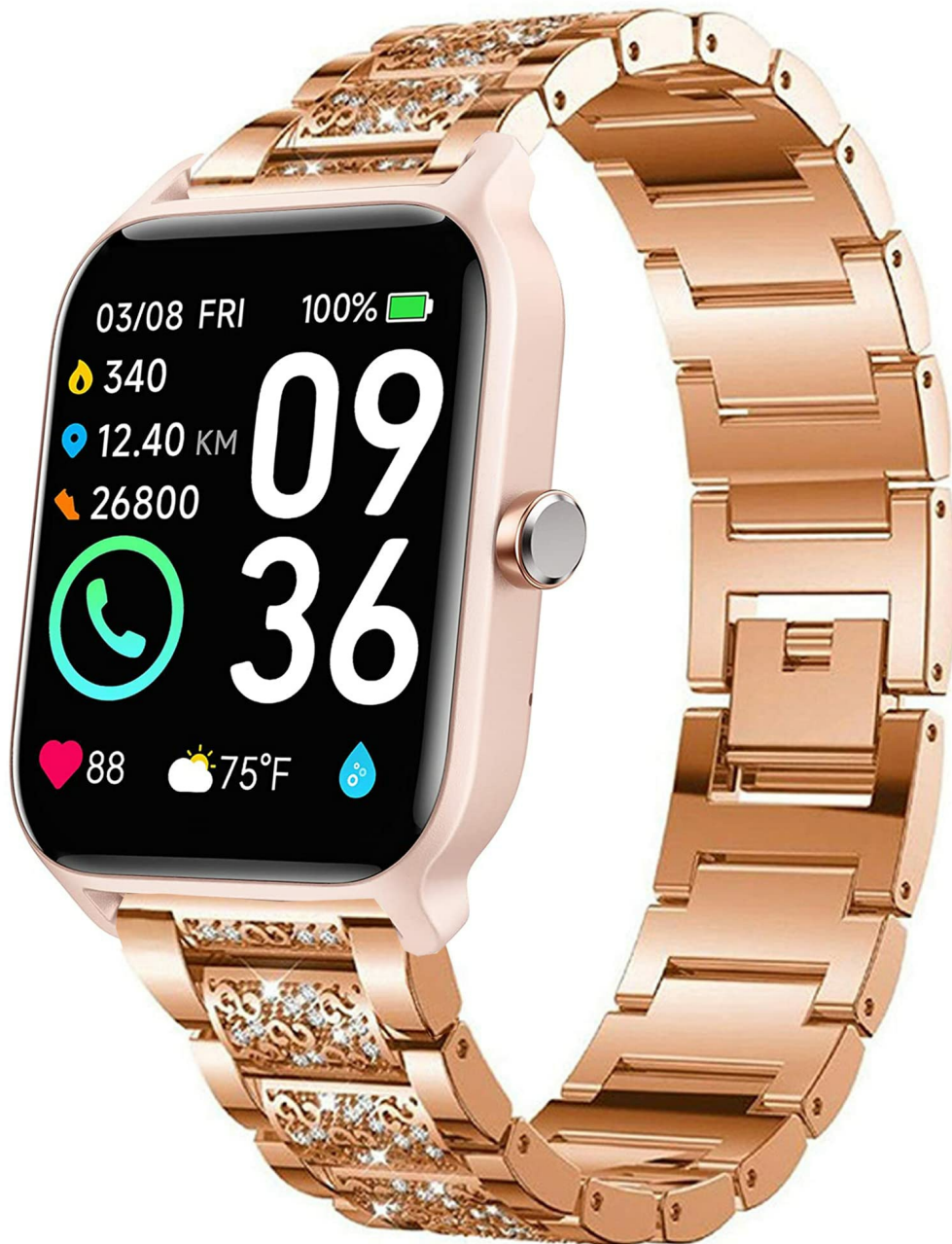
Image 1.1: The Blueshaweu compatible IOWODO W13 Smartwatch band in rose gold with rhinestone detailing.