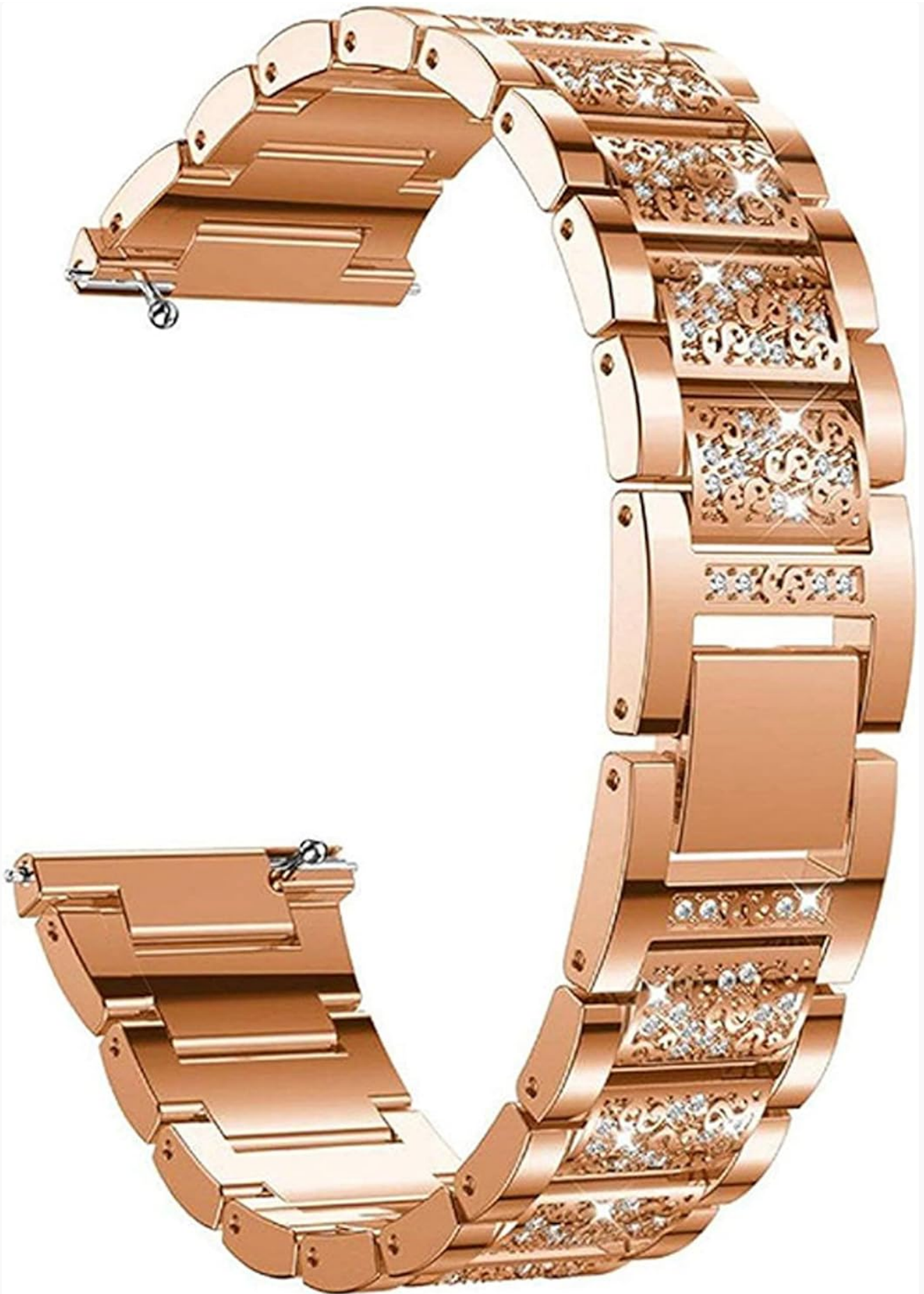
Image 2.1: Detail of the band's quick-release pins for attachment.