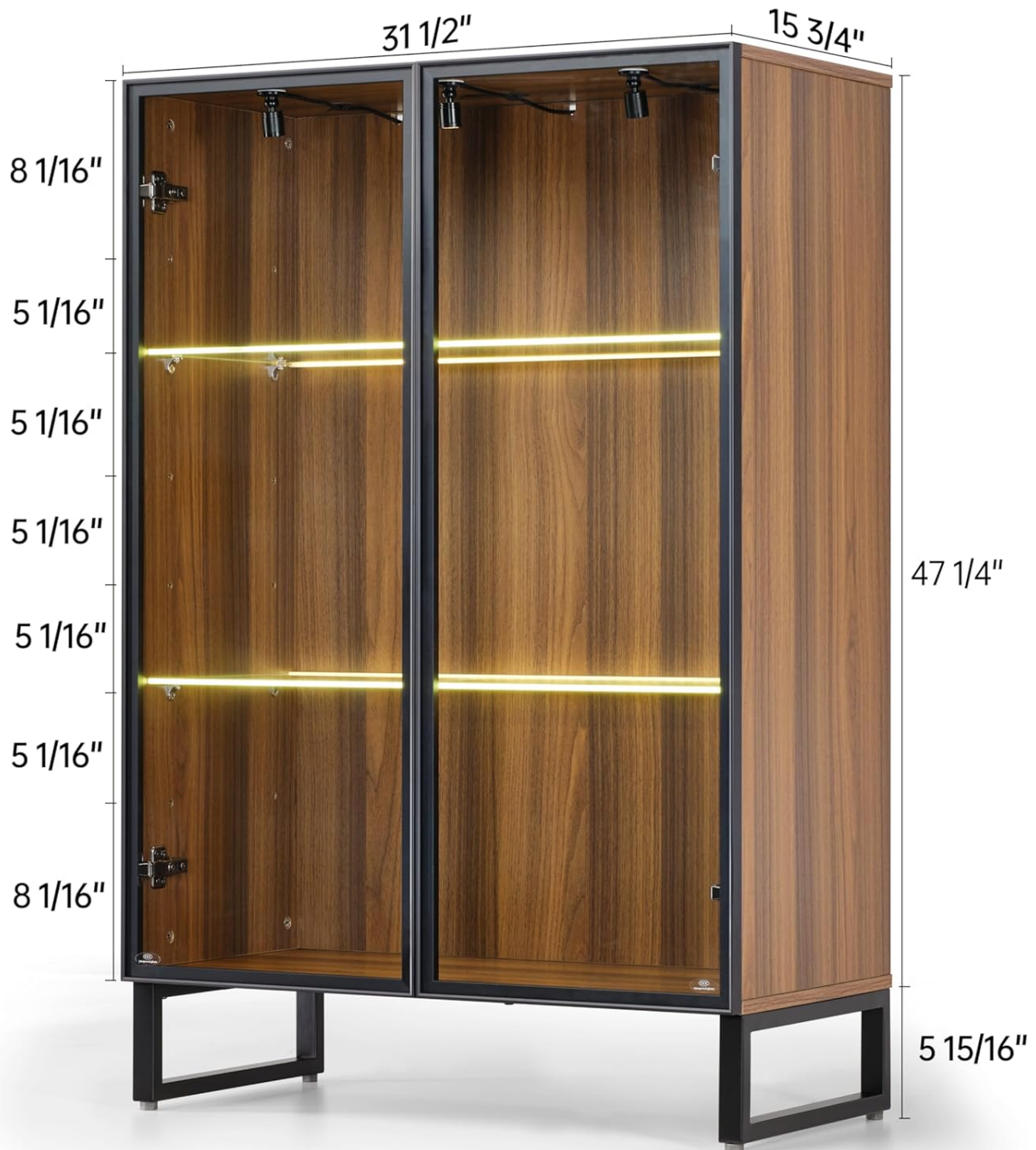
Image 8.1: Detailed dimensions of the EUREKA ERGONOMIC Curio Cabinet.