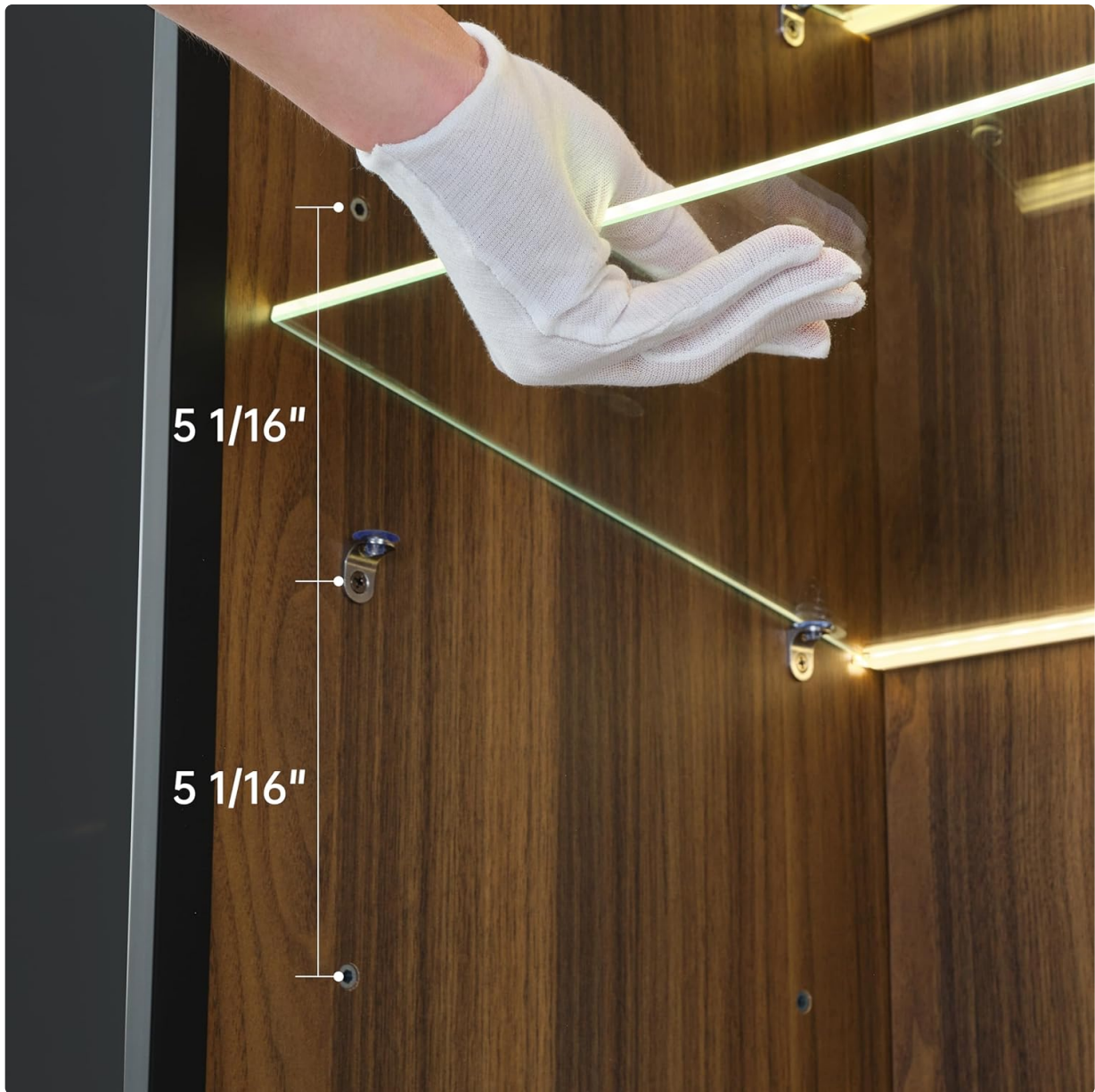
Image 4.1: Demonstrating the adjustment of a glass shelf within the cabinet.