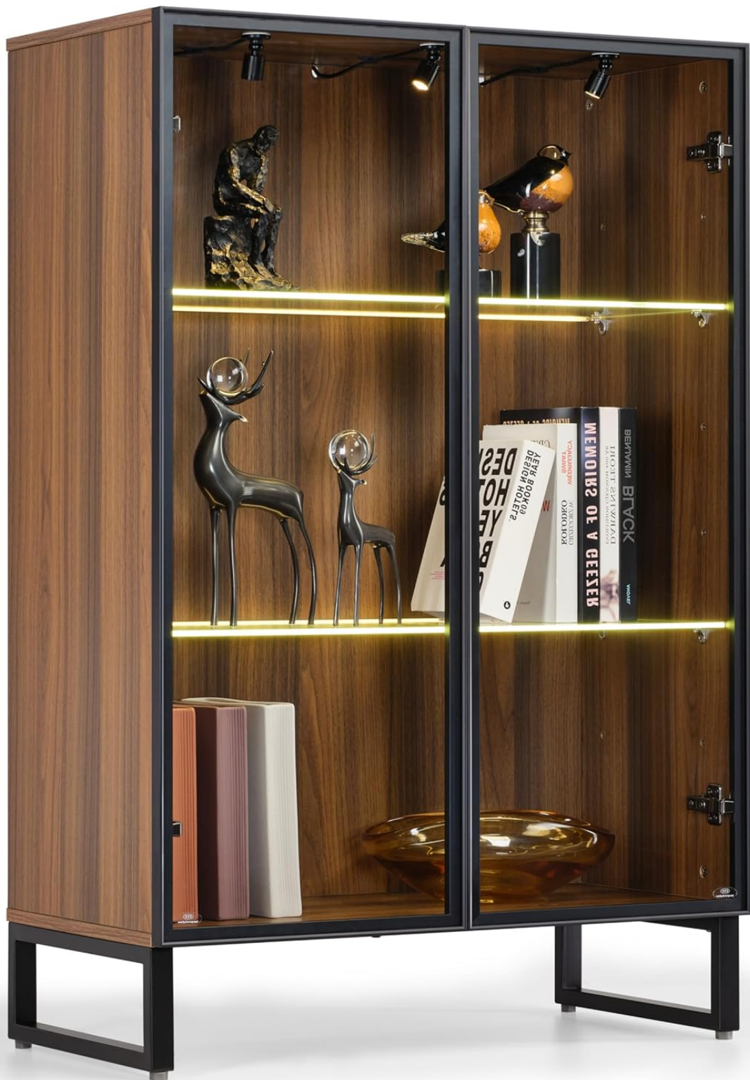
Image 1.1: Front view of the EUREKA ERGONOMIC Curio Cabinet, showcasing its design and illuminated interior.