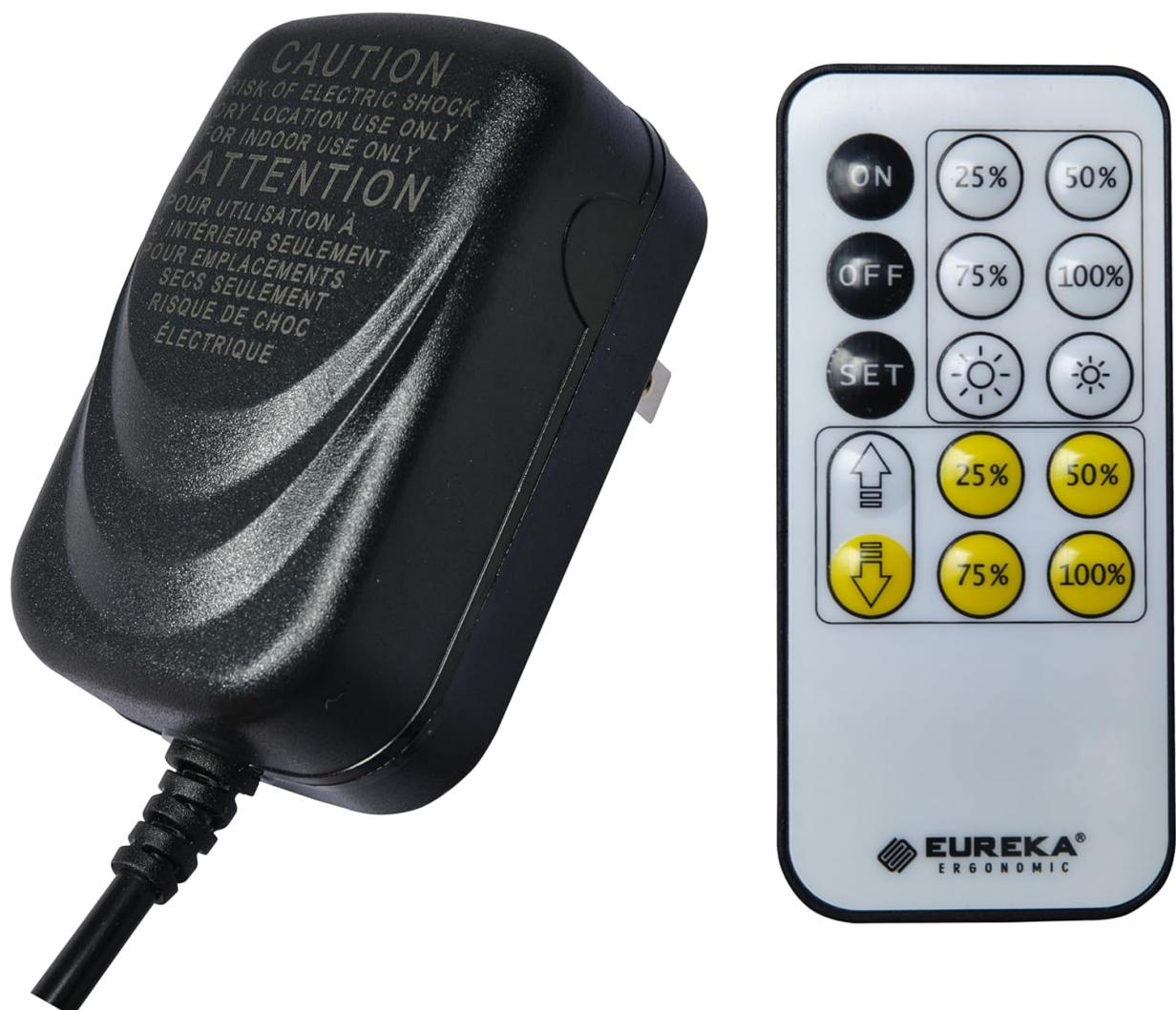
Image 3.1: Included power adapter and remote control for the LED lighting system.