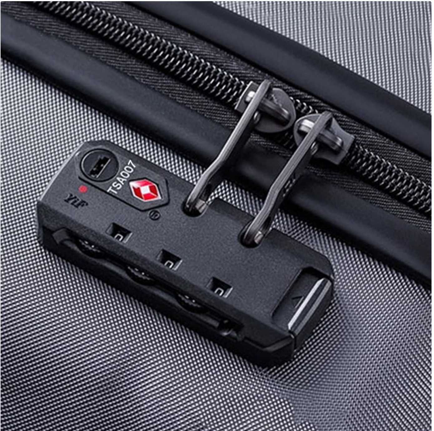
Image: The TSA 007 combination lock securely attached to the zippers of a piece of luggage, demonstrating its intended use.