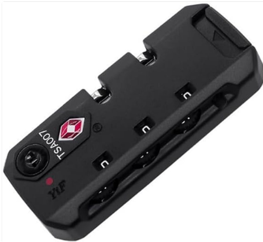
Image: The YUEHUA TSA 007 Approved Luggage Code Lock, showcasing its compact black design with the TSA 007 logo and three-digit combination wheels.