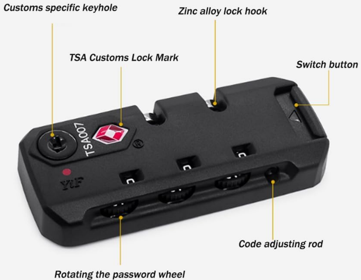
Image: Diagram illustrating the key components of the TSA 007 lock, including the Customs specific keyhole, Zinc alloy lock hook, TSA Customs Lock Mark, Switch button, Rotating password wheel, and Code adjusting rod.