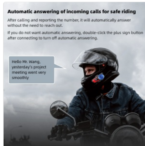
Image: A motorcyclist wearing a helmet with the Khptop X7 headset, illustrating the automatic answering feature for safe riding.