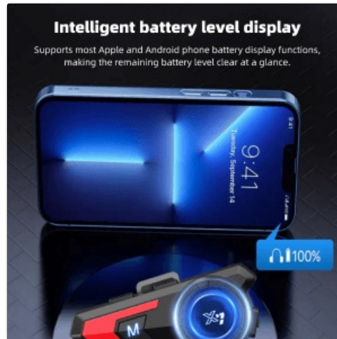
Image: A smartphone screen showing the intelligent battery level display for the Khptop X7 headset, indicating a full charge.

The headset supports battery level display functions on most Apple and Android phones, allowing you to monitor the remaining battery level directly on your phone screen.