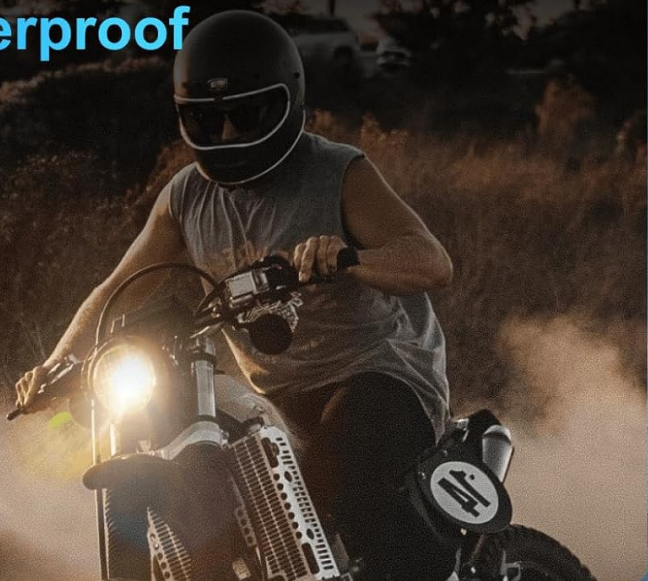
Image: The Khktop X7 headset shown in scenarios with rain and dust, highlighting its IP67 waterproof and dustproof design for reliable performance in harsh environments.