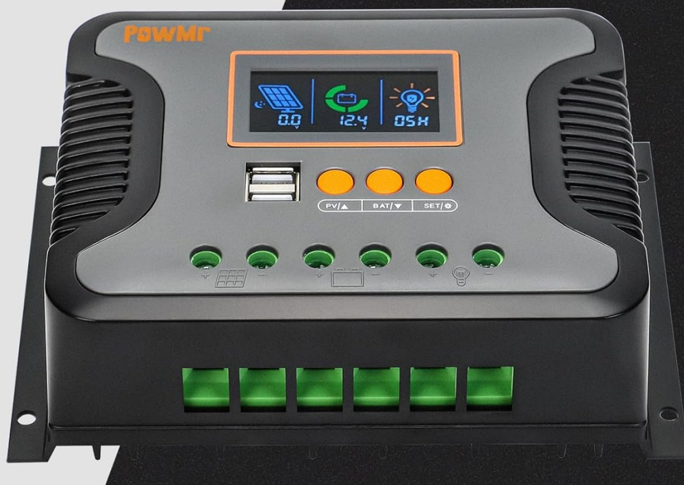
Figure 3.3: Illustration of the controller's compatibility with different battery types, including Lithium Iron Phosphate (LiFePO 4 ), Sealed Lead-Acid (SLA), GEL, Flooded (FLD), and AGM batteries.

Operating Temperature Range -20^{\circ}\text{C}\sim+55^{\circ}\text{C}