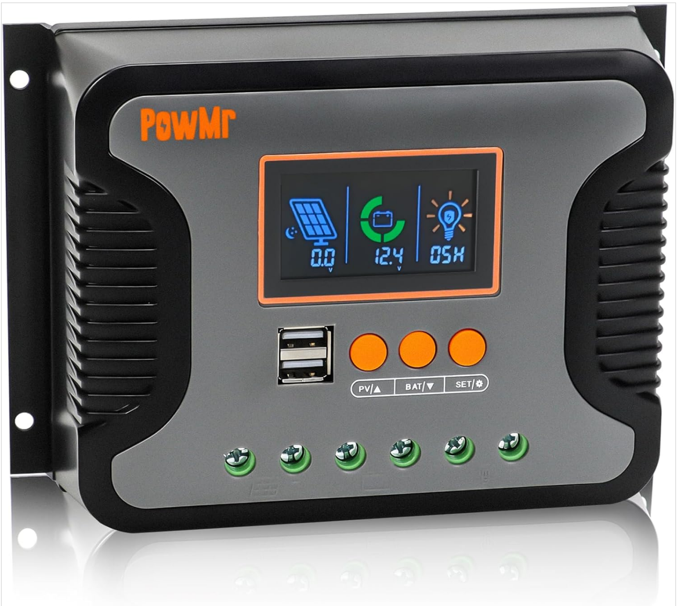
Figure 3.1: Front view of the PowMr 80A Solar Charge Controller, highlighting key technical specifications such as Max. PV Open Circuit Voltage (100V), Rated Charging Current (80A), Nominal System Voltage (12V/24V/36V/48V Auto), Charging Technology (PWM), Charge Algorithm (3-Stages), USB Interface (5V/2A*2), Net weight (0.75 kg), and Operating Temperature Range (-20°C ~ +55°C).