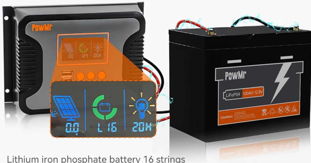
L16: Lithium iron phosphate battery 16 strings