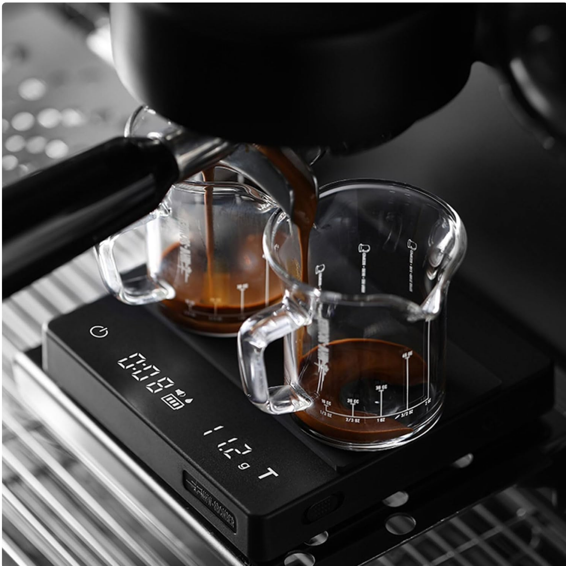
Image: Espresso extraction using the scale's intelligent mode.