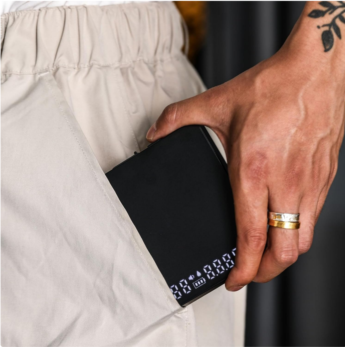
Image: The compact size of the MHW-3BOMBER Mini Digital Coffee Scale, fitting easily into a pocket.