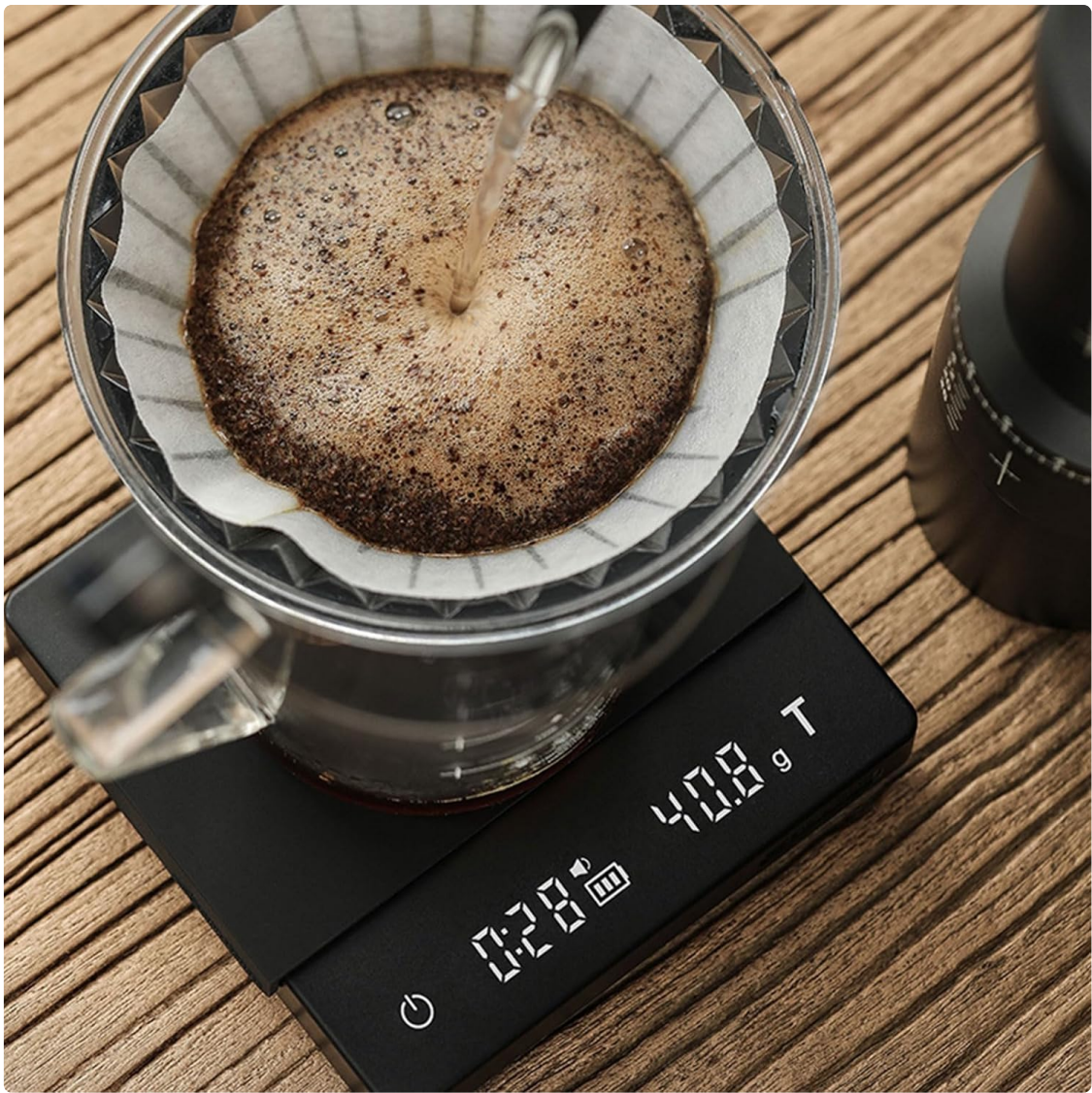
Image: Drip coffee brewing with the scale's intelligent mode.