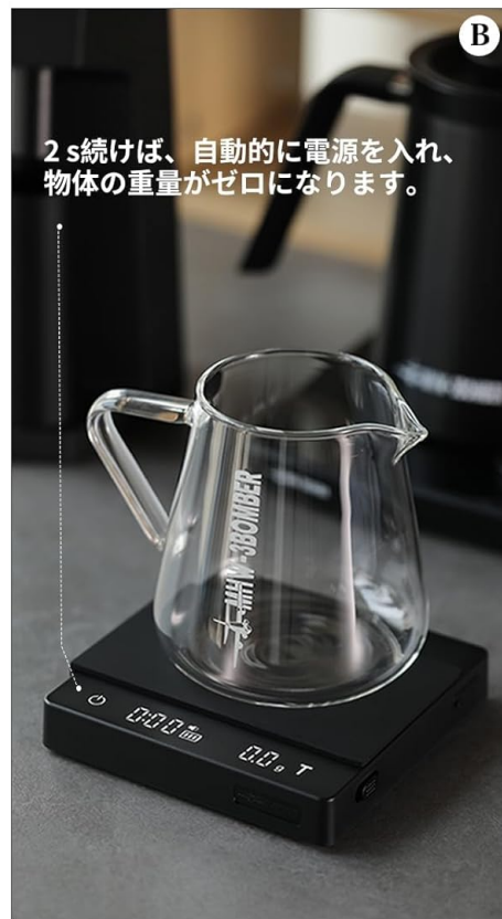
Image: Illustration of the gravity sensing feature, where placing an object on the scale automatically powers it on and tares.