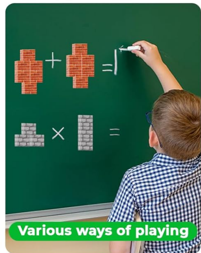
Image: Illustration of the cubes' flexible and neat alignment, strong magnets, and various play methods.