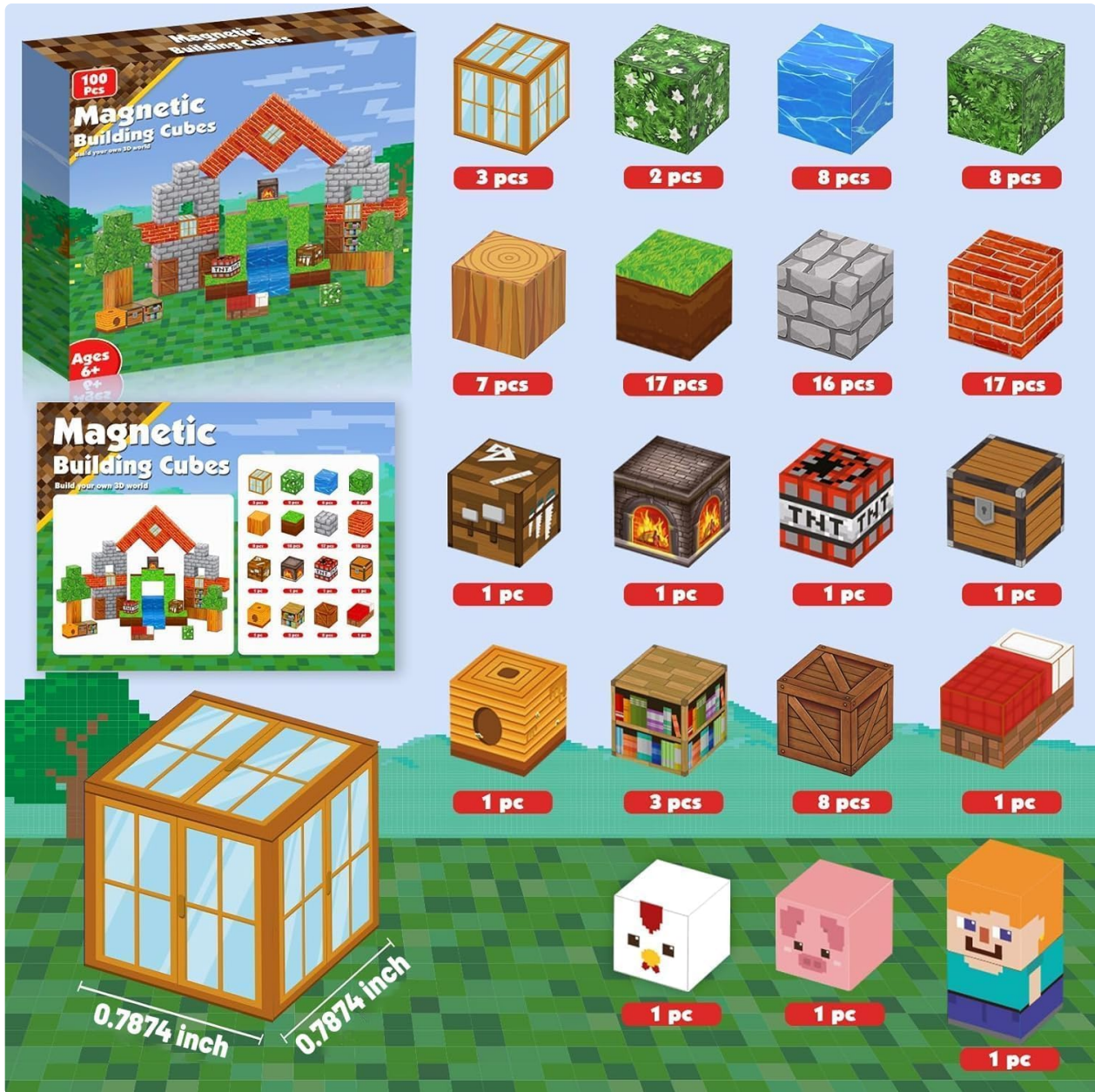
Image: The product box illustrating the 100 pieces and their distribution.

Your Goody King Magnetic Building Cubes set includes the following 100 pieces: