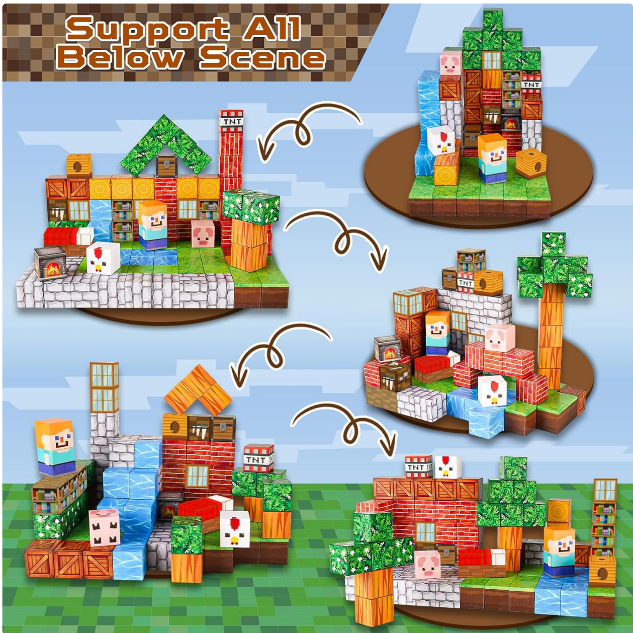
Image: Multiple examples of structures and scenes that can be created with the magnetic cubes.