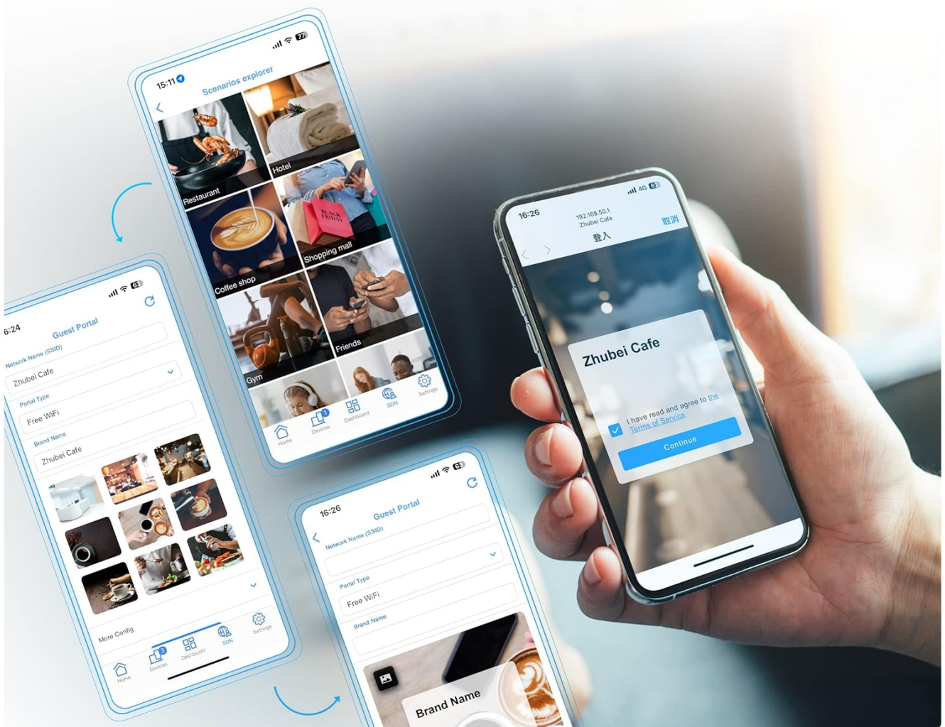
Image: A smartphone screen displaying the user-friendly interface for setting up and customizing the guest portal on the ASUS ExpertWiFi EBM68.