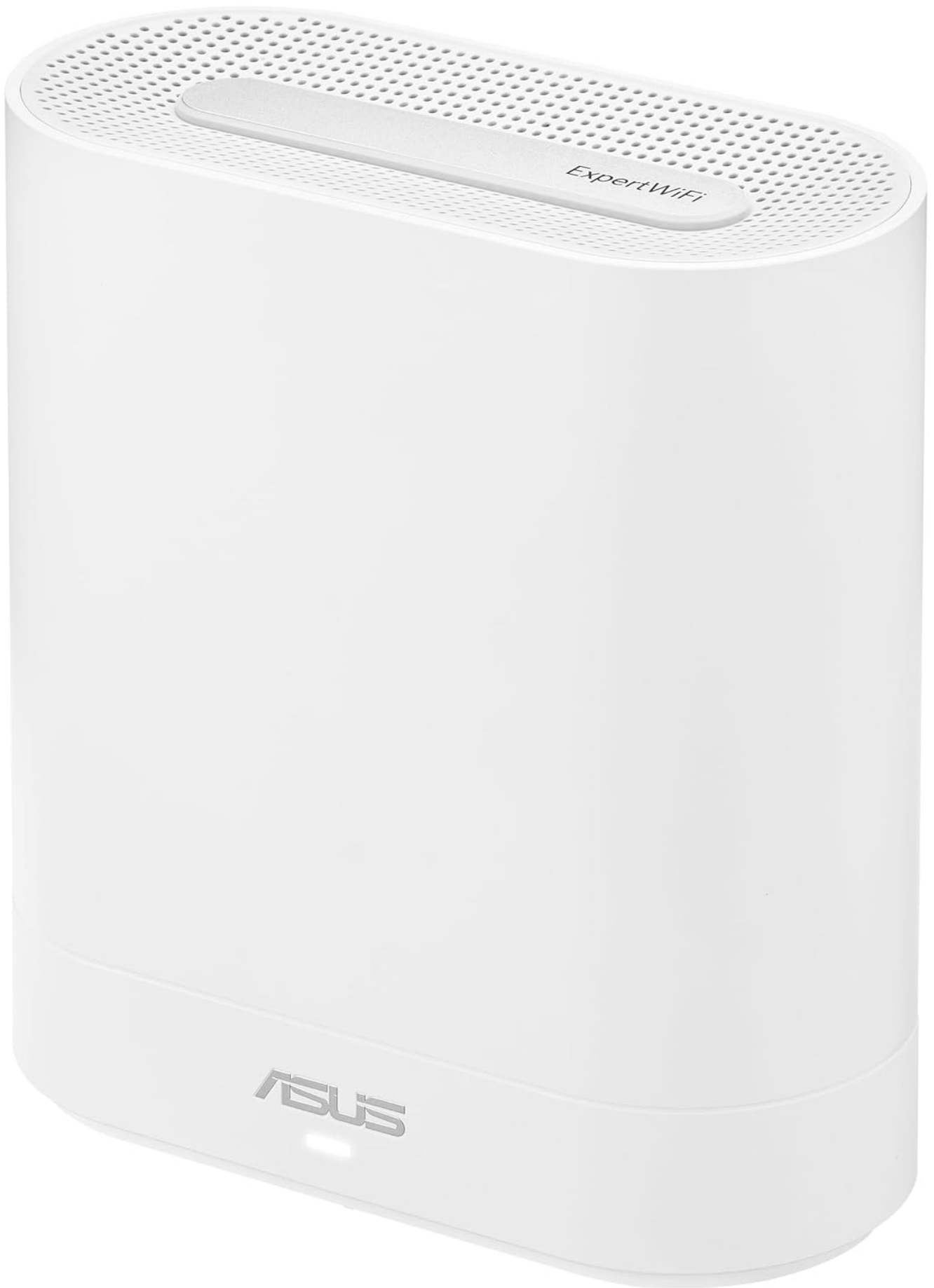
Image: The ASUS ExpertWiFi EBM68 unit, a white, cylindrical device with the ASUS logo.