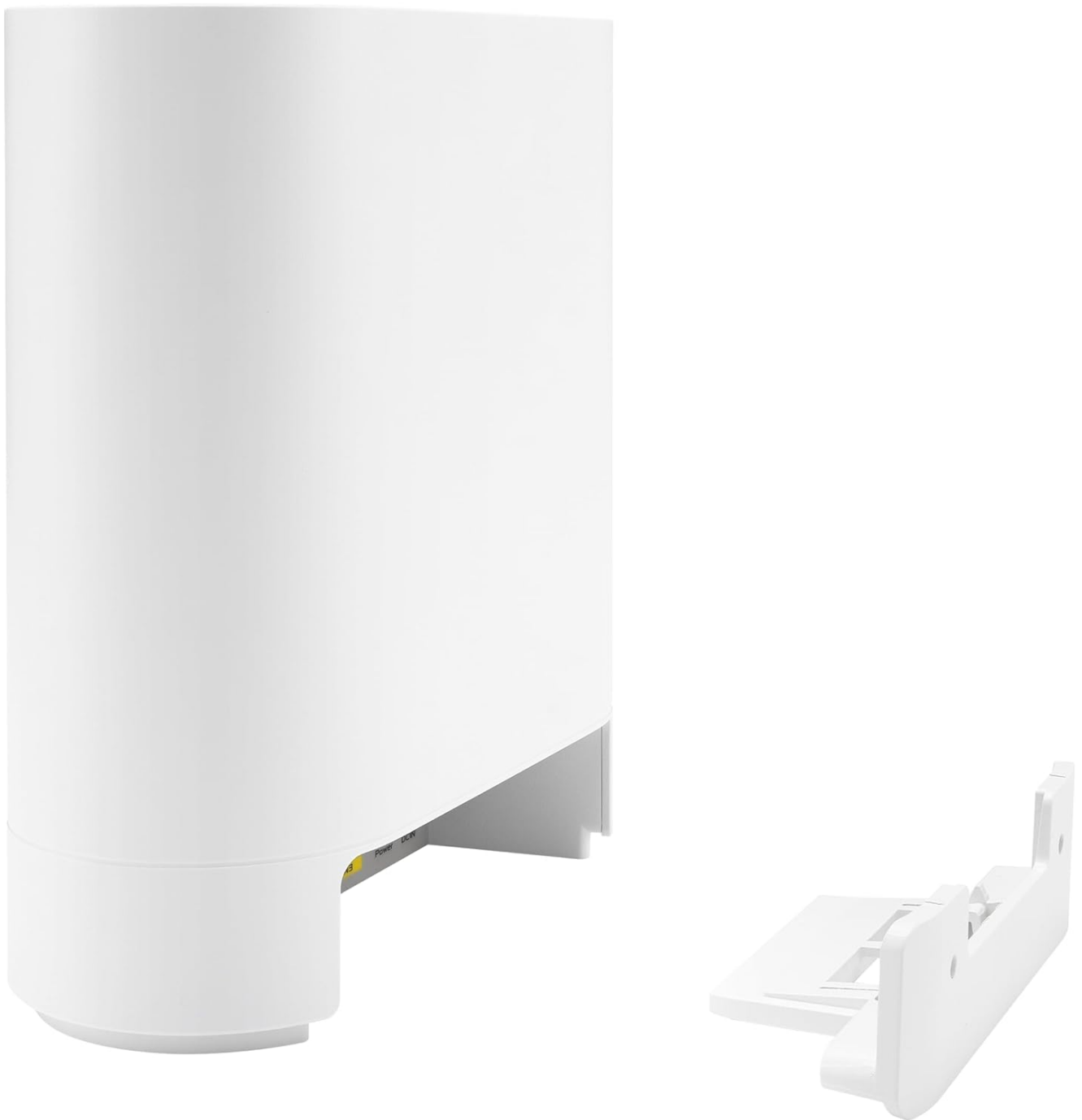
Image: Close-up of the wall-mount bracket included with the ASUS ExpertWiFi EBM68, demonstrating its design for secure installation.