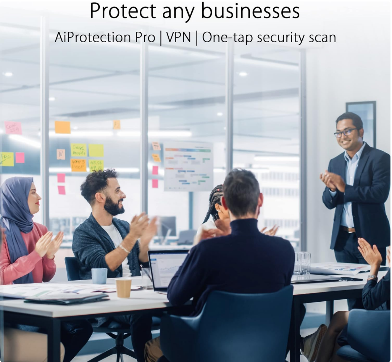
Image: A business meeting setting with a digital overlay symbolizing network security, highlighting the AiProtection Pro and VPN capabilities of the ASUS ExpertWiFi EBM68.

AiProtection Pro | VPN | One-tap security scan