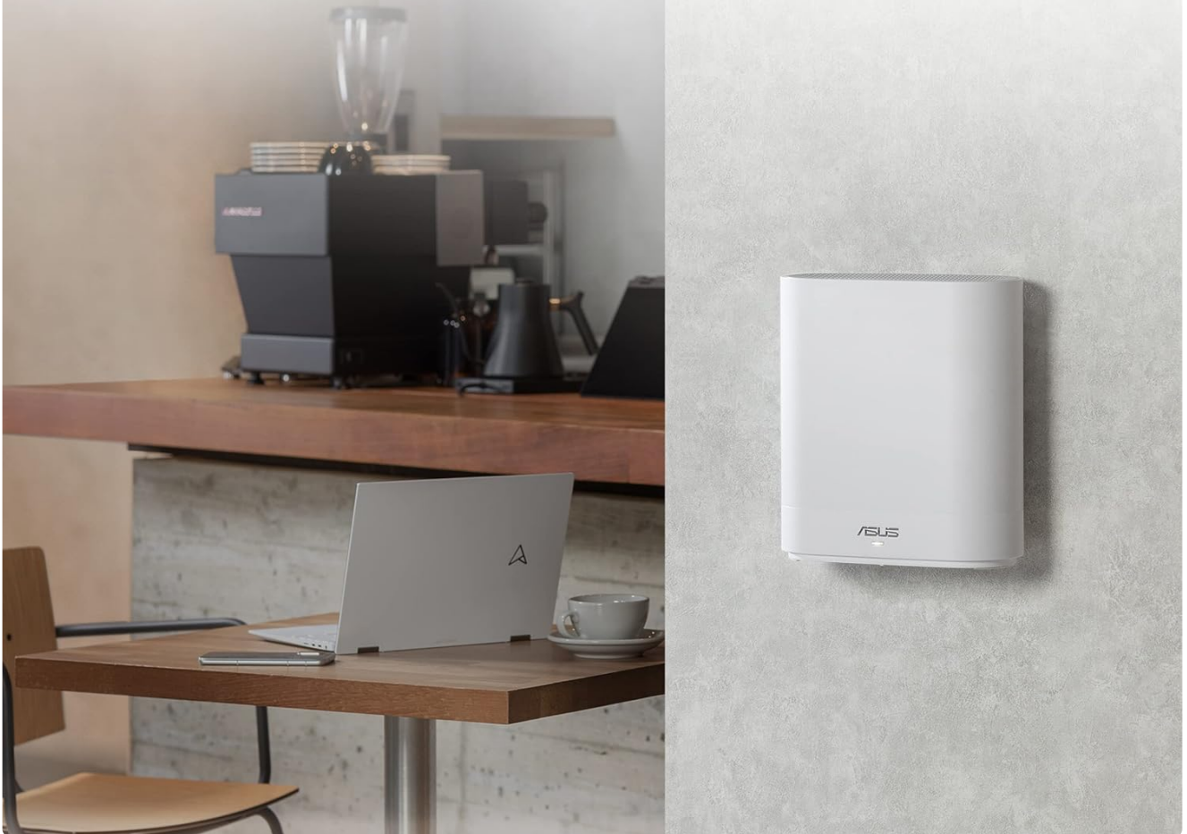
Image: The ASUS ExpertWiFi EBM68 unit shown mounted on a wall, illustrating its adaptability for various office or business environments.