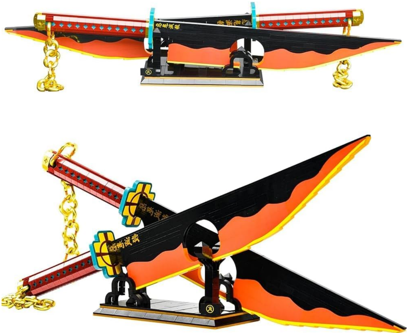
Figure 1: The completed SATHIBI Tengen Uzui Sword Building Set on its display stand.

The following images and videos illustrate key aspects of the building process and the finished product.