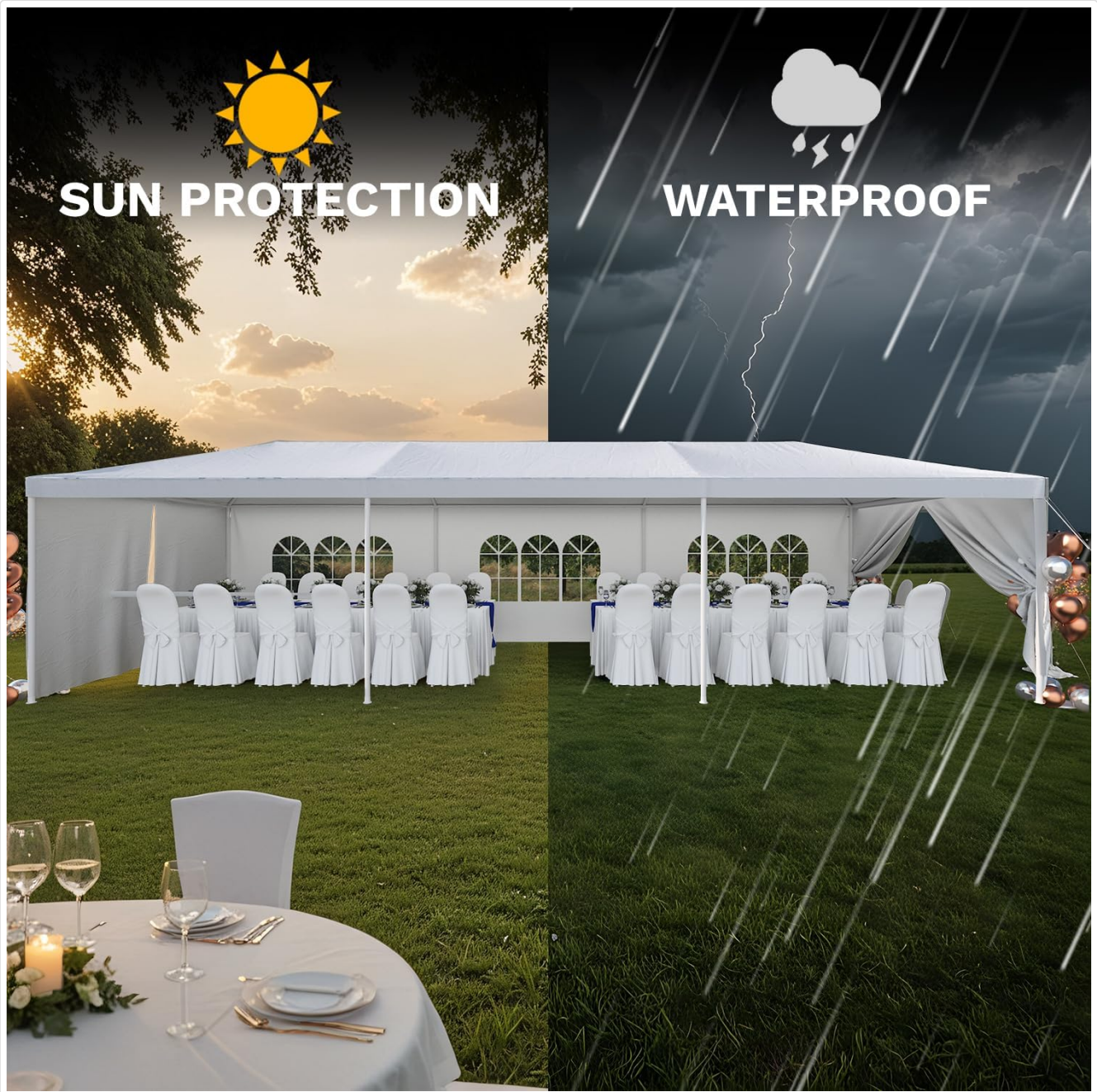
Figure 5.1: Tent offering both sun protection and waterproof capabilities.