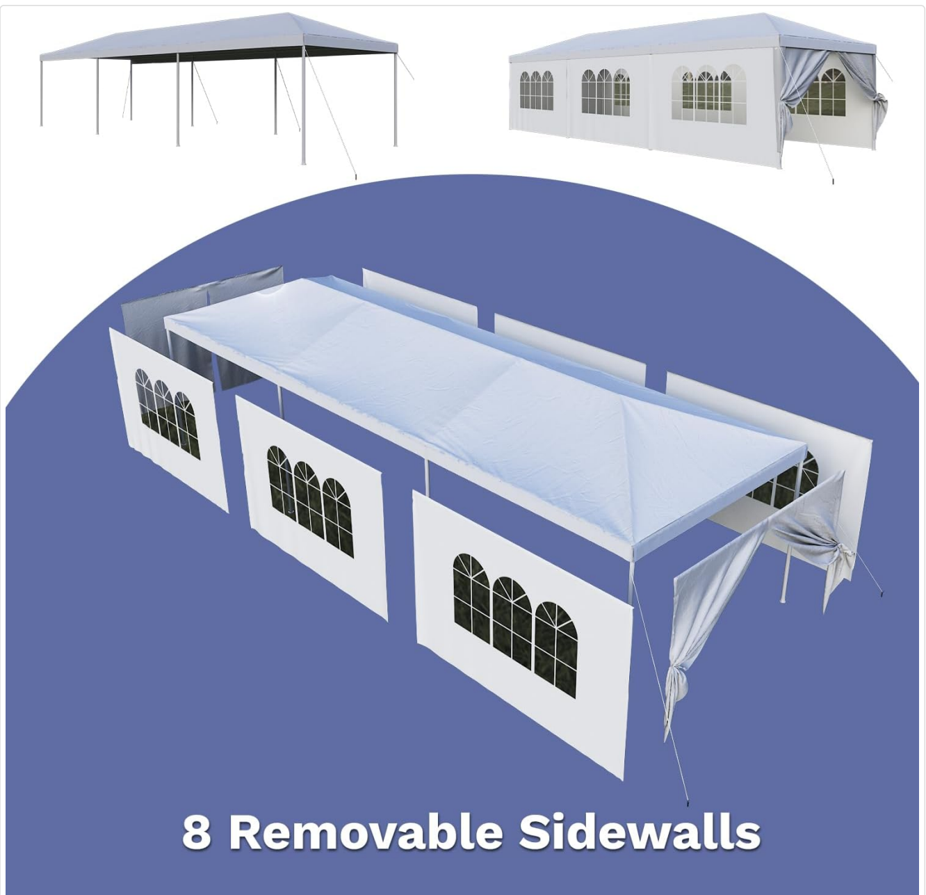
Figure 3.1: Exploded view of tent components, including 8 removable sidewalls.