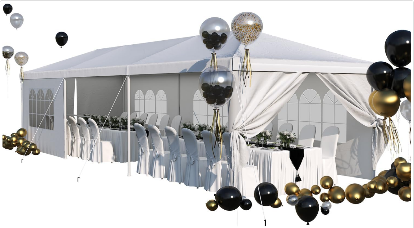
Figure 1.1: Devoko 10x30 FT Canopy Tent in a party setting.

The Devoko 10x30 FT Waterproof White Canopy Tent is designed for various outdoor events, providing shelter and a spacious area for gatherings. This heavy-duty tent is suitable for weddings, parties, backyard events, and patio use. It features a rust-proof metal frame, high-density polyethylene top, and reinforced side ropes for stability. This manual provides essential information for the safe and effective setup, operation, and maintenance of your canopy tent.