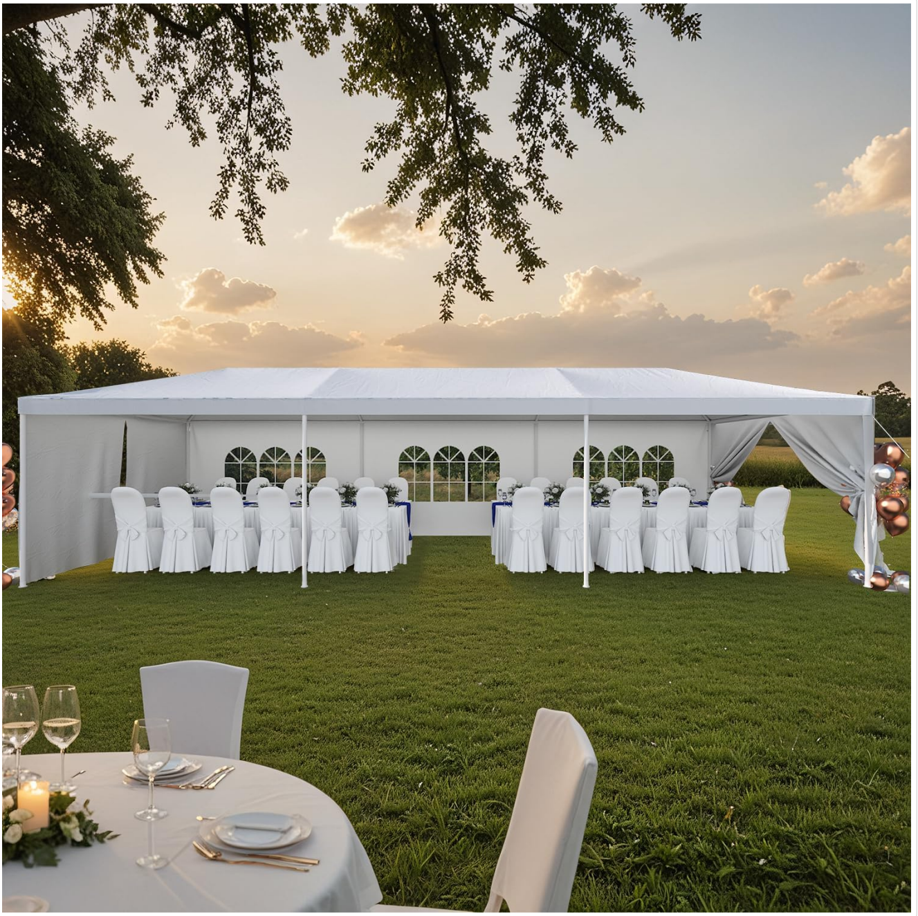
Figure 4.1: Tent fully assembled and set up in an outdoor environment.