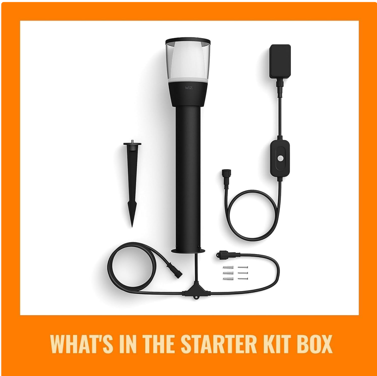
Image: All components included in the WiZ Elpas Bollard Starter Kit, laid out for clear viewing.