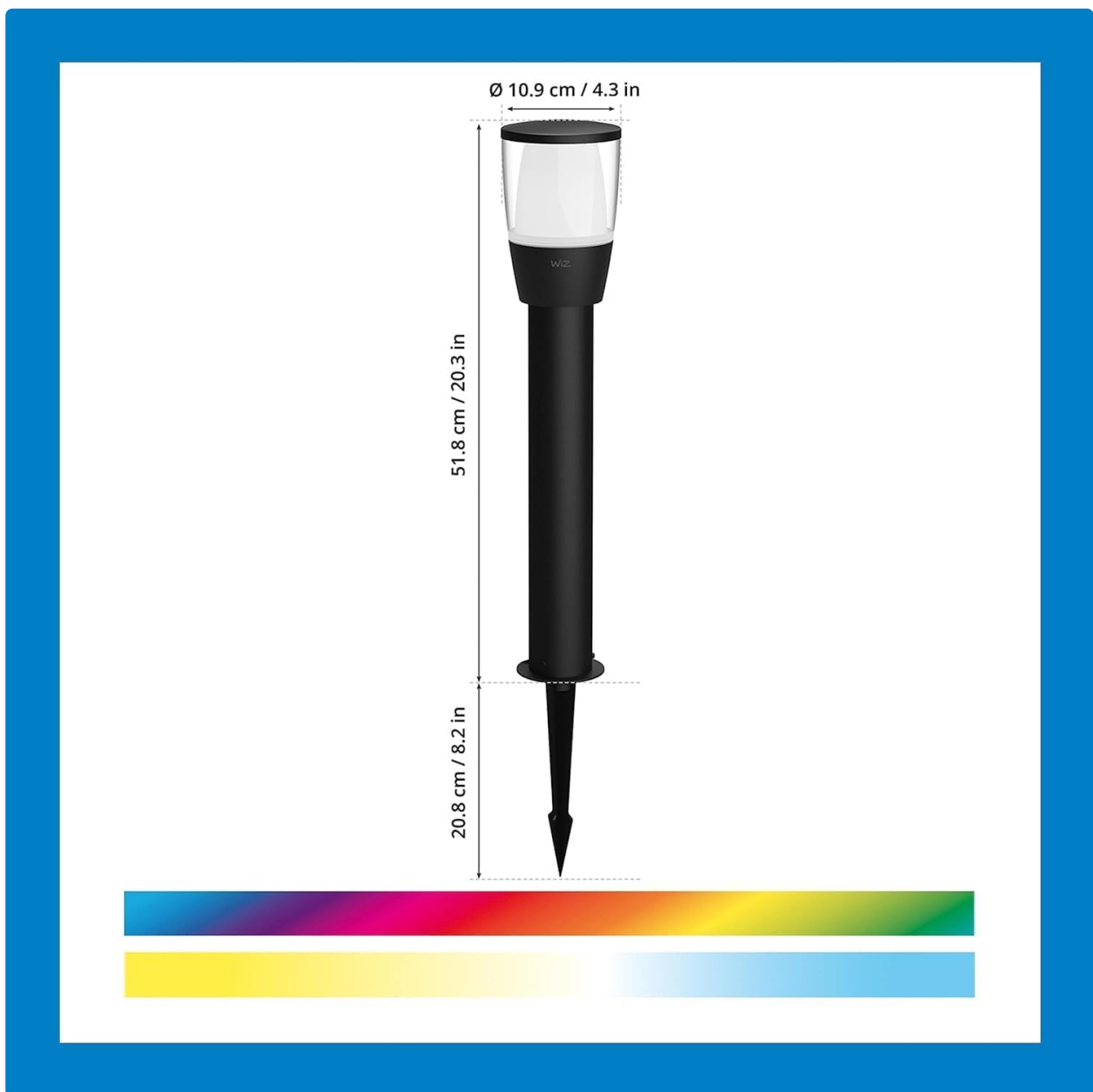
Image: Detailed dimensions of the WiZ Elpas Bollard Light, showing height and diameter.