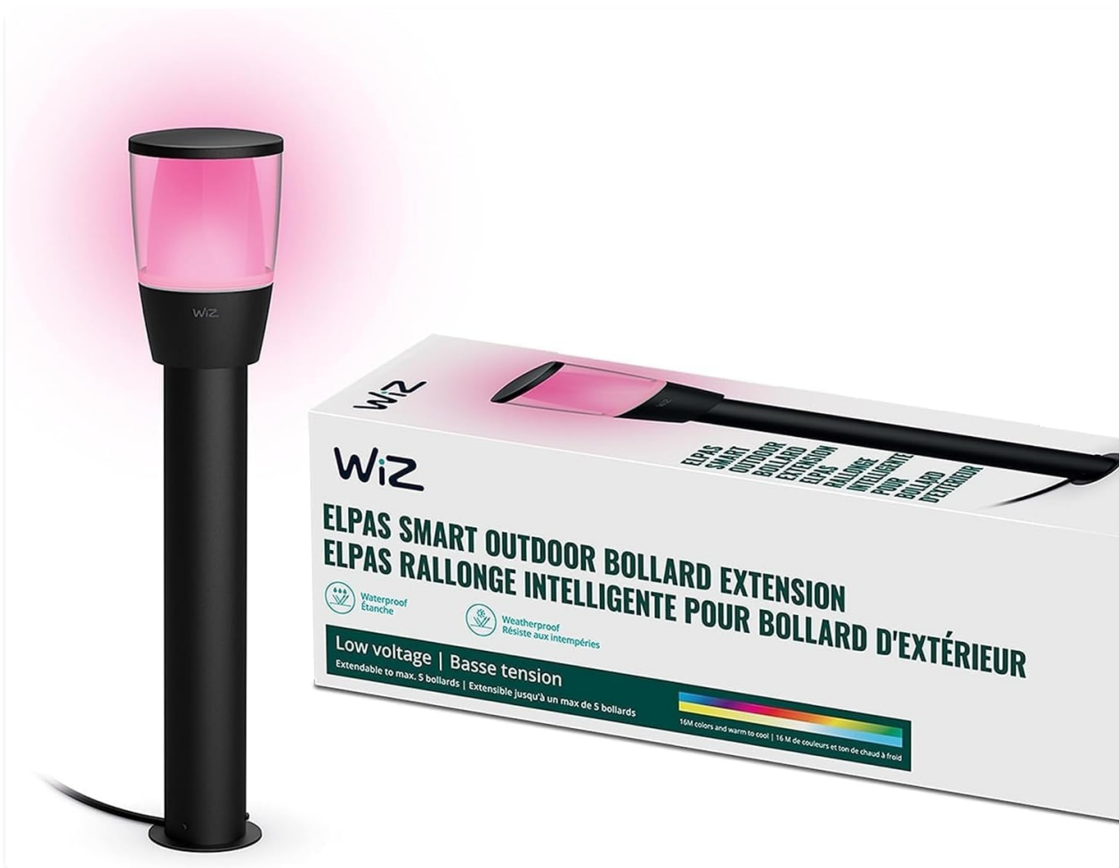
Image: The WiZ Elpas Bollard Smart WiFi Outdoor LED Path Light Starter Kit, showcasing the bollard light and its packaging.