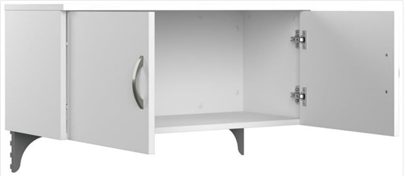
Figure 5.1: Interior of the storage cabinet, showing ample space for office supplies.