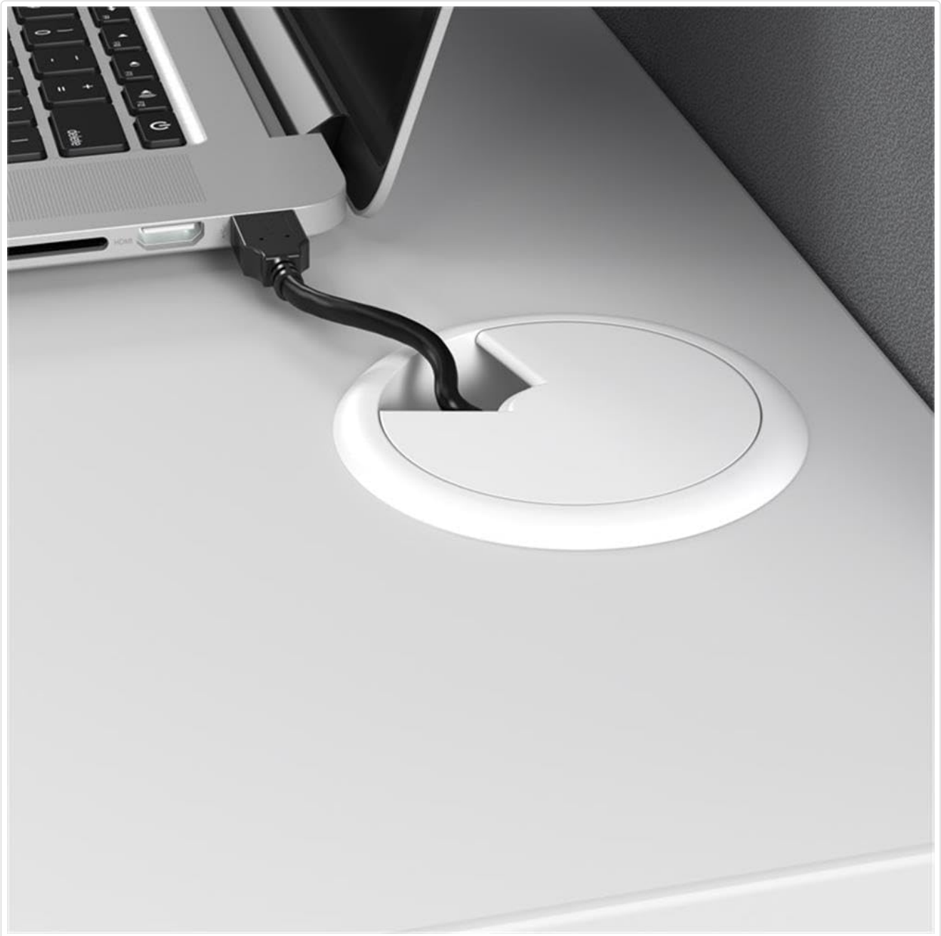
Figure 5.3: Desktop grommet for routing cables, keeping the work surface clear.