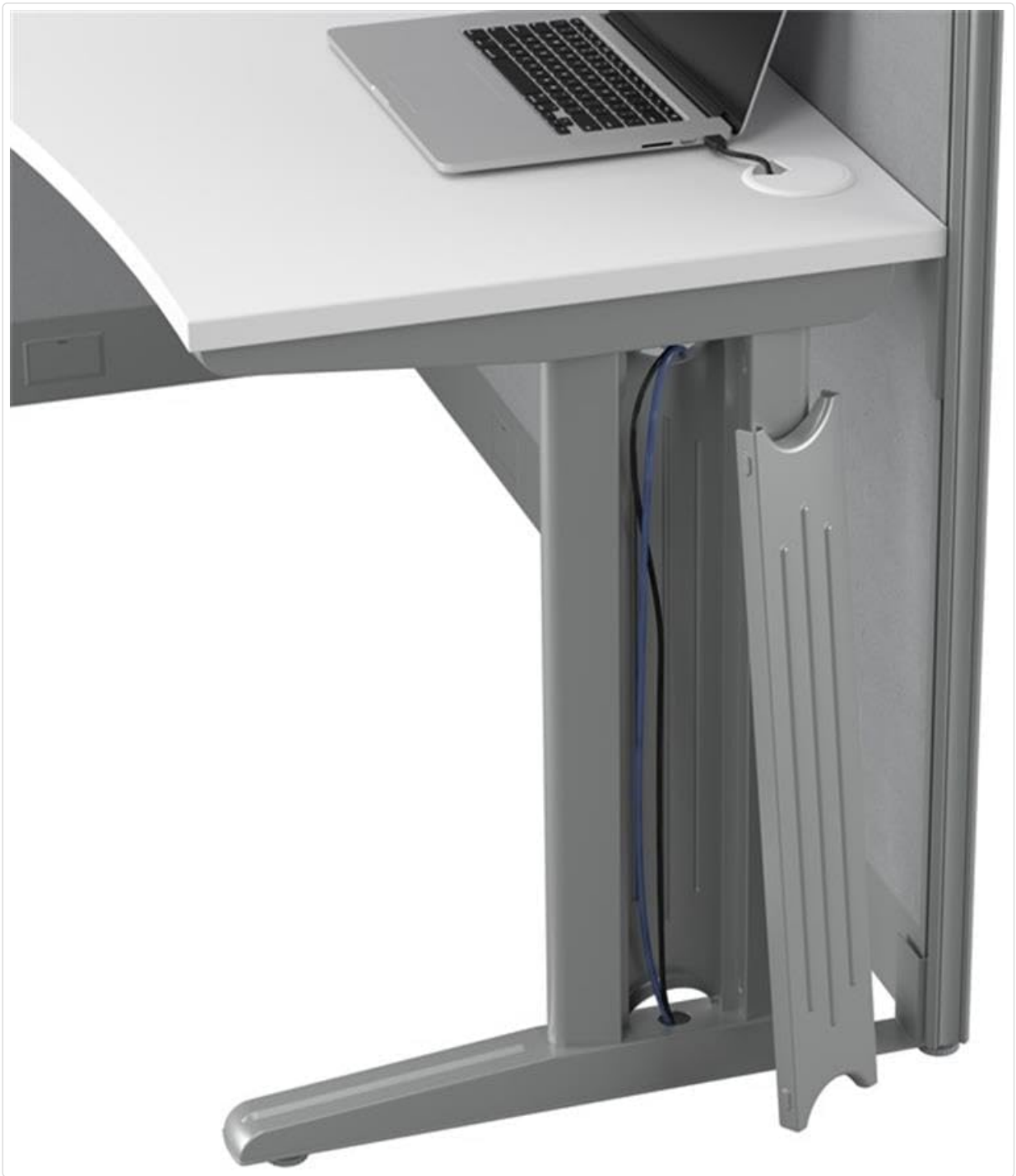
Figure 5.4: Removable leg panel for discreet cable organization along the desk frame.