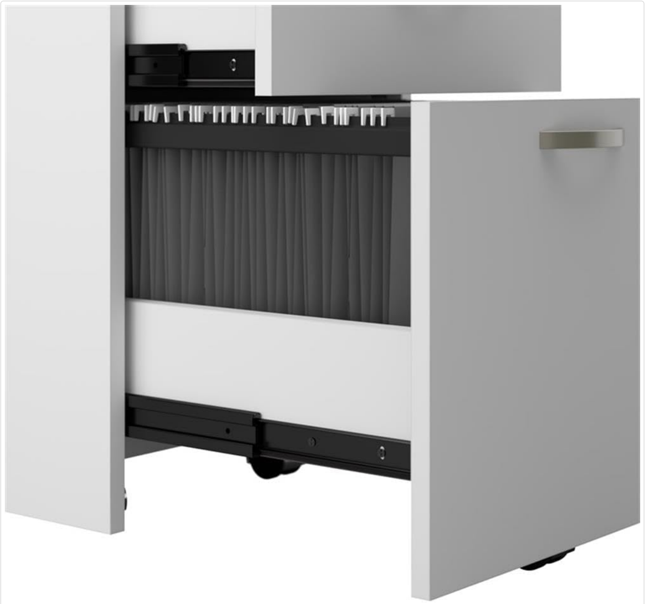
Figure 5.2: File drawer of the mobile cabinet, designed for organized document storage.