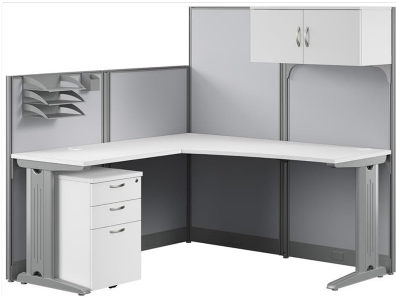
Figure 1.1: The Bush Business Furniture Office in an Hour 65W L-Shaped Cubicle Desk in Pure White.

This manual provides comprehensive instructions for the assembly, operation, and maintenance of your Bush Business Furniture Office in an Hour 65W L-Shaped Cubicle Desk. This L-shaped desk with storage is designed to create a functional and productive workspace, featuring privacy panels, integrated storage, and cable management solutions.