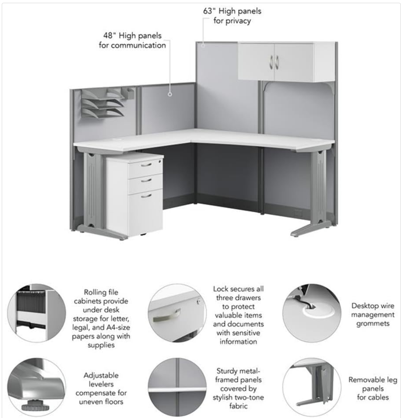
Figure 3.1: Key components and features of the L-shaped cubicle desk, including privacy panels, mobile file cabinet, and cable management.