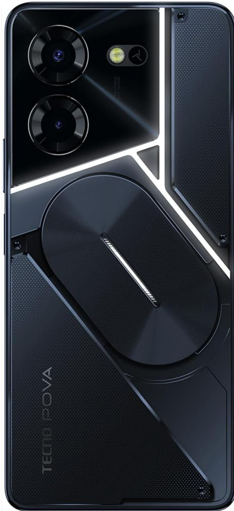
Image: The rear view of the TECNO Pova 5 Pro 5G, showcasing its distinctive 3D textured design and the illuminated ARC interface.