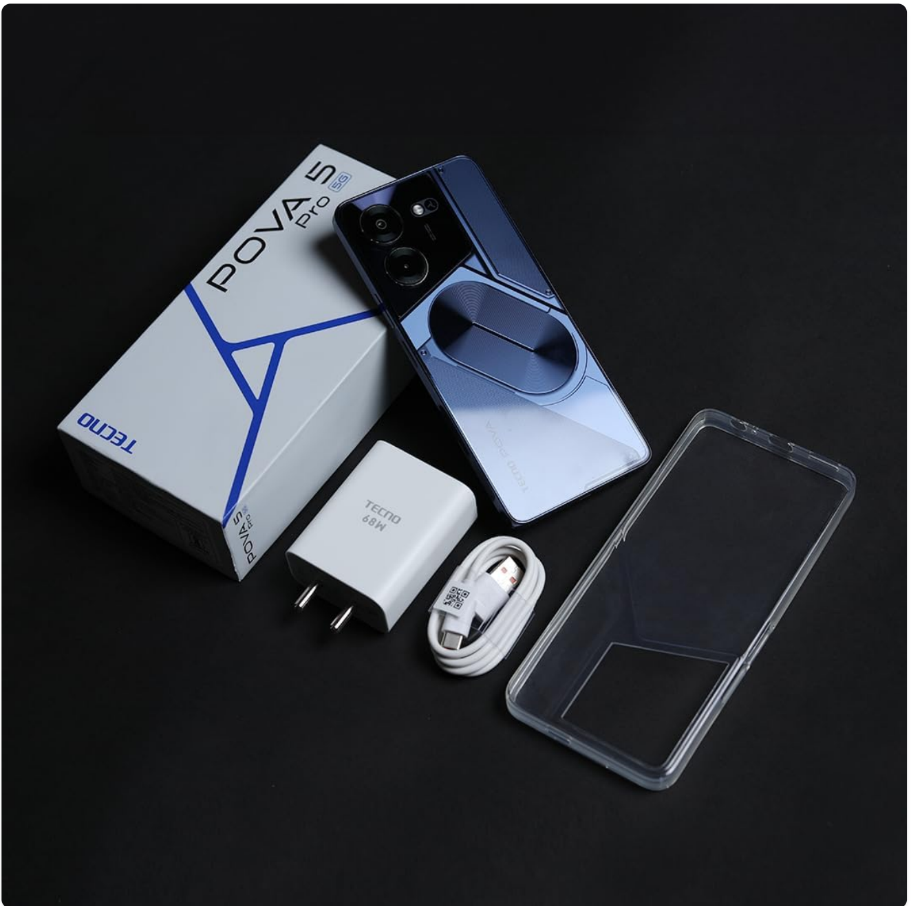
Image: A flat lay of the TECNO Pova 5 Pro 5G packaging contents, showing the smartphone, 68W power adapter, USB-C cable, TPU protective cover, and the SIM ejector tool.