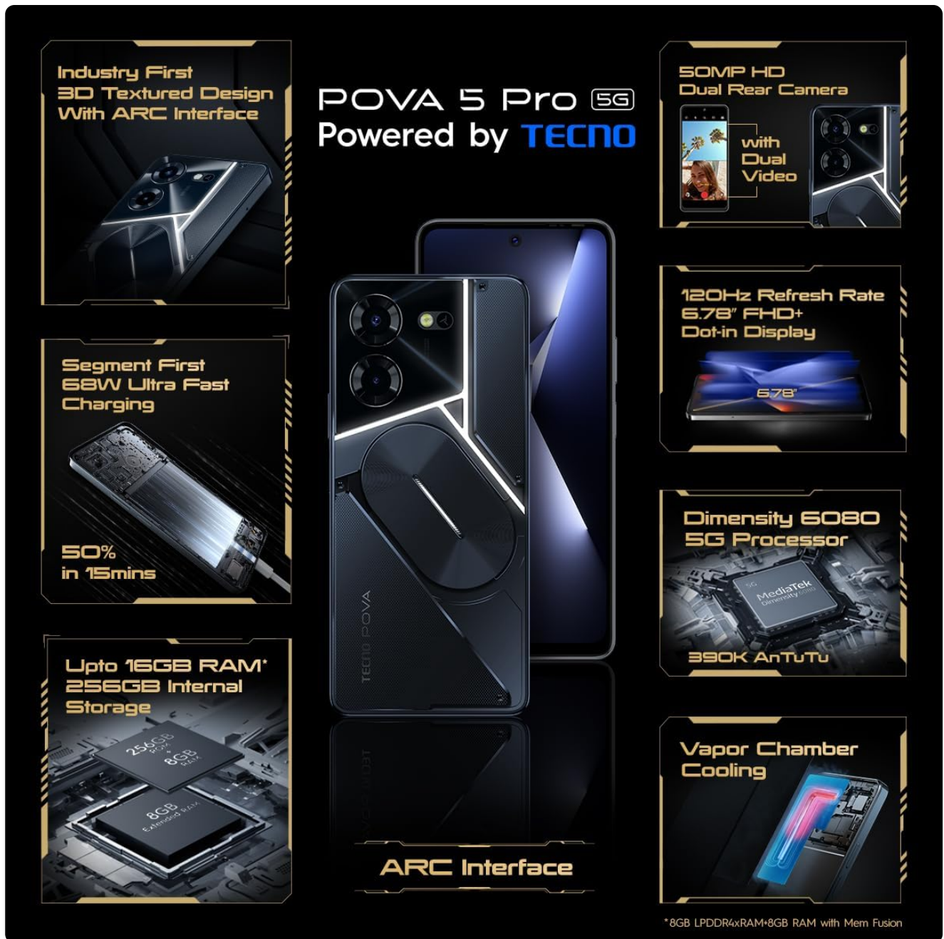
Image: A clear front view of the TECNO Pova 5 Pro 5G smartphone, highlighting its display and front camera.