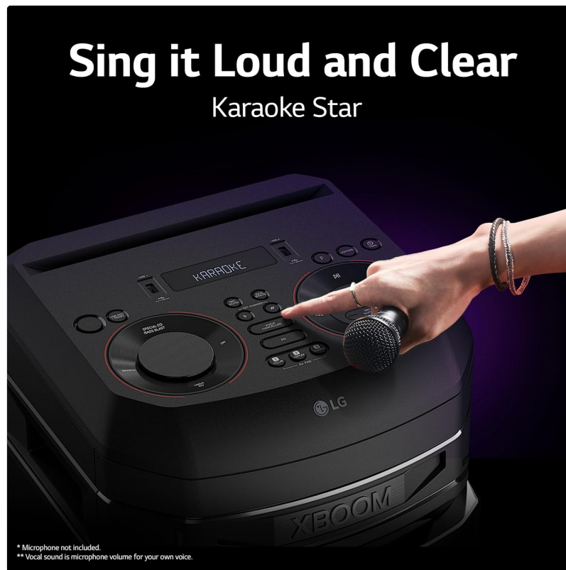
Figure 4: A hand interacting with the control panel of the LG XBOOM RNC9, with a microphone placed nearby, illustrating the Karaoke Star feature.