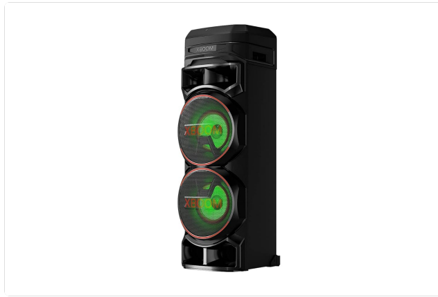
Figure 1: Front view of the LG XBOOM RNC9 Party Speaker, showing its tall, rectangular design with two large speaker grilles.