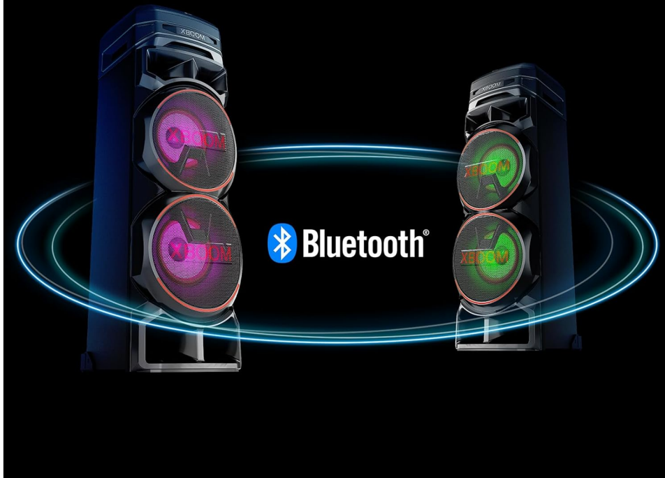
Figure 6: Two LG XBOOM RNC9 speakers positioned side-by-side, with a glowing blue circle and Bluetooth symbol indicating a wireless connection between them.