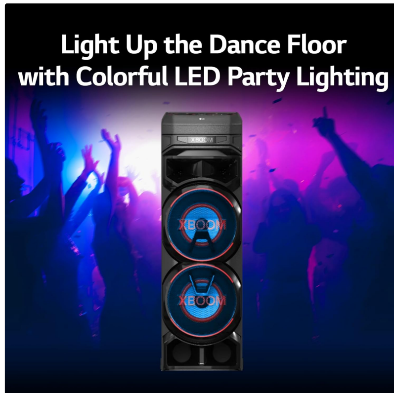
Figure 8: The LG XBOOM RNC9 speaker illuminated with vibrant blue and purple party lights, demonstrating its Multi-Color Lighting capability.

Integrated LED lights within the speaker change colors dynamically, synchronizing with the rhythm of the music. This feature adds a vibrant visual element, bringing excitement and energy to any gathering.