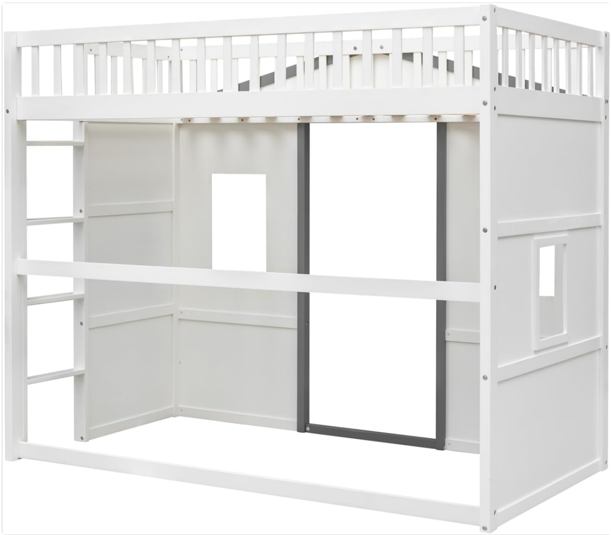
Image 6: A view from underneath the TRIPLE TREE Twin Size House Loft Bed, illustrating the spacious area available for play, storage, or a desk. The robust support structure for the loft is visible.