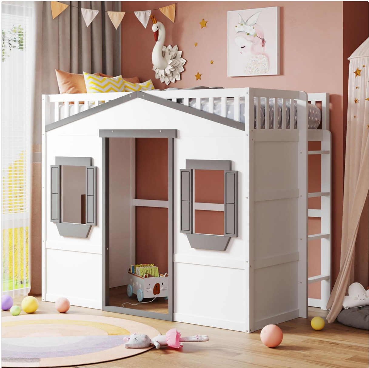
Image 1: The TRIPLE TREE Twin Size House Loft Bed, fully assembled, featuring its distinctive house design with windows and a door, and an integrated ladder. The bed is shown in a child's bedroom setting.