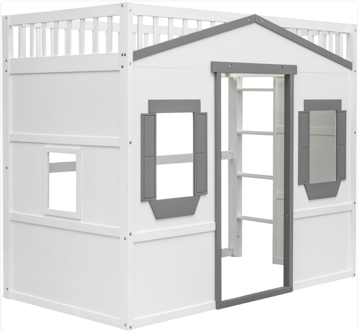
Image 5: Another side view of the TRIPLE TREE Twin Size House Loft Bed, clearly showing the integrated ladder for access to the upper bunk. The design allows for an open play or storage area beneath the bed.