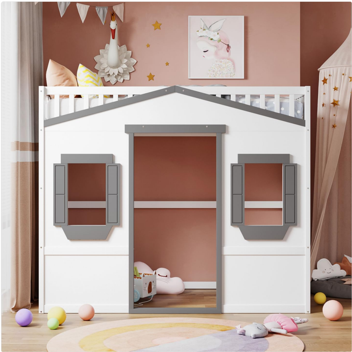
Image 2: A front-facing view of the TRIPLE TREE Twin Size House Loft Bed, highlighting the house-shaped structure with its roof, windows, and central door opening. The loft bed is designed to create a play space underneath.