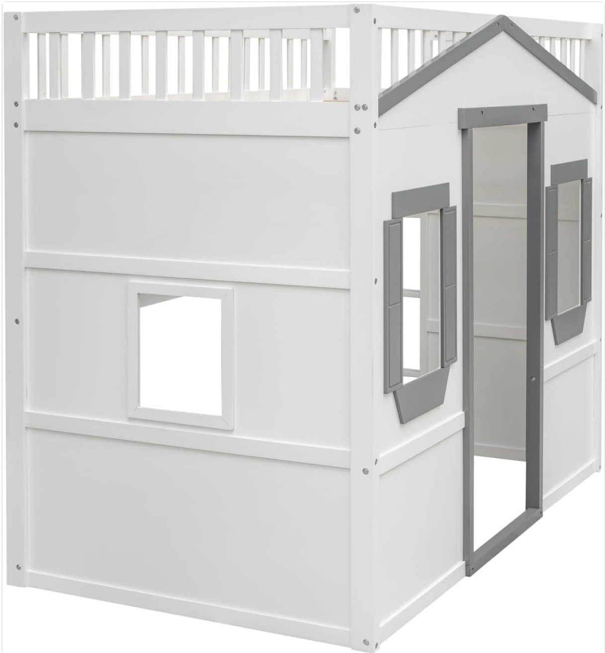
Image 4: A side perspective of the TRIPLE TREE Twin Size House Loft Bed, showcasing the depth of the house structure and the side window detail. The loft bed's sturdy construction is visible.