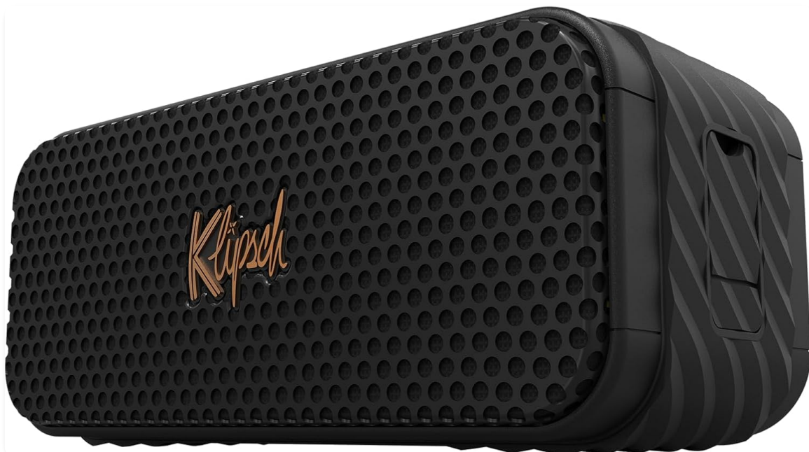
Image: The Klipsch Nashville Portable Bluetooth Speaker, showcasing its compact and rugged design.

Thank you for choosing the Klipsch Nashville Portable Bluetooth Speaker. This manual provides essential information for setting up, operating, and maintaining your speaker to ensure a premium audio experience. The Klipsch Nashville is designed to deliver powerful, 360-degree audio with exceptional durability and connectivity.