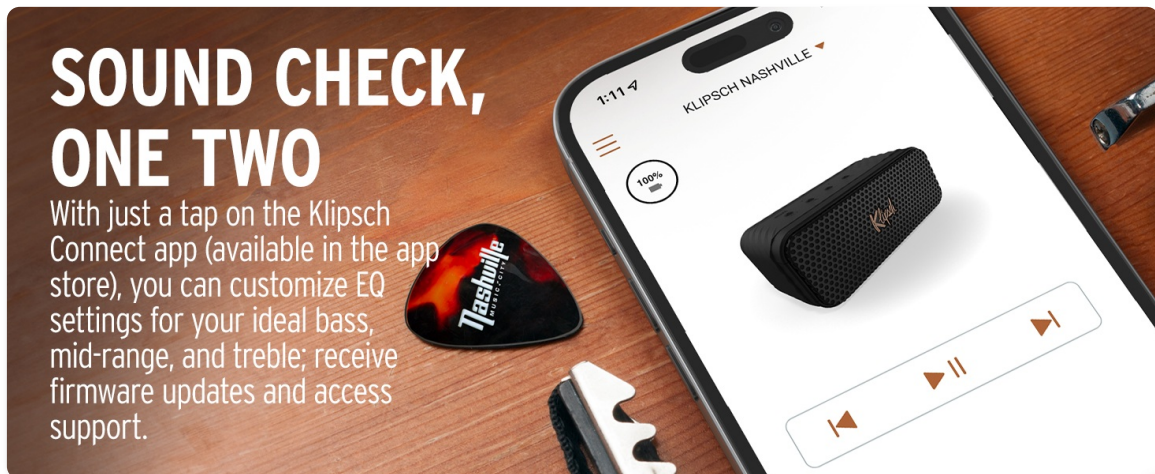
Image: Screenshot of the Klipsch Connect App interface, showing equalizer settings for bass, mid, and treble.