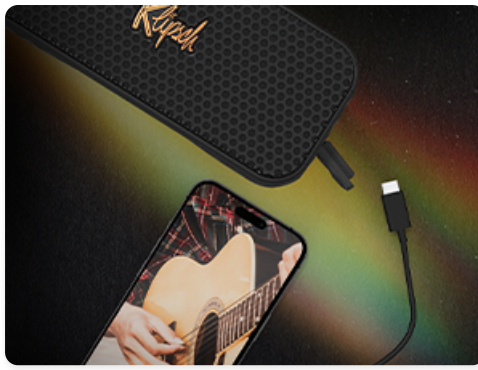
Image: A smartphone connected to the Klipsch Nashville speaker via USB-C, indicating reverse charging in progress.