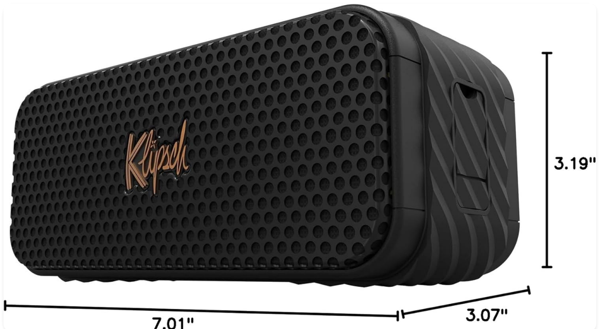
Image: The Klipsch Nashville speaker with its dimensions clearly labeled.