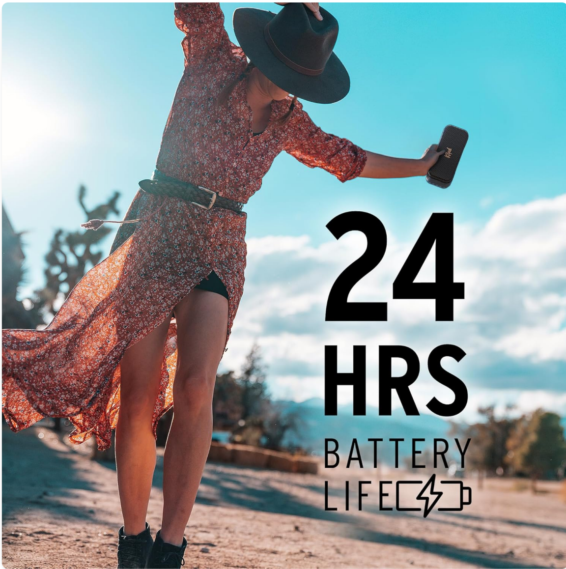
Image: A person holding the Klipsch Nashville speaker outdoors, with text indicating 24 hours of battery life.