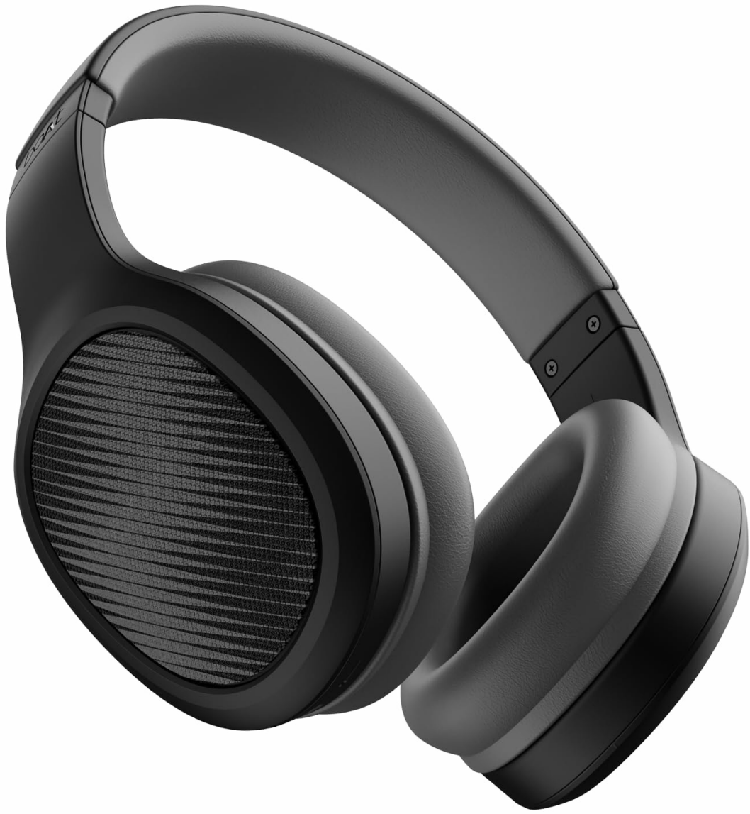
Image: boAt Rockerz 460 Wireless Over-Ear Headphones in Active Black, showcasing the sleek design.