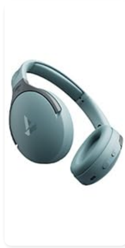
Image: A detailed view of the earcup with clearly labeled control buttons for easy access.