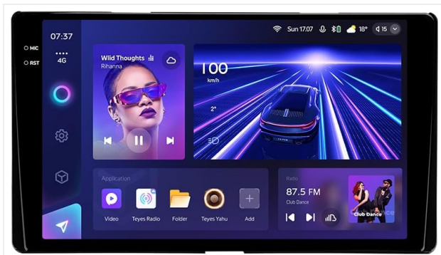
Head Unit CC3 2K: The main display and processing unit.

Verify that all items listed below are included in your package. If any items are missing or damaged, please contact customer support.