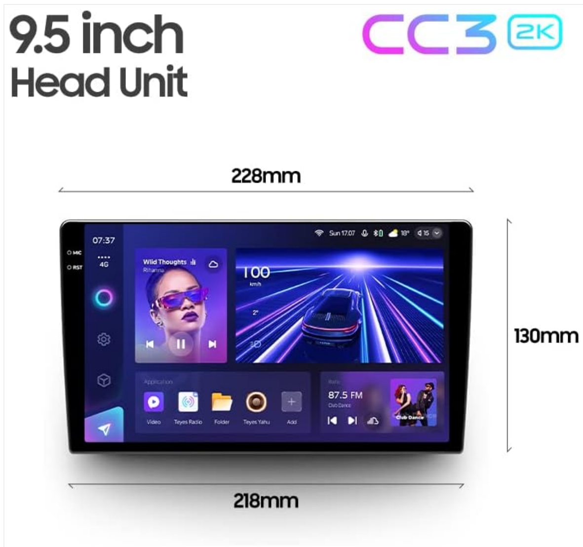
Image Description: A detailed view of the TEYES CC3 2K head unit's display, showcasing its modern user interface with various application icons for video, radio, folders, and Teyes.Yahu. It also displays a music player widget and a car speed indicator, illustrating the system's multimedia and informational capabilities.

Video Description: This video demonstrates the TEYES CC3 2K head unit's user interface and features, including its responsive touch screen, multimedia playback, and integration into a car dashboard. It highlights the visual quality and various functionalities of the system.