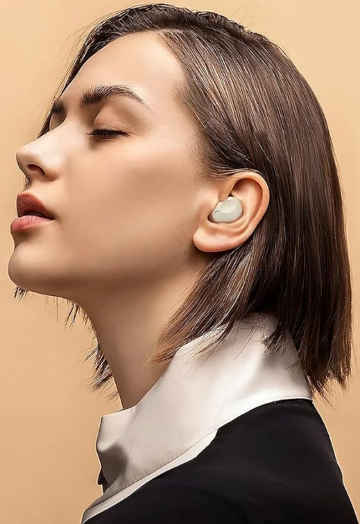
Image: Visual detailing the 28-hour long battery life with the charging case and the lightweight, comfortable design of the semi-in-ear earbuds.

Semi-in-ear, easy to wear without feeling, comfortable to wear for a long time, without pain.