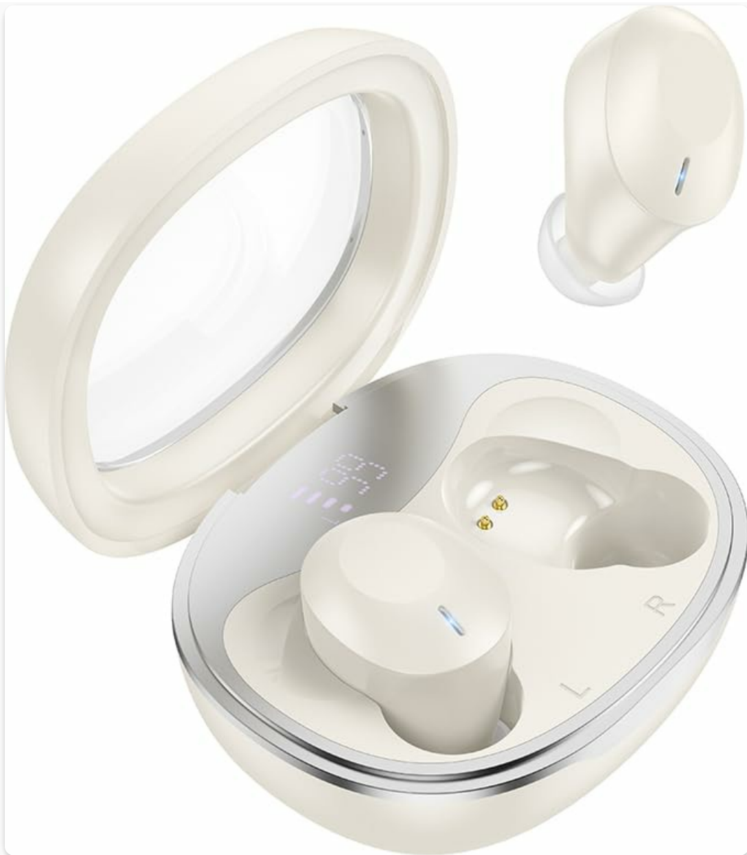
Image: HOCO EQ3 True Wireless Earbuds in their charging case, showcasing the transparent lid and compact design.