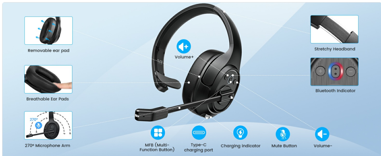
Image: Features illustrating the ergonomic design of the headset, including adjustable headband and rotatable microphone.