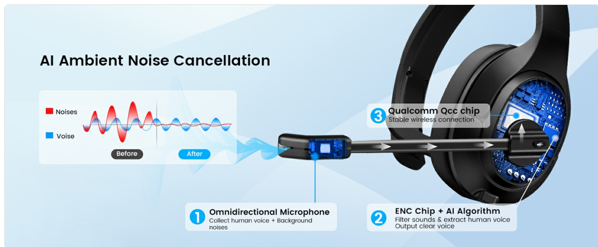
Image: A visual explanation of the ENC microphone's function, demonstrating noise reduction.