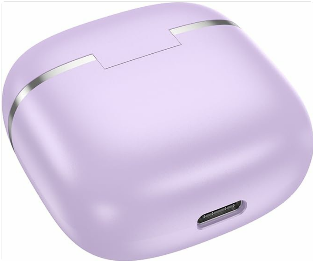
Image: Close-up view of the USB charging port on the HOCO EQ1 Earbuds charging case.