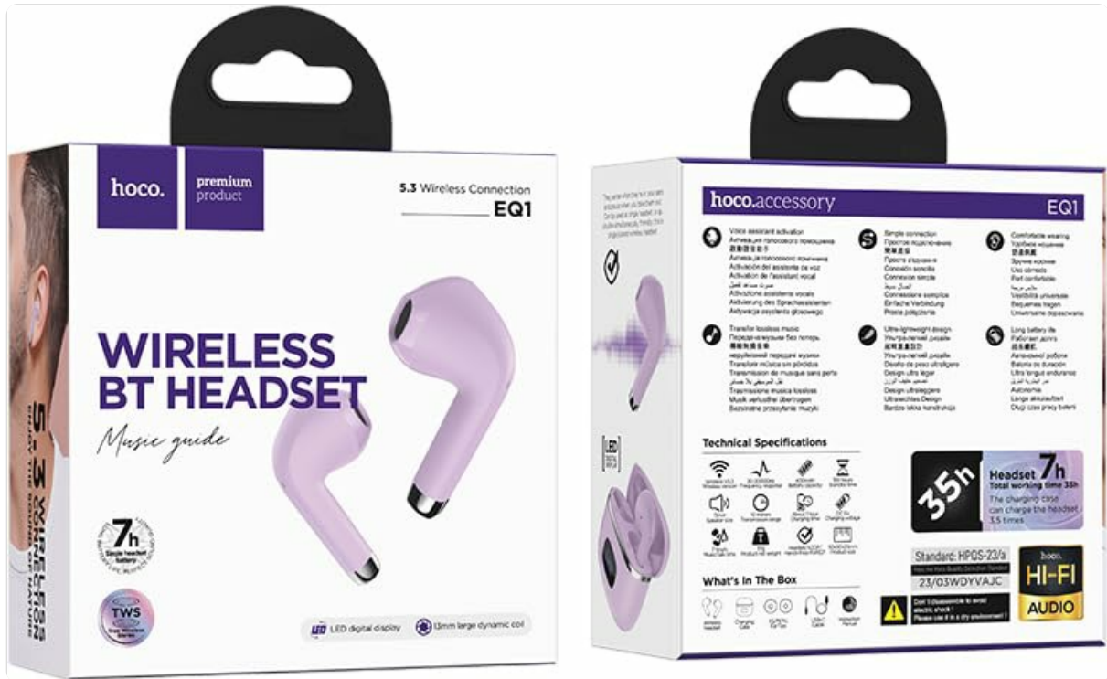
Image: Back of the HOCO EQ1 Wireless Bluetooth Headset packaging, displaying technical specifications and 'What's In The Box' contents, which include the cable, ear cushions, and protective case.