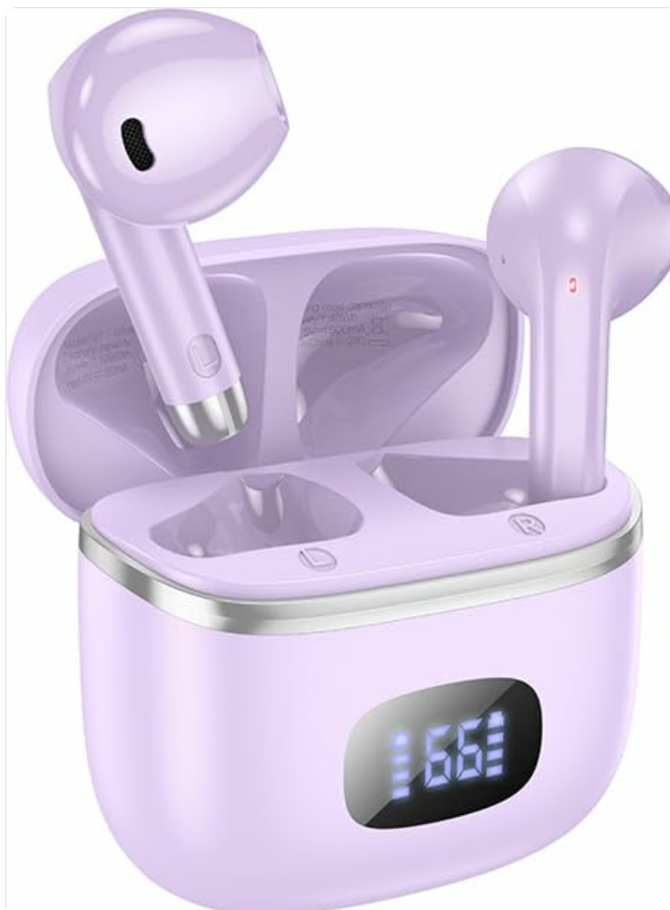
Image: HOCO EQ1 Wireless Earbuds in purple, resting in their open charging case, showing the earbuds and the digital battery display on the case.

The HOCO EQ1 Wireless Earbuds offer a superior audio experience with powerful deep bass and crystal-clear highs, designed for convenience and active lifestyles. Featuring Bluetooth 5.3 connectivity, intuitive touch controls, and water resistance, these earbuds are built to deliver uninterrupted music and calls.