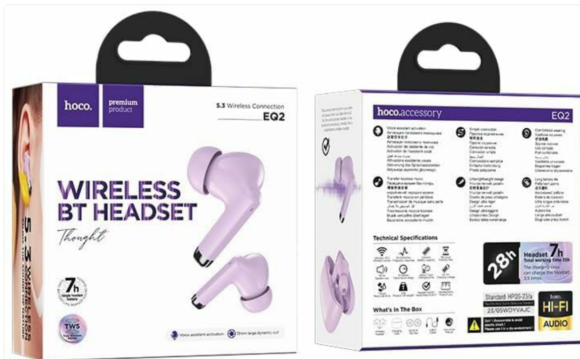
Image: The back view of the HOCO EQ2 charging case, showing the USB-C charging port.