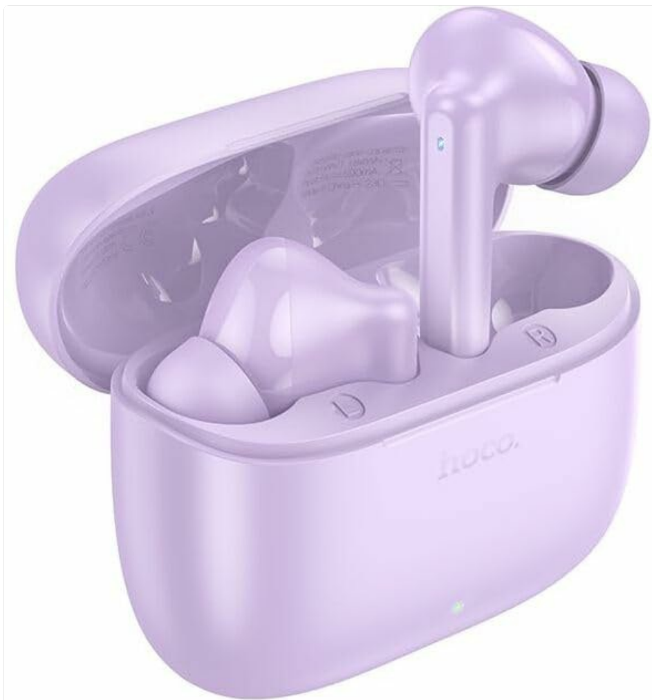
Image: A pair of purple HOCO EQ2 earbuds resting in their open charging case, showcasing their design.

The earbuds are available in personalized colors including Purple, White, and Black, allowing you to choose a style that suits you.