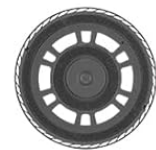
Mop Pad Holder x 2