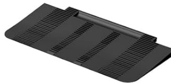
Base Station Ramp Extension Plate x 1