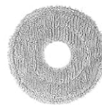
Mop Pad x 2