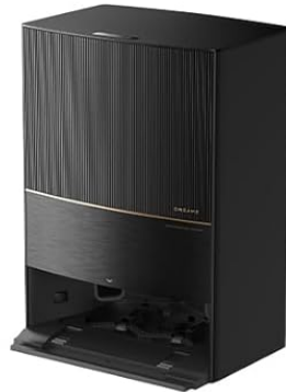
Base Station - Charging Dock x 1