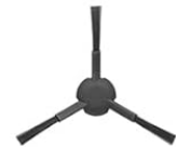
Side Brush x 1