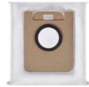
Dust Bag x 2