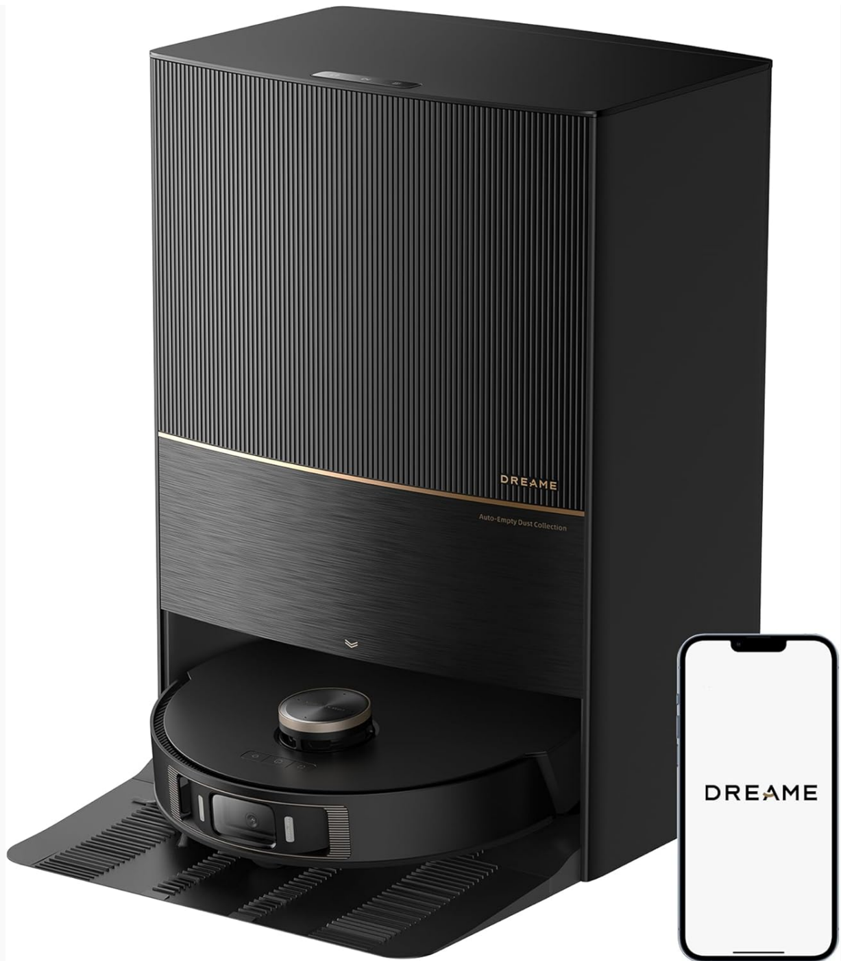
Figure 1: DREAME L20 Ultra Robot Vacuum and Mop with its automatic base station.