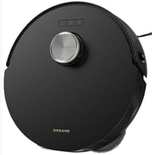
Robot x 1