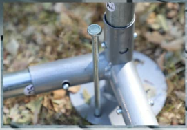
6 Big Ground Pegs