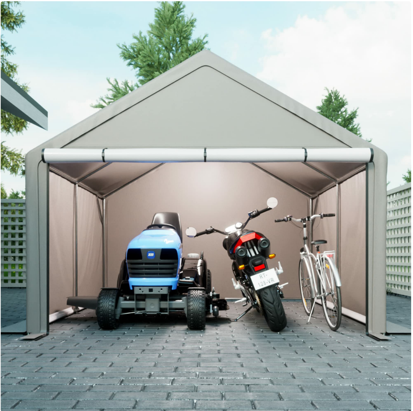
Image 5.3: Interior of the shed demonstrating storage for a lawn mower, motorcycle, and bicycle.

patio furniture, pool supplies, and firewood.