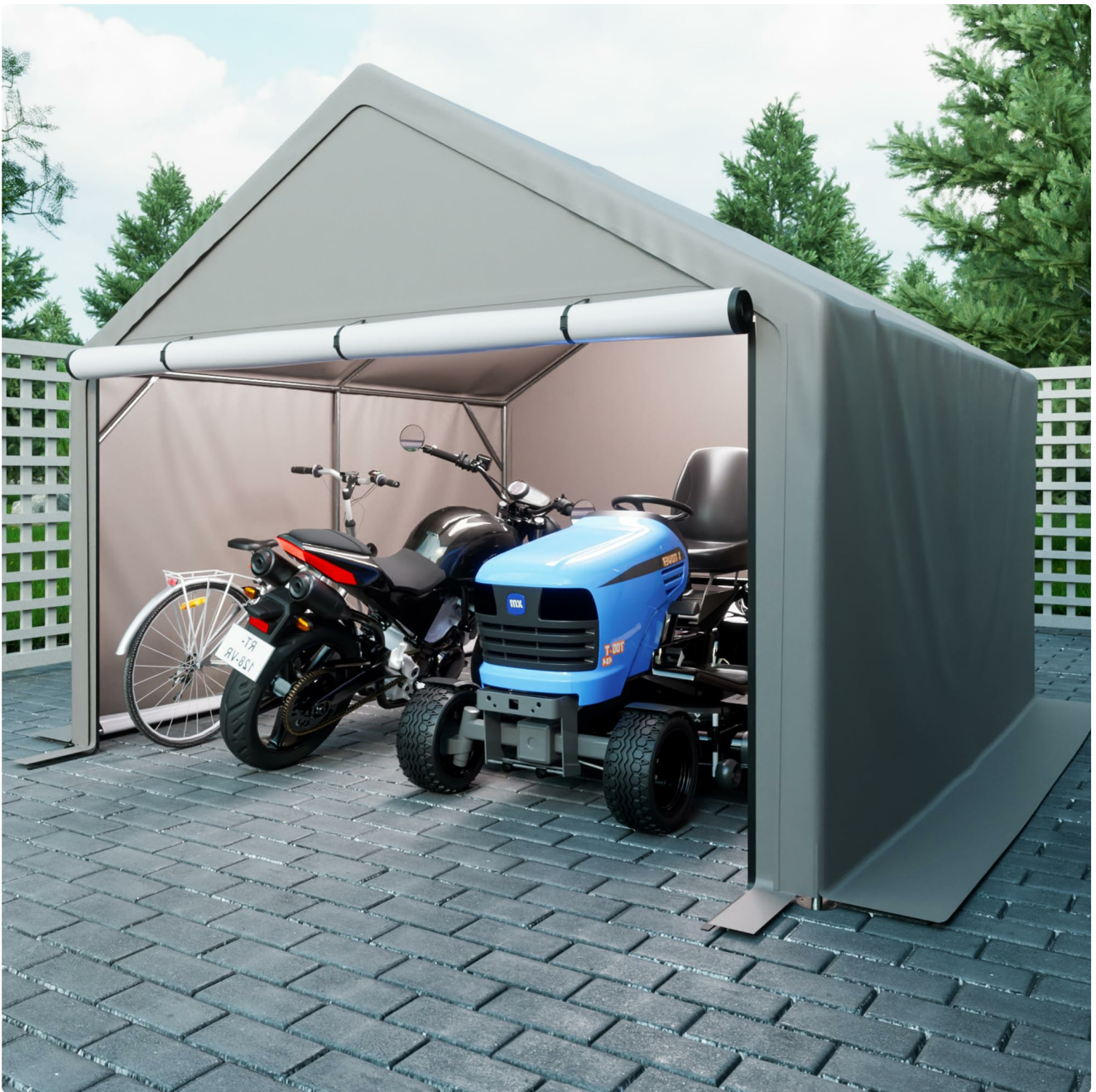
Image 1.1: Overall view of the Thanaddo 10x10 ft Portable Outdoor Storage Shelter Shed.