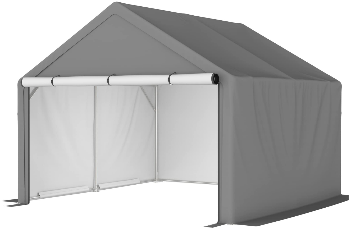
Image 5.1: Shed with the roll-up door open for access and ventilation.