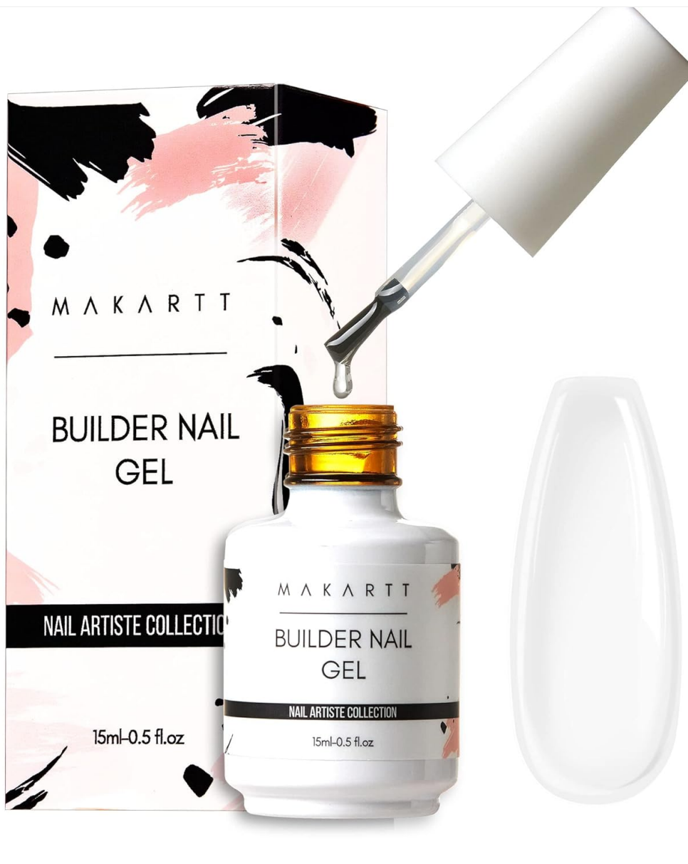
Image 1.1: Makartt Builder Nail Gel bottle and its product packaging.