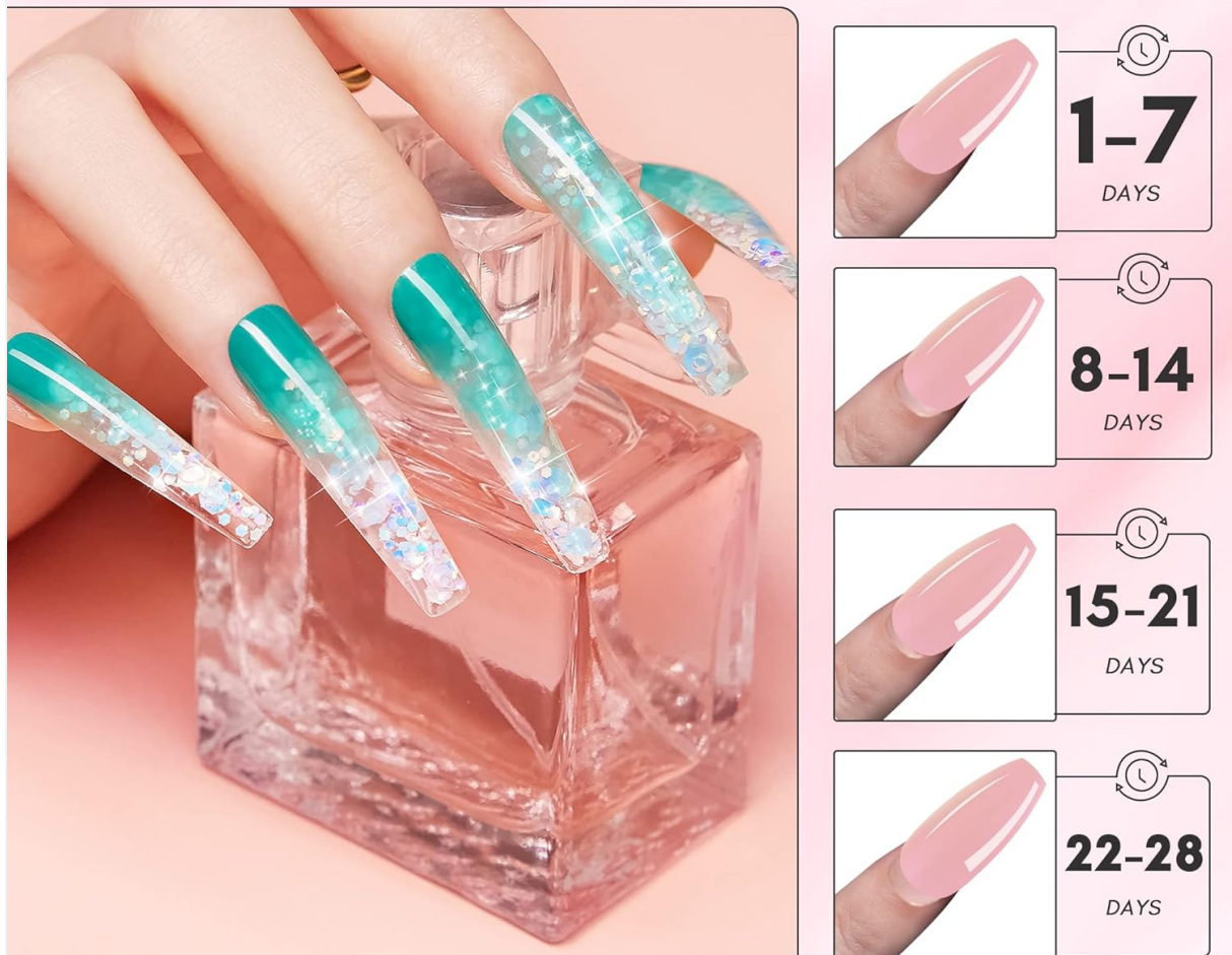
Image 7.1: Visual representation of the gel's durability, showing minimal cracking, lifting, or peeling over a period of 1 to 28 days.

LONG LASTING MORE THAN 4 WEEKS NO CRACKING, LIFTING, PEELING OFF