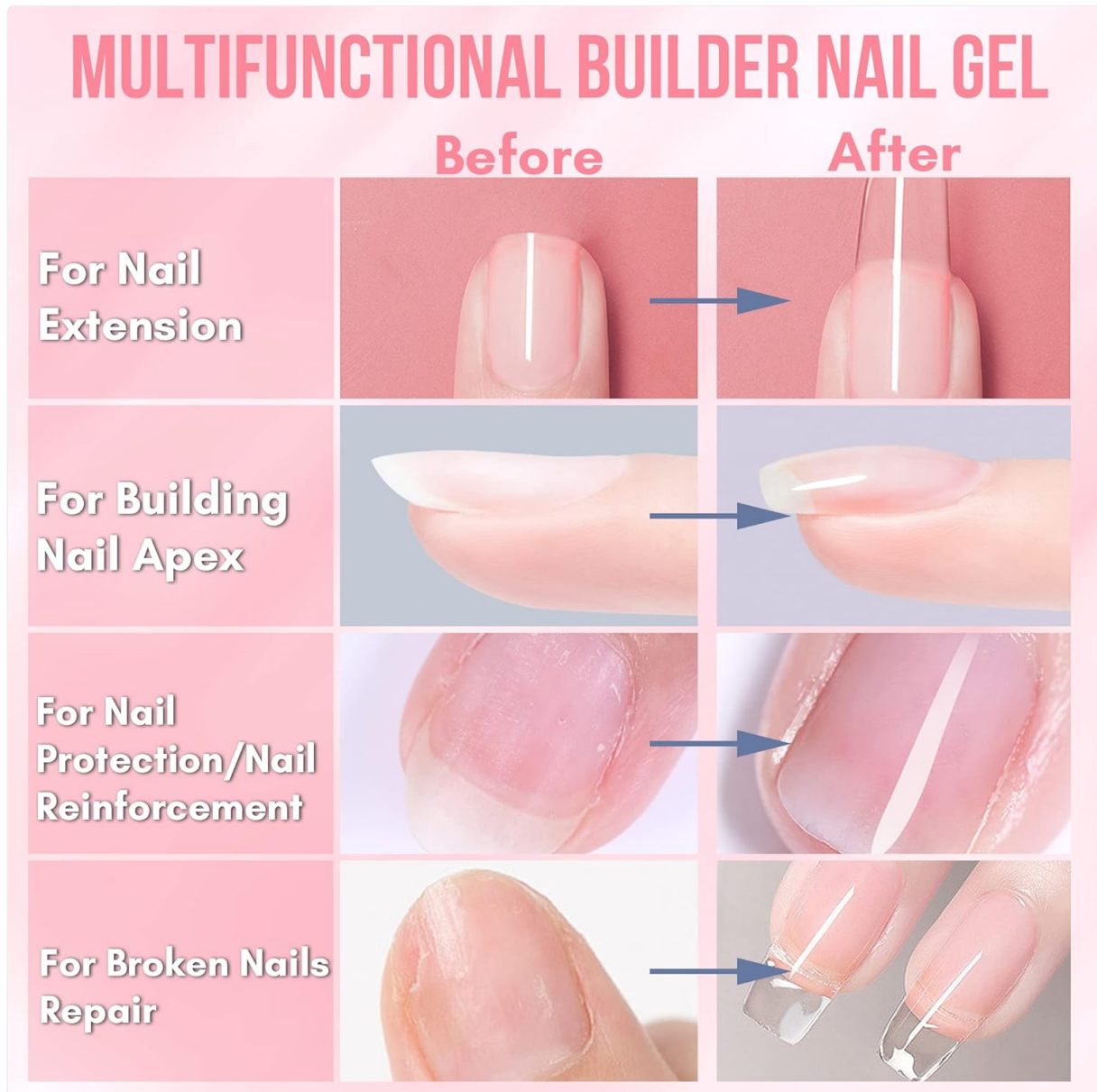
Image 5.2: Visual guide demonstrating the Builder Nail Gel's application for nail extension, building a nail apex, nail protection/reinforcement, and repairing broken nails.