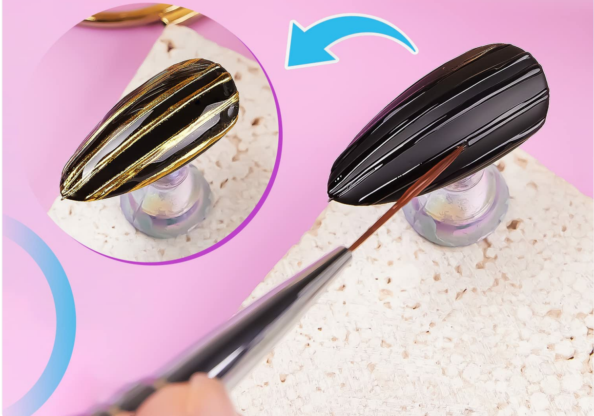
Image 5.4: A nail art brush applying the painting gel, highlighting its strong ductility for creating smooth and precise lines without sticking to the brush.

Can Smooth draw complete long lines in one go, and control the thickness of lines