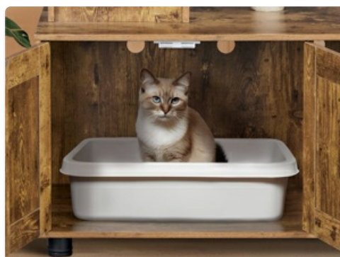
Image: A cat using a litter box inside the hidden enclosure.

The spacious bottom cabinet serves as a discreet enclosure for a standard small to medium-sized litter box. Open the front doors to place or remove the litter box. The enclosure features an internal scratching board at the entrance to help remove litter from your cat's paws, and ventilation holes to minimize odors.