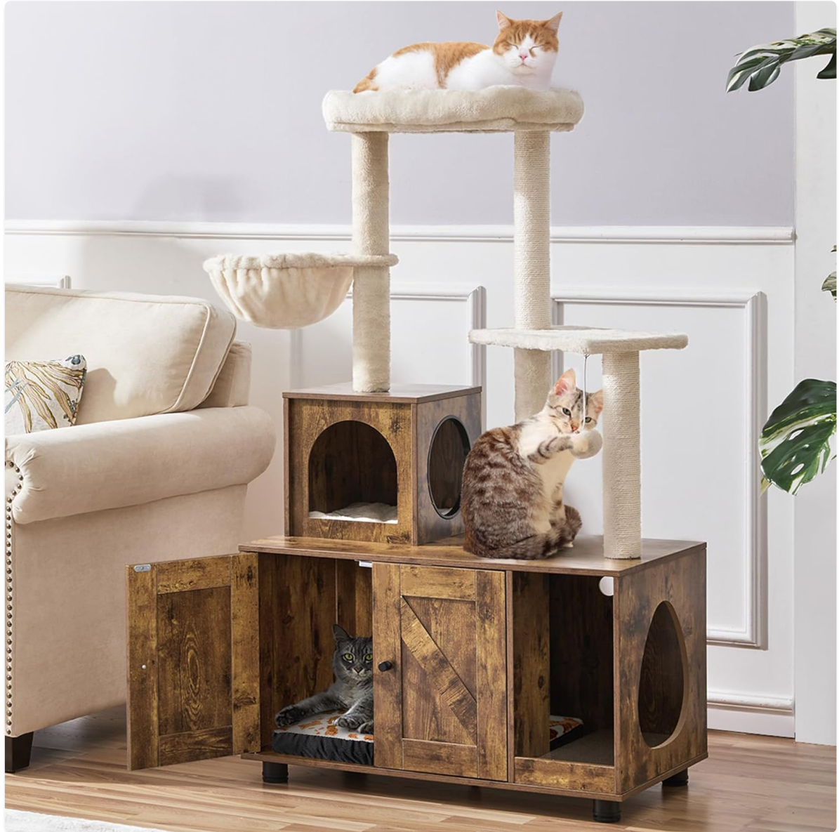
Image: Cats enjoying the various levels and features of the cat tree.

The cat tree features various levels, including a plush-covered top perch for observation, a soft basket for napping, and an enclosed condo for privacy and security. These areas offer comfortable resting spots for your cat.