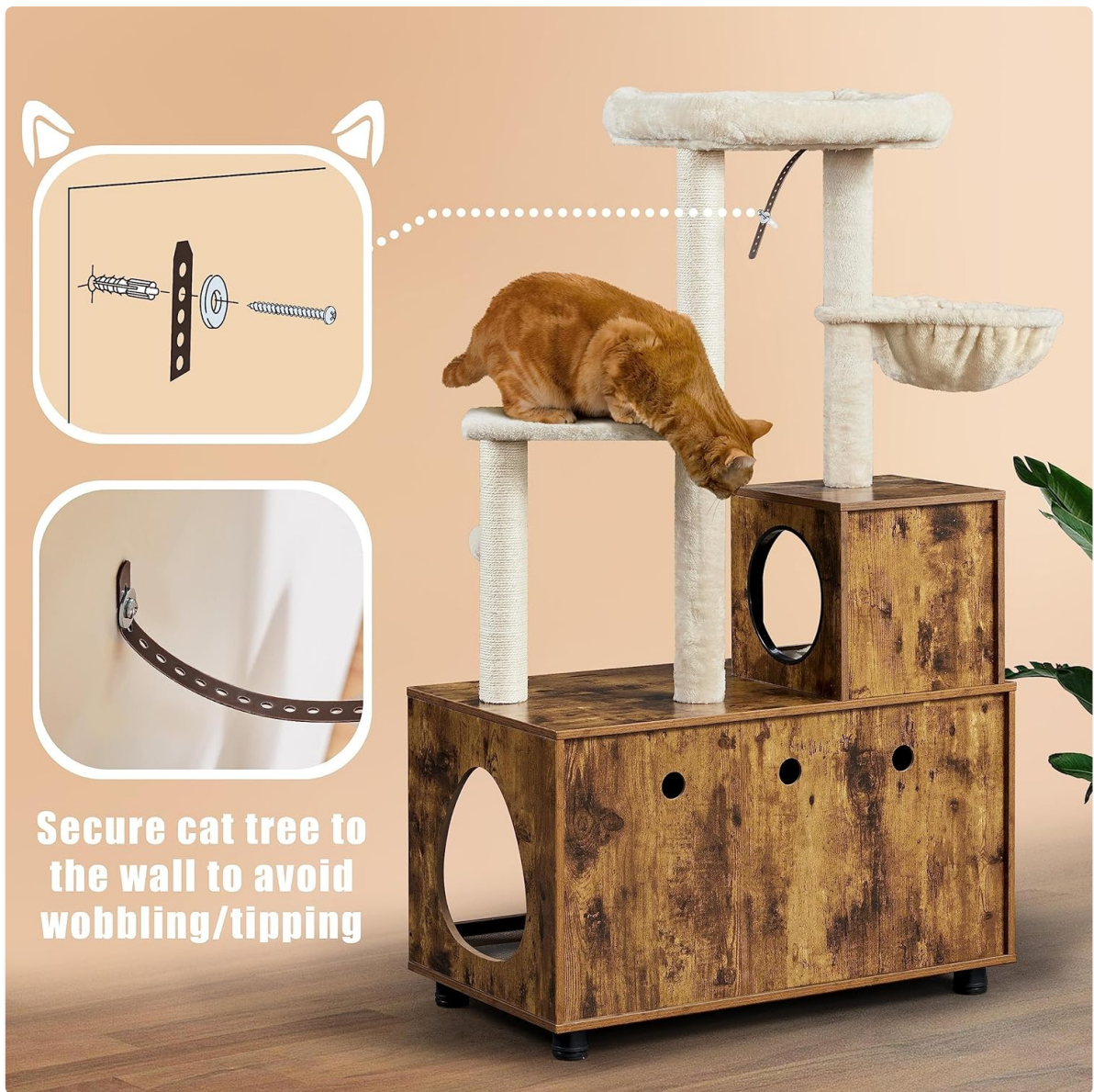
Image: Illustration demonstrating the proper method for attaching the anti-tipping strap to the cat tree and securing it to a wall.