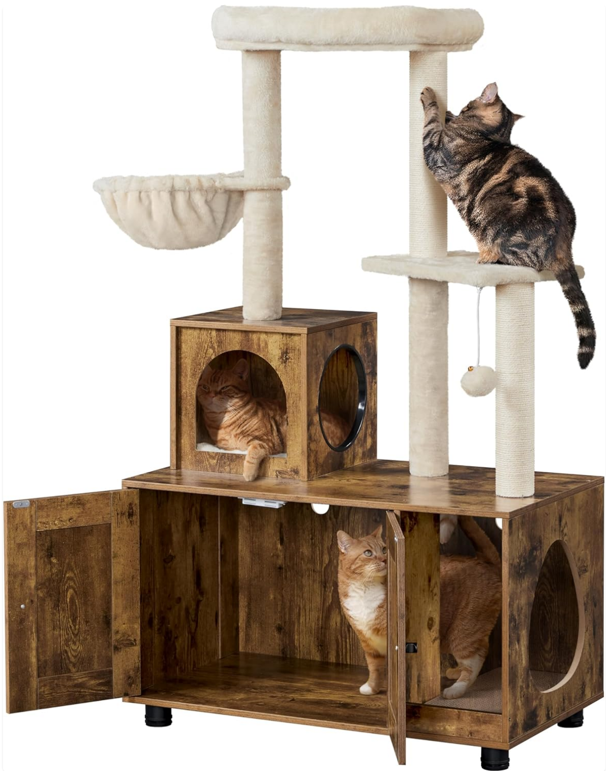
Image: The Yaheetech cat tree and litter box enclosure in a home setting, with cats utilizing the perches, scratching posts, and enclosed spaces.